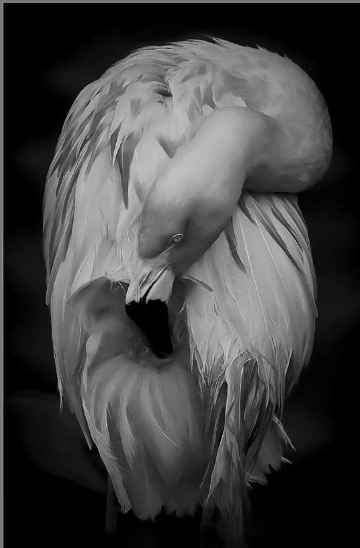
"FLAMINGO POP" by DEE MCMILLAN

Southern California Council of Camera Clubs