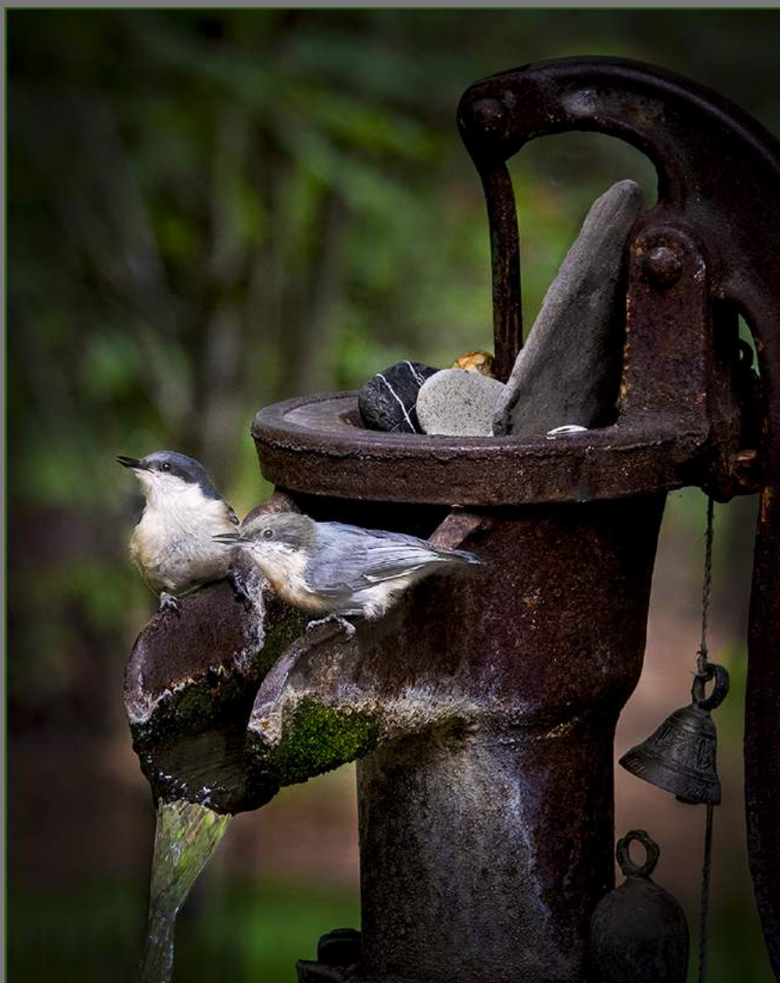
“TAKING A DRINK AT THE FOUNTAIN” by DEE MCMILLAN

Southern California Council of Camera Clubs