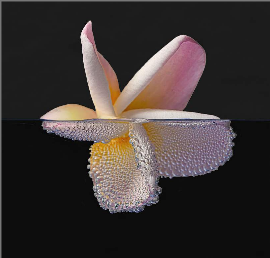
“PEARLS BELOW THE SURFACE” by BARBARA BURKE

Southern California Council of Camera Clubs