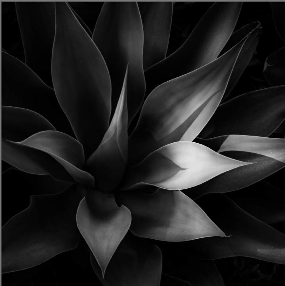
“AGAVE, SHADOWS AND LIGHT” by CRAIG TOMS

Southern California Council of Camera Clubs