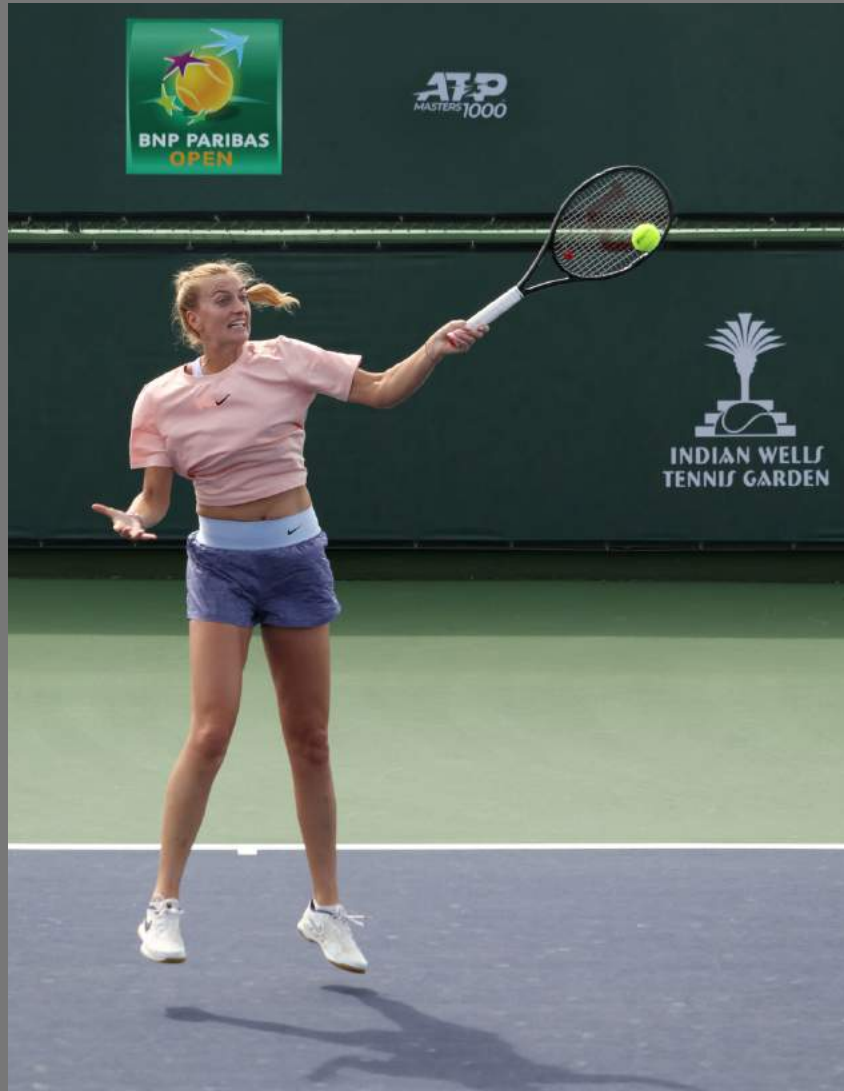
“PETRA KVITOVA RETURNS”

Southern California Council of Camera Clubs