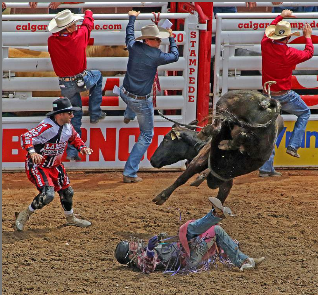
"BUCKING BULL OVER COWBOY 0903" by CHARLES STRICKER

Southern California Council of Camera Clubs