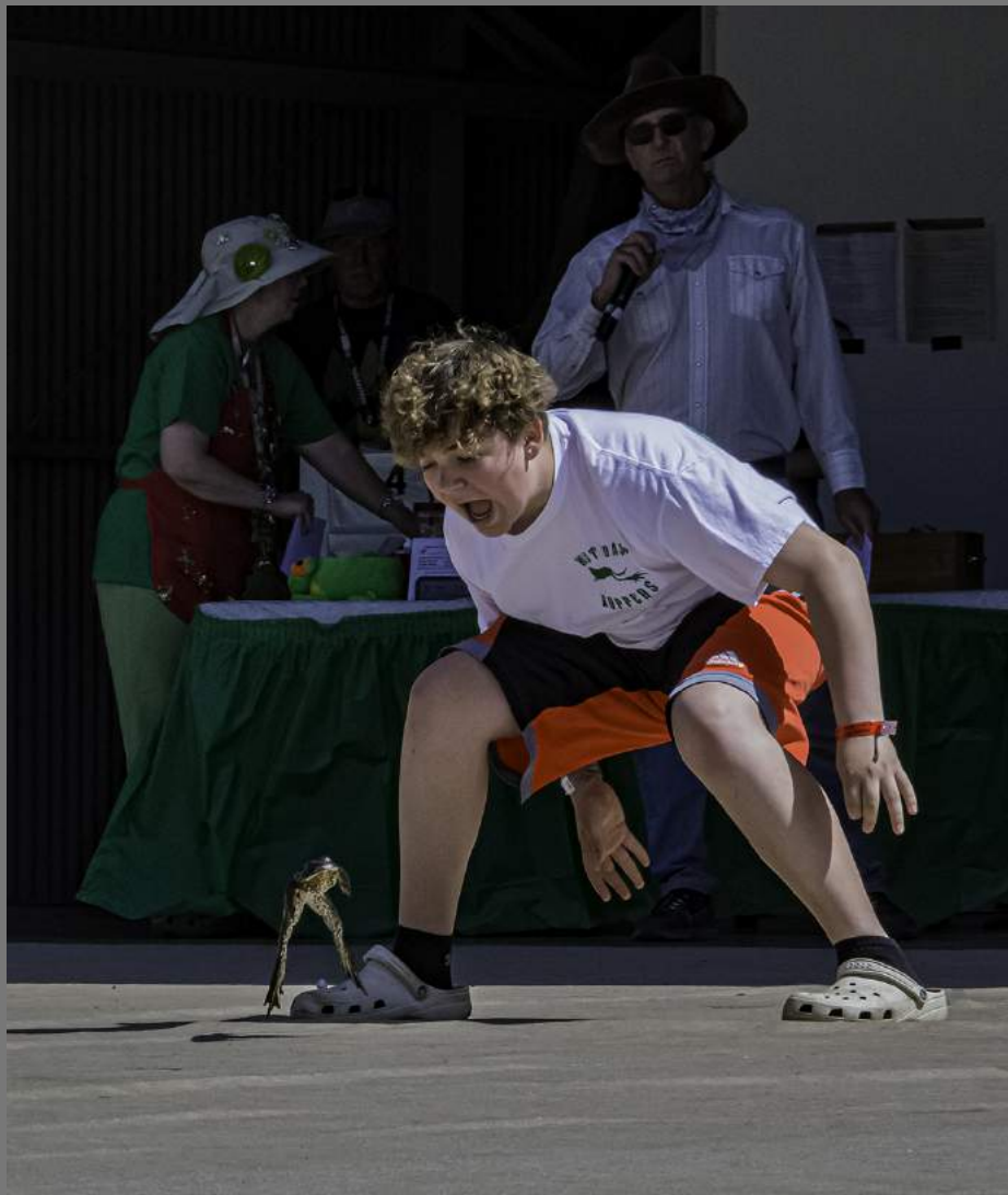
“CALAVERAS FROG JUMPING CONTEST 2” by JOHN BEISHKE

Southern California Council of Camera Clubs