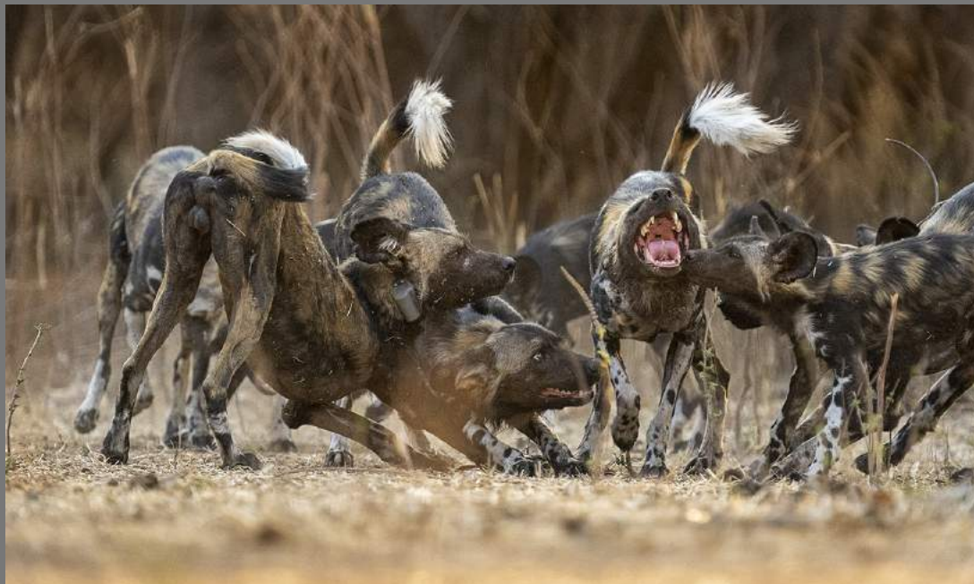
“AFRICAN WILD DOG PUPS BEGGING” by LILLIAN ROBERTS

Southern California Council of Camera Clubs