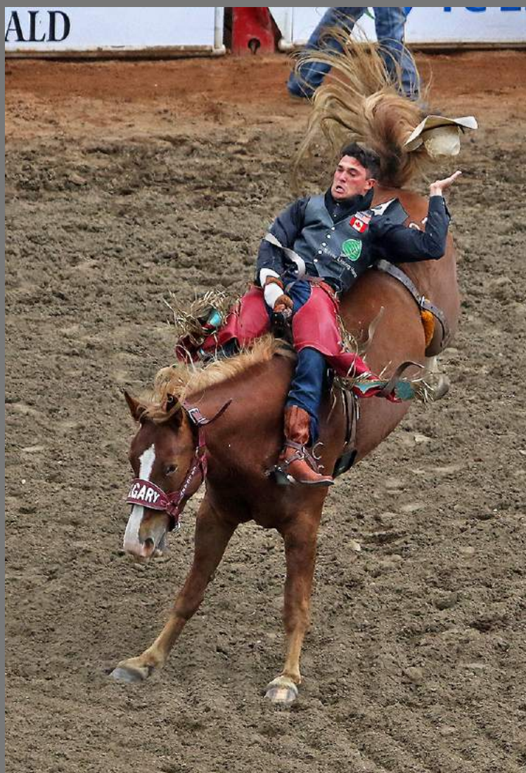
“COWBOY RIDES BUCKING HORSE 0872” by CHARLES STRICKER

Southern California Council of Camera Clubs