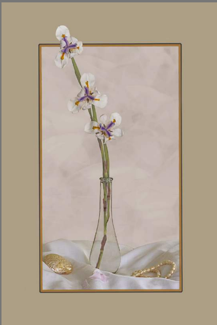
"THE CALIFORNIA IRIS" by BARBARA BURKE

Southern California Council of Camera Clubs