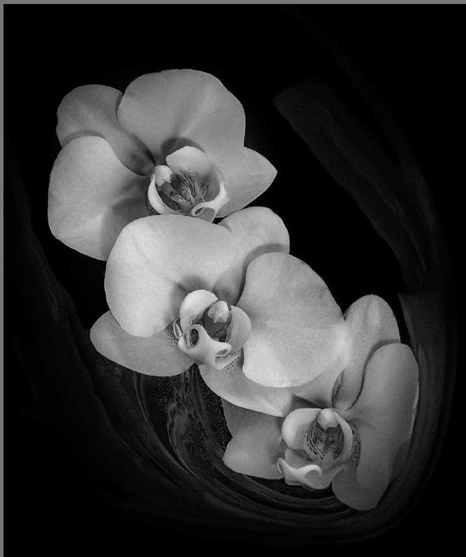
"ORCHID WHITES" by DEE MCMILLAN

Southern California Council of Camera Clubs