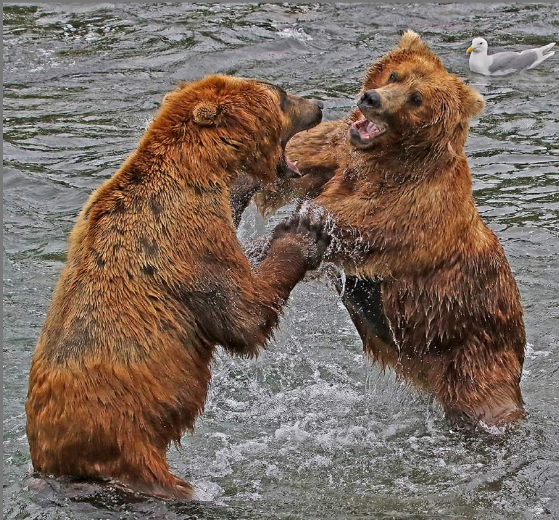
“BEARS FIGHT IN RIVER 0825” by CHARLES STRICKER

Southern California Council of Camera Clubs