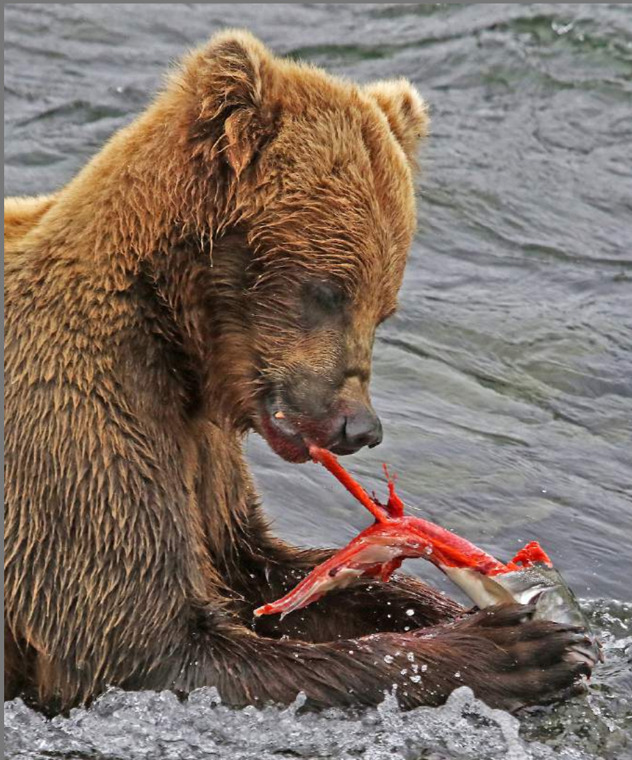
“BEAR EATS FRESH SALMON 0580” by CHARLES STRICKER

Southern California Council of Camera Clubs