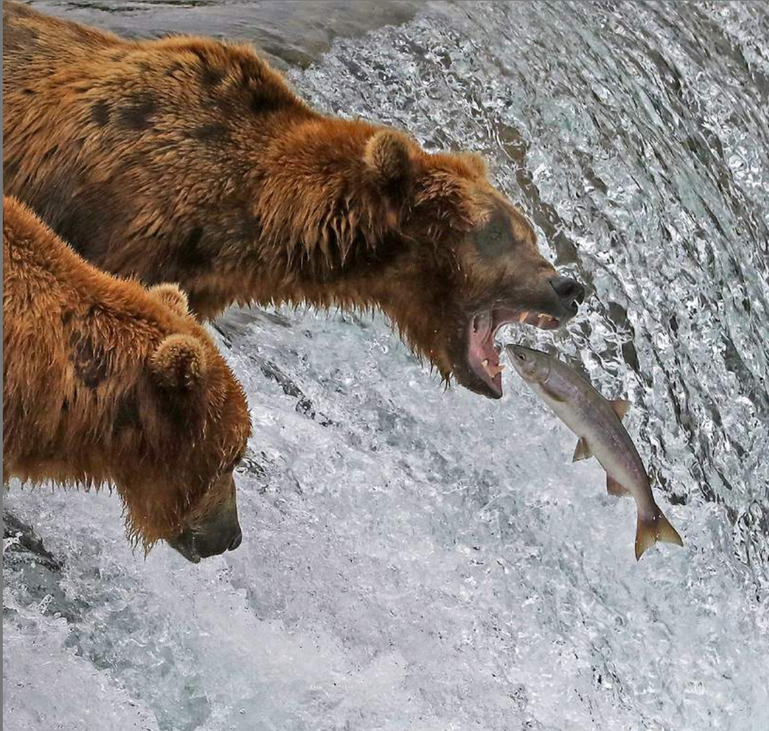
“SALMON JUMPS INTO BEARS MOUTH 0217” by CHARLES STRICKER

Southern California Council of Camera Clubs