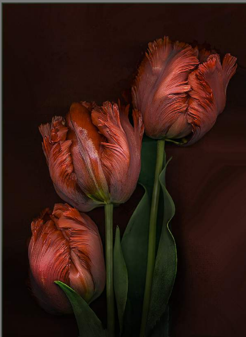
“TULIP 31” by DEE MCMILLAN

Southern California Council of Camera Clubs