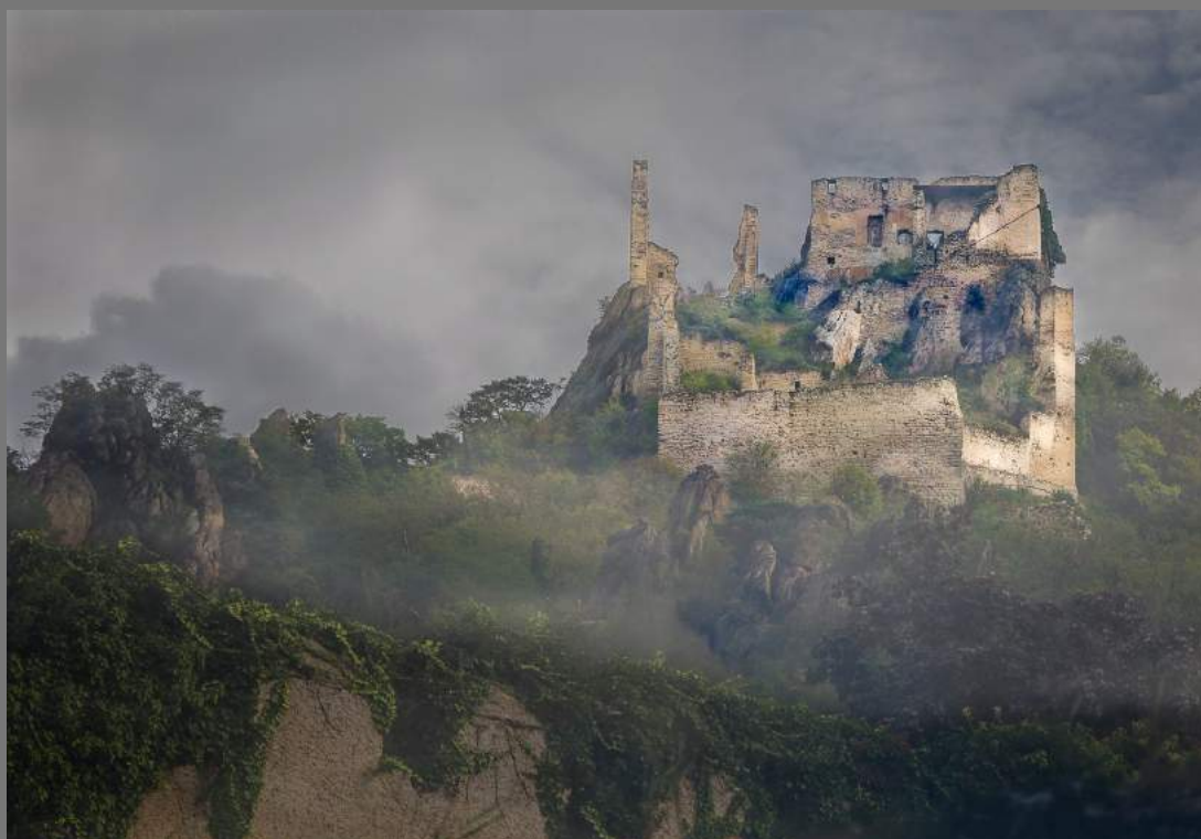
“DURNSTEIN CASTLE” by DEAN CAMPBELL

Southern California Council of Camera Clubs