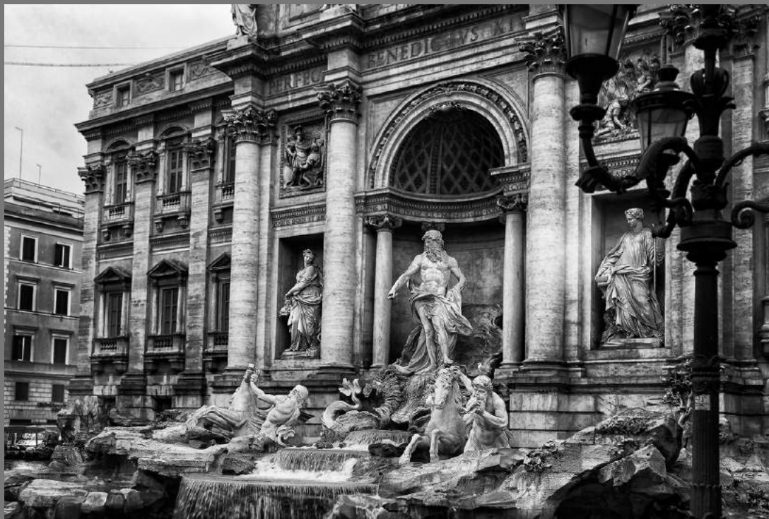
"TREVI FOUNTAIN ROME" by JAMES WAT

Southern California Council of Camera Clubs