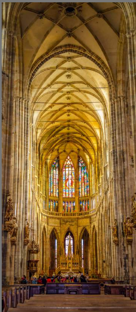
"ST. VITUS CATHEDRAL" by DEAN CAMPBELL

Southern California Council of Camera Clubs