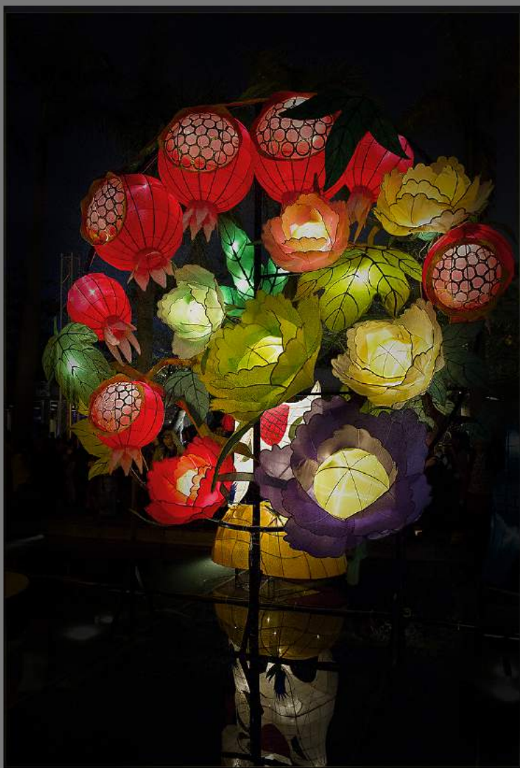
"CELEBRATING MID AUTUMN FESTIVAL" by JAMES WAT

Southern California Council of Camera Clubs