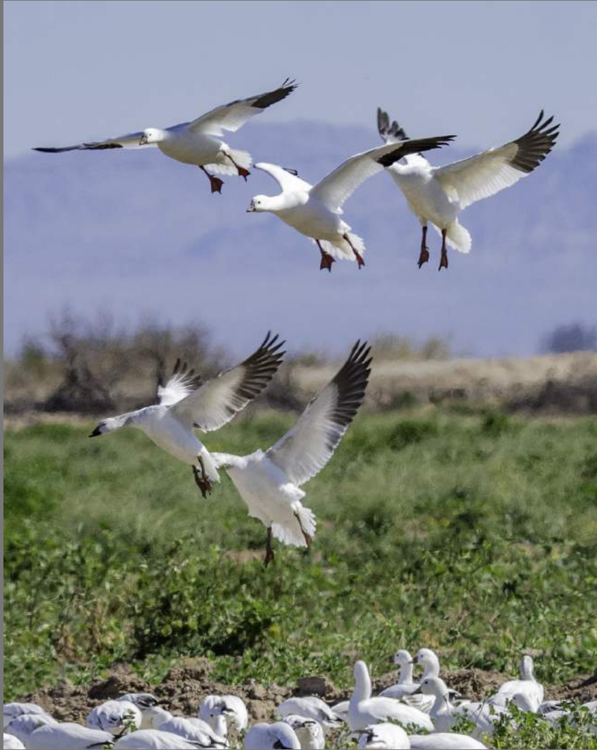
“SNOW GEESE-311” by ELLLENA VASQUEZ

Southern California Council of Camera Clubs