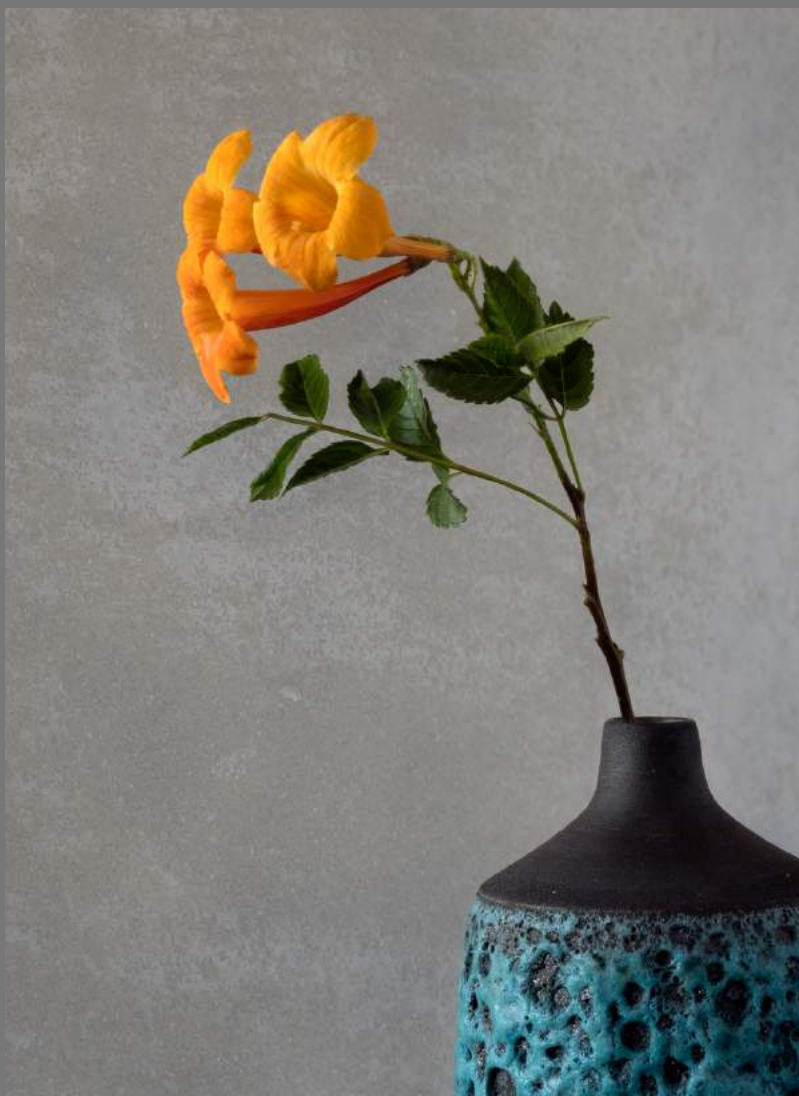
“FLOWER IN VASE” by ELOISE CARSON

Southern California Council of Camera Clubs