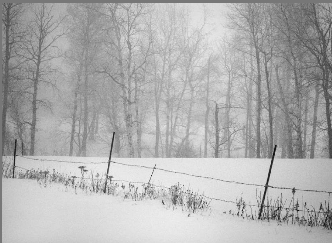
“FOGGY MORNING IN THE BOG” by JUDITH NAGEL

Southern California Council of Camera Clubs