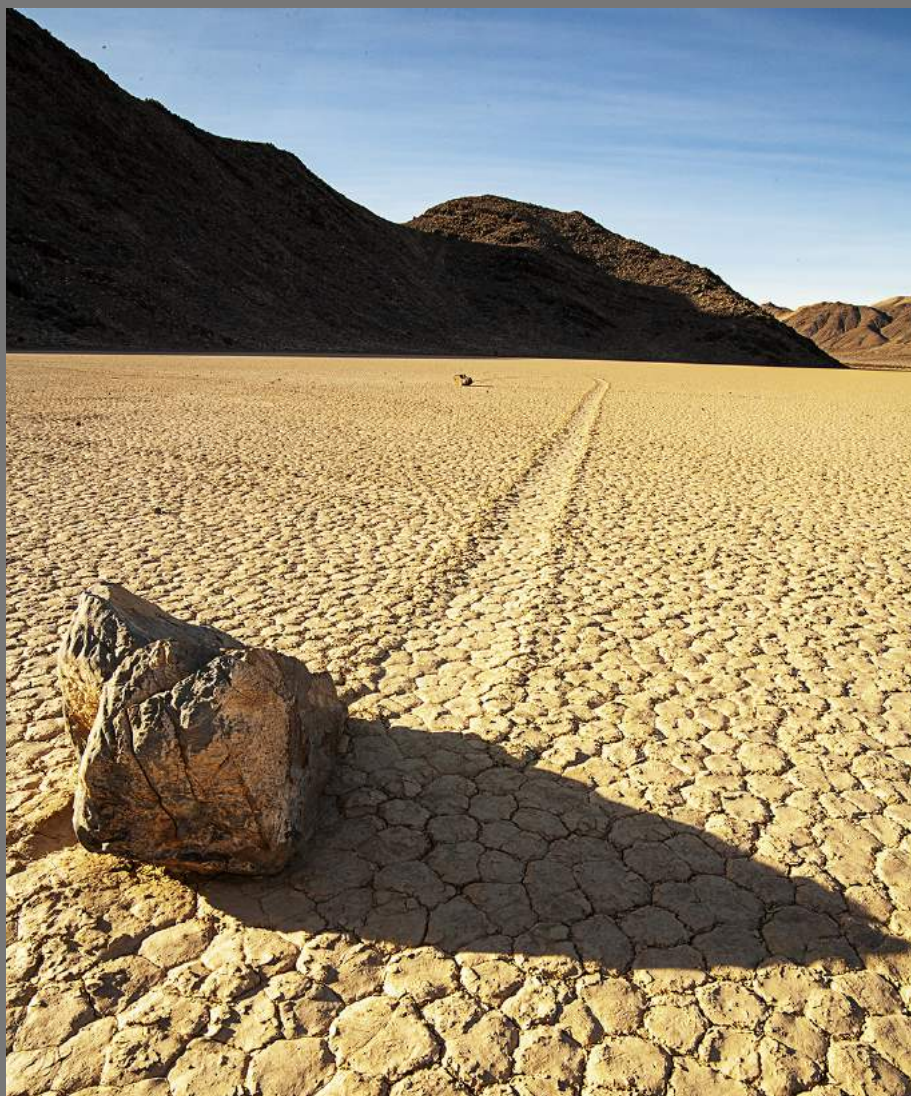
“RACETRACK VERTICAL 01” by LILLIAN ROBERTS

Southern California Council of Camera Clubs