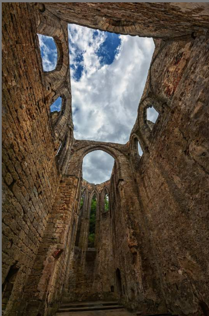
“STONE WALLS” by HANA NOVAK

Southern California Council of Camera Clubs