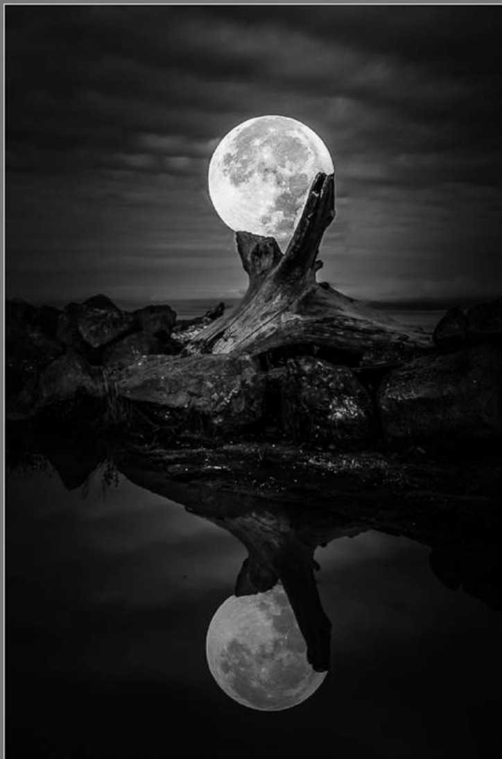
"HOLDING THE MOON" by WITTA PRIESTER

Southern California Council of Camera Clubs