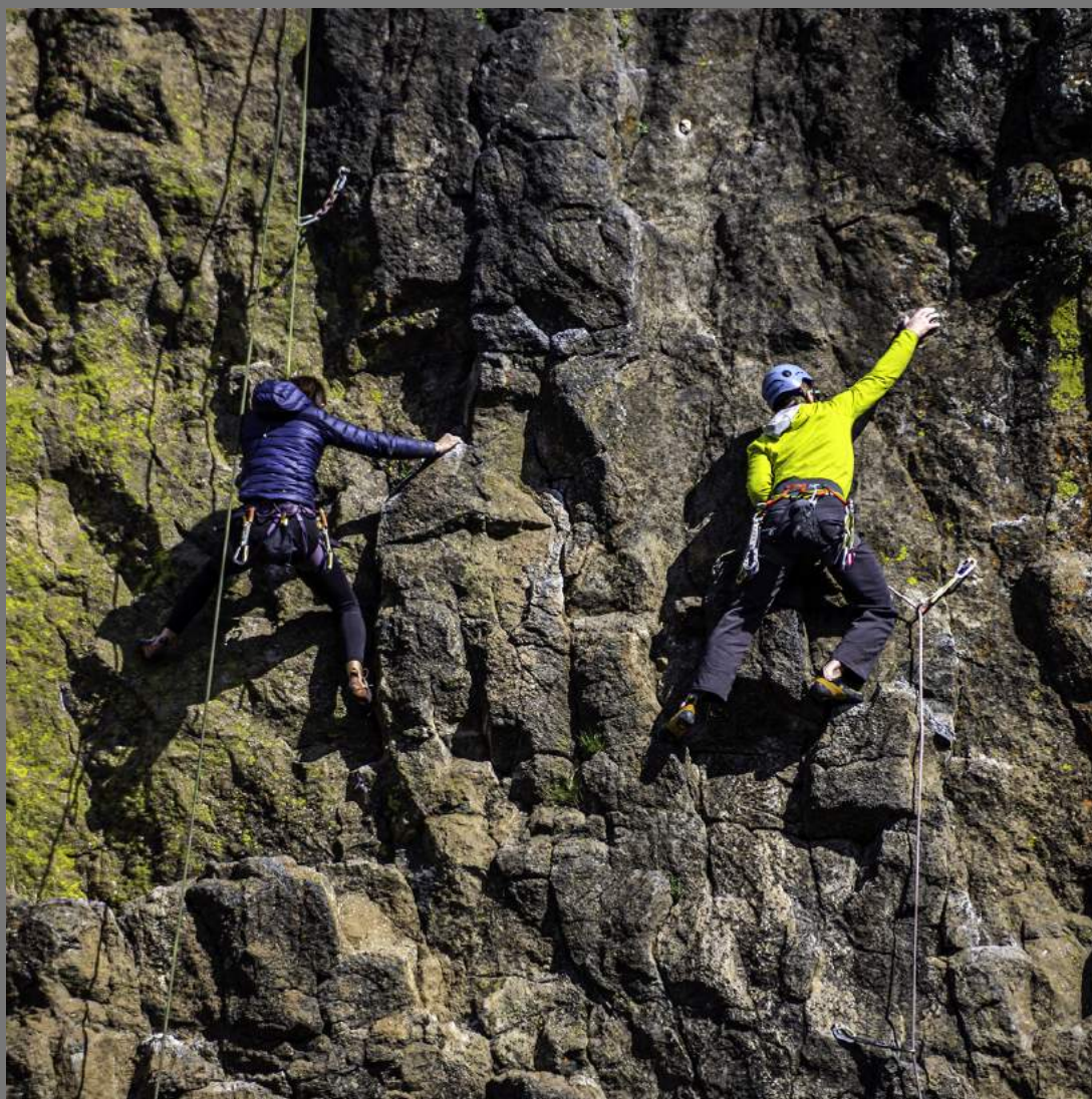
"TABLE MOUNTAIN CLIMBERS 2" by JOHN BEISHKE

Southern California Council of Camera Clubs