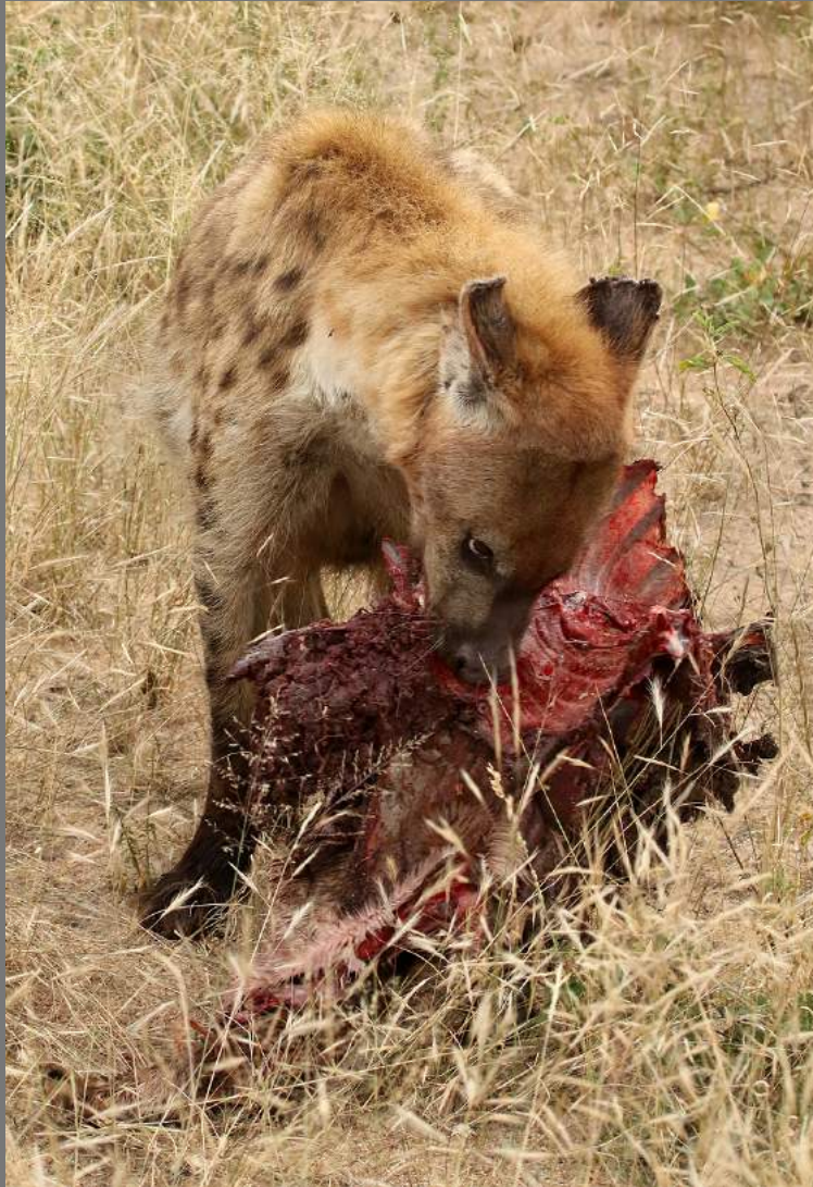
“HYENA MAULS CARCASS 3374” by CHARLES STRICKER

Southern California Council of Camera Clubs