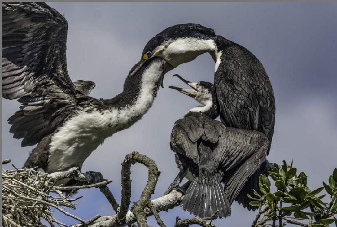
"Cormorant-416" by ELLLENA VASQUEZ

Southern California Council of Camera Clubs