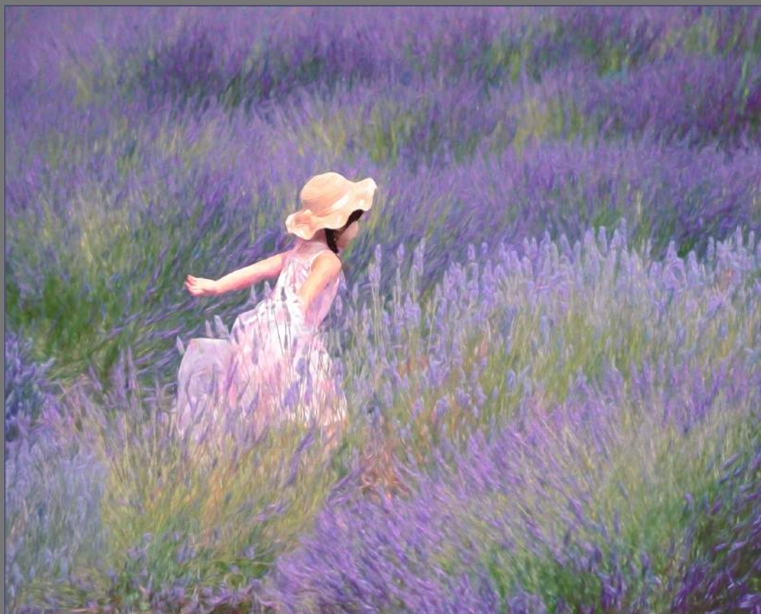
“LAVENDAR RUNNING” by WITTA PRIESTER

Southern California Council of Camera Clubs