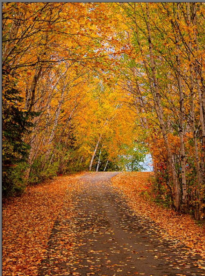
“A WALK TO THE LAKE” by JUDITH NAGEL

Southern California Council of Camera Clubs