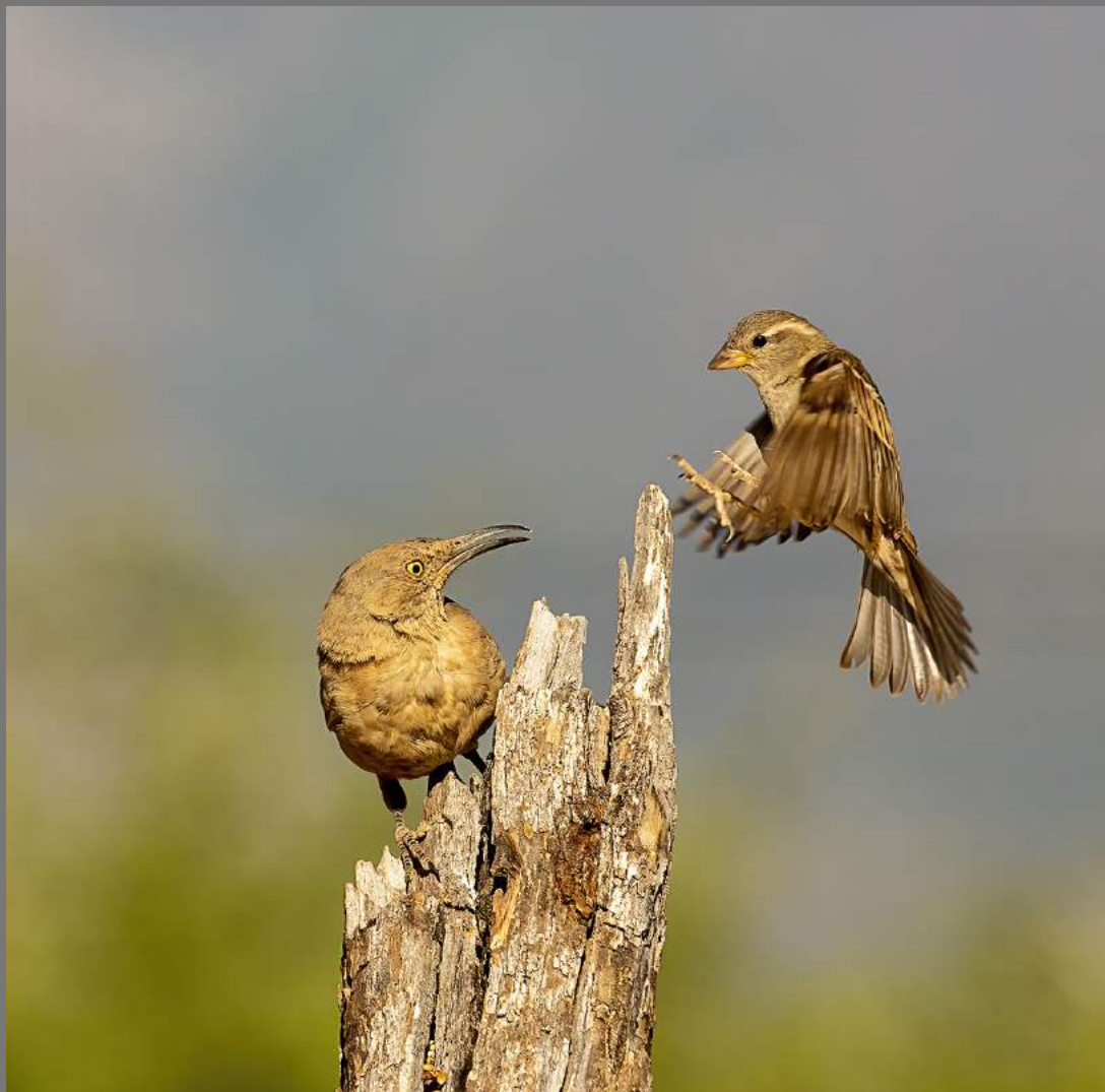
“EFFRONTERY” by LILLIAN ROBERTS

Southern California Council of Camera Clubs