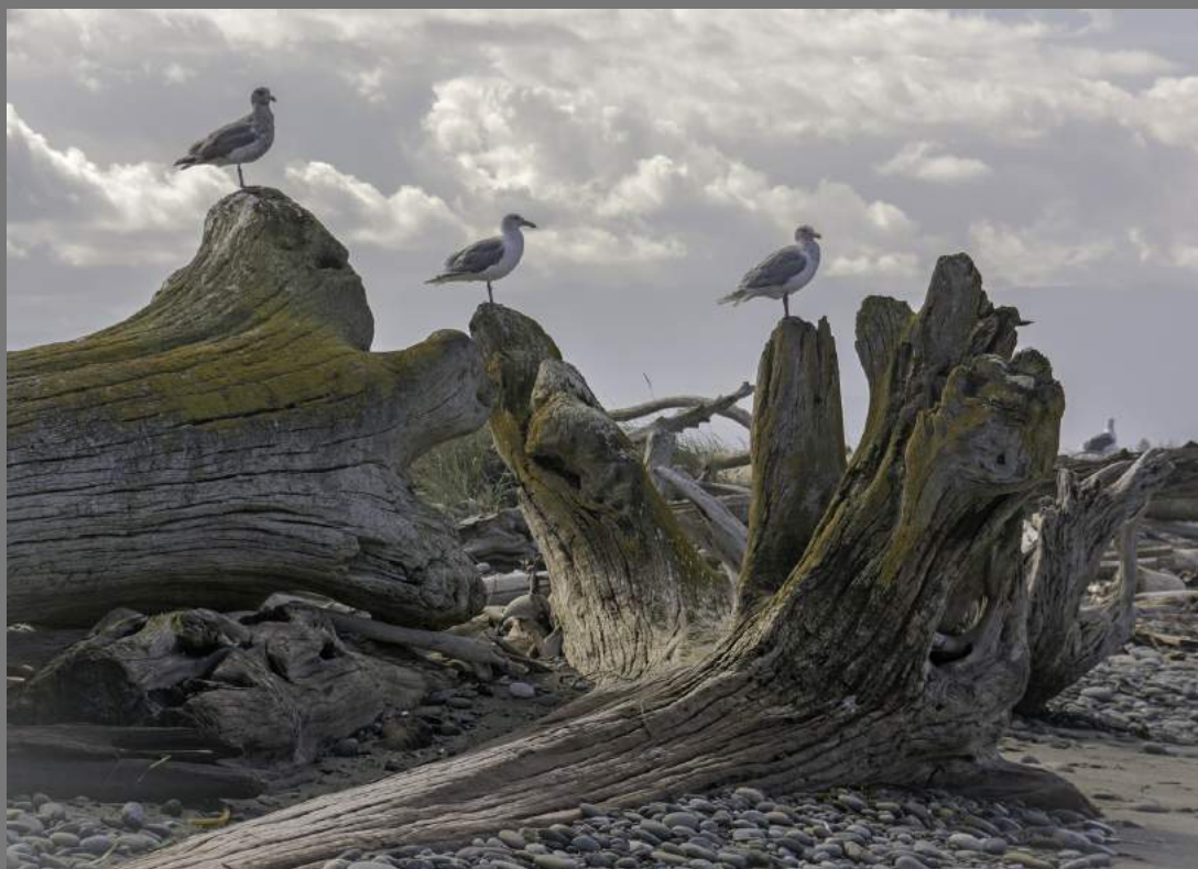
“Dungeness Spit-317” by ELLLENA VASQUEZ

Southern California Council of Camera Clubs