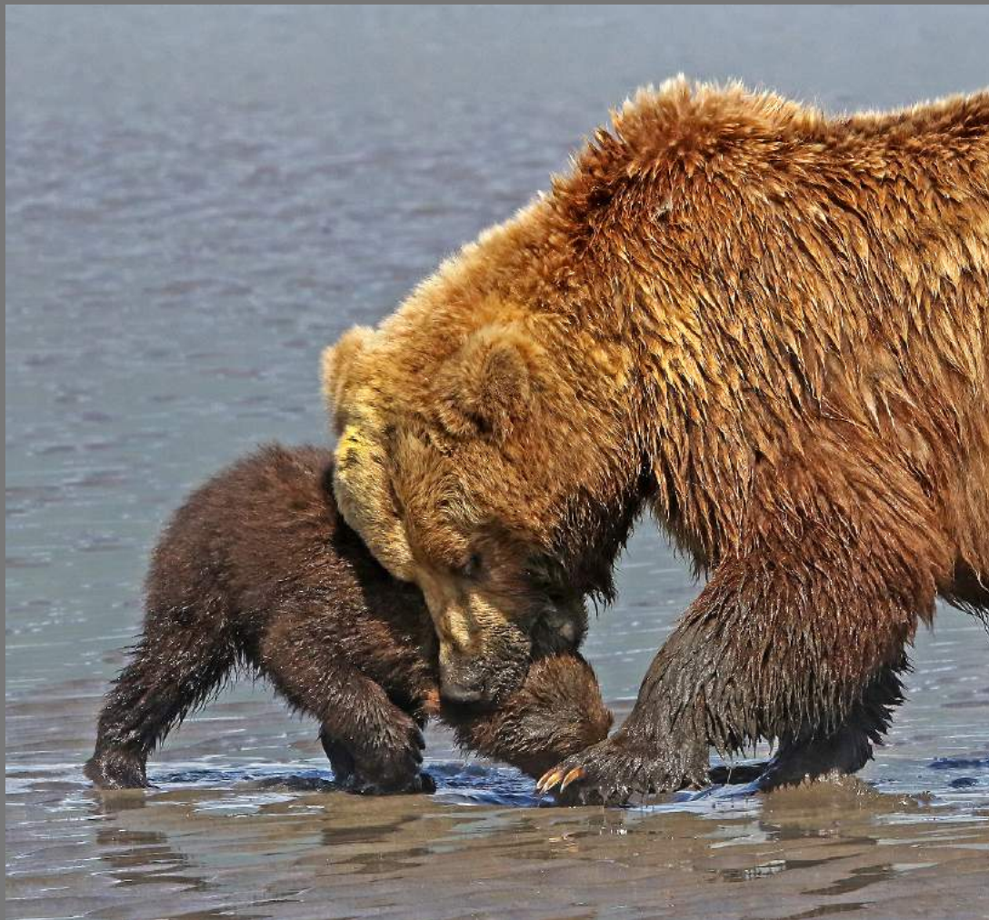
"MOTHER BEAR DISCIPLINES CUB 1434" by CHARLES STRICKER

Southern California Council of Camera Clubs