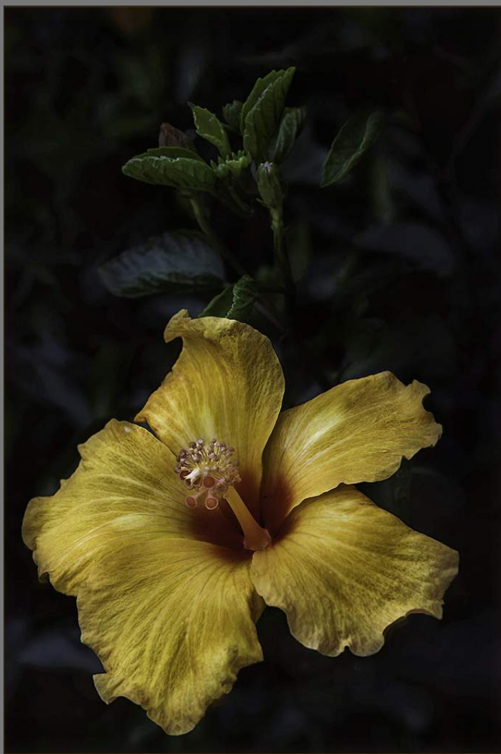
"A GOLDEN BREED PRESENTS" by JAMES WAT

Southern California Council of Camera Clubs