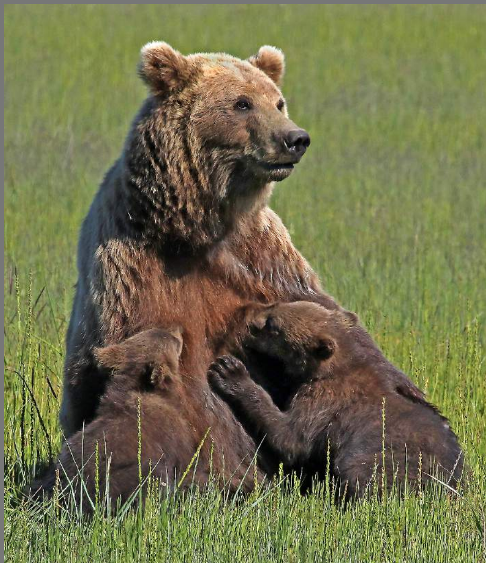
"MOMMA BEAR NURSES TWINS 1135" by CHARLES STRICKER

Southern California Council of Camera Clubs