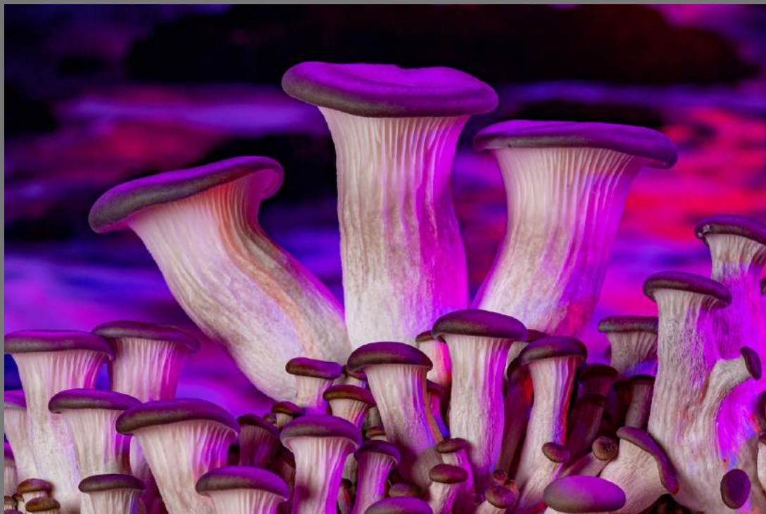
"BLUE OYSTER CULT" by BRIAN VANDEMARK

Southern California Council of Camera Clubs