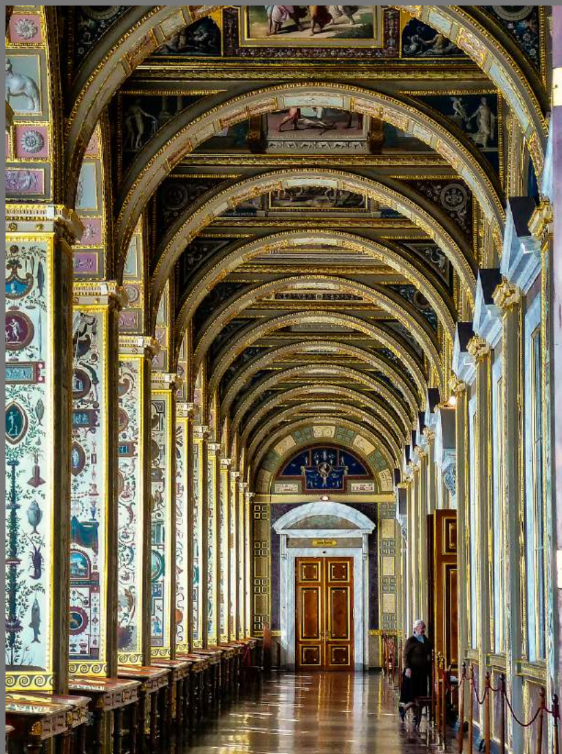
"HERMITAGE HALLWAY" by FRANK KLOSS

Southern California Council of Camera Clubs