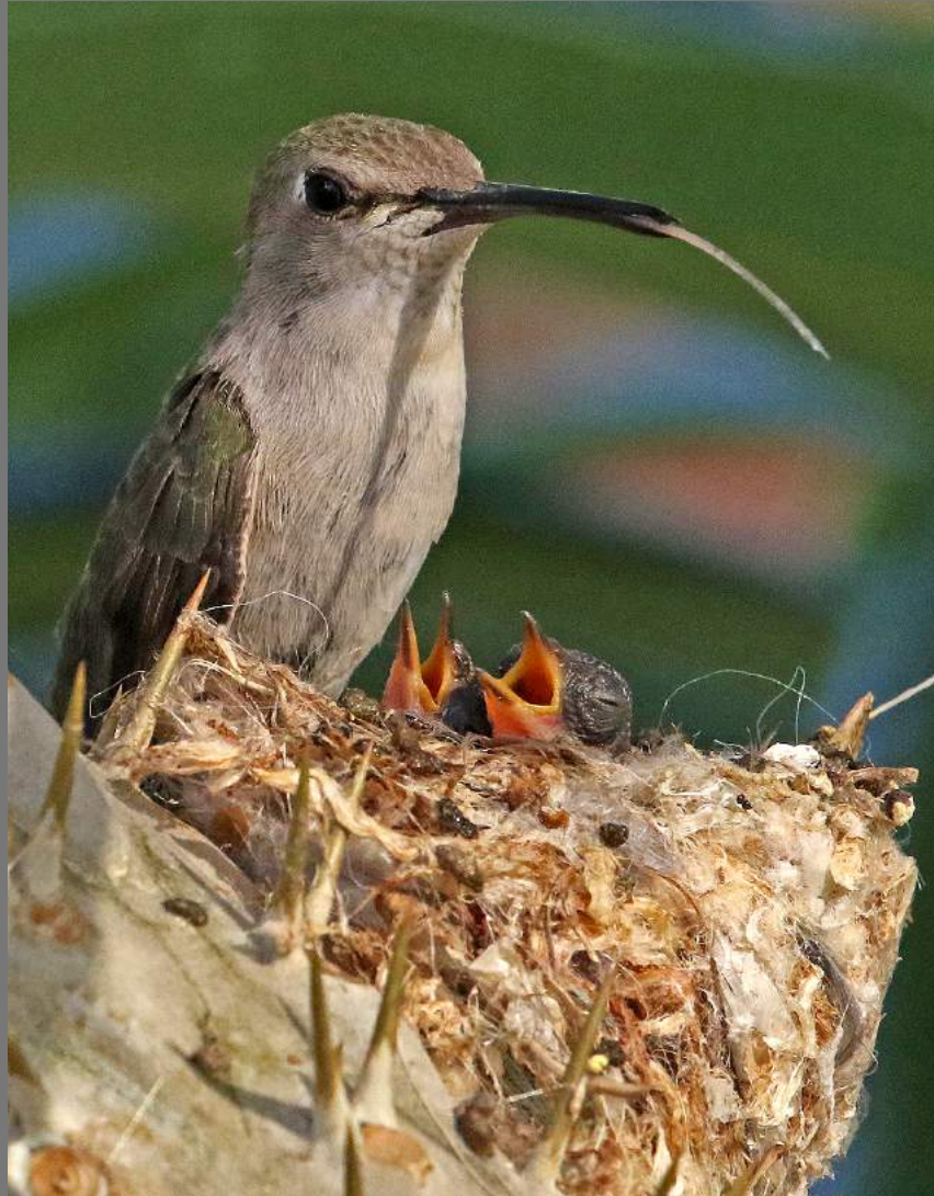
“HUMMINGBIRD CLEANS TONGUE 1965” by CHARLES STRICKER

Southern California Council of Camera Clubs