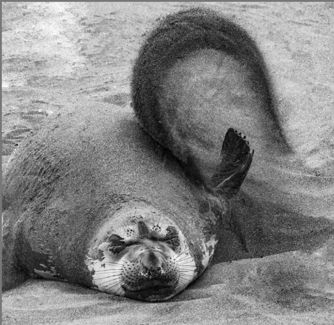
“MOULTING ELEPHANT SEAL 520” by ELLLENA VASQUEZ

Southern California Council of Camera Clubs