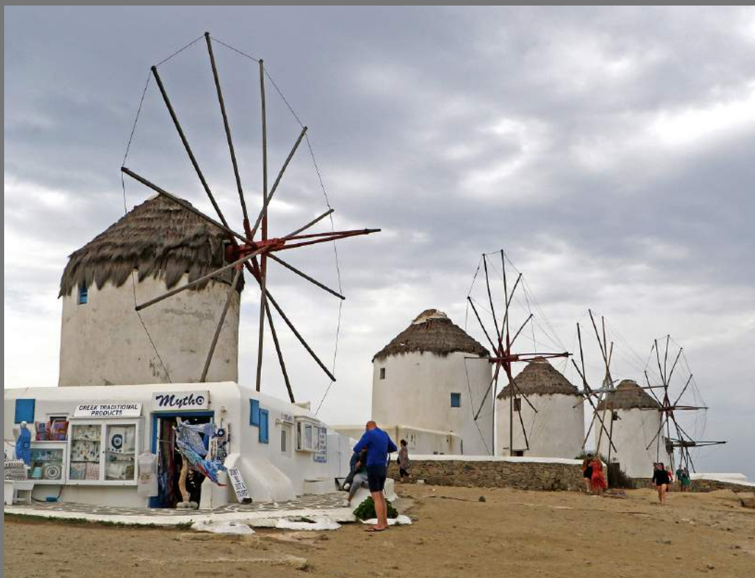
“WINDMILLS OF MYKONOS 0847” by CHARLES STRICKER

Southern California Council of Camera Clubs