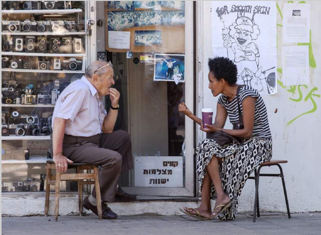
“ARGUMENT.” Coachella International Exhibition of Photography Photojournalism General