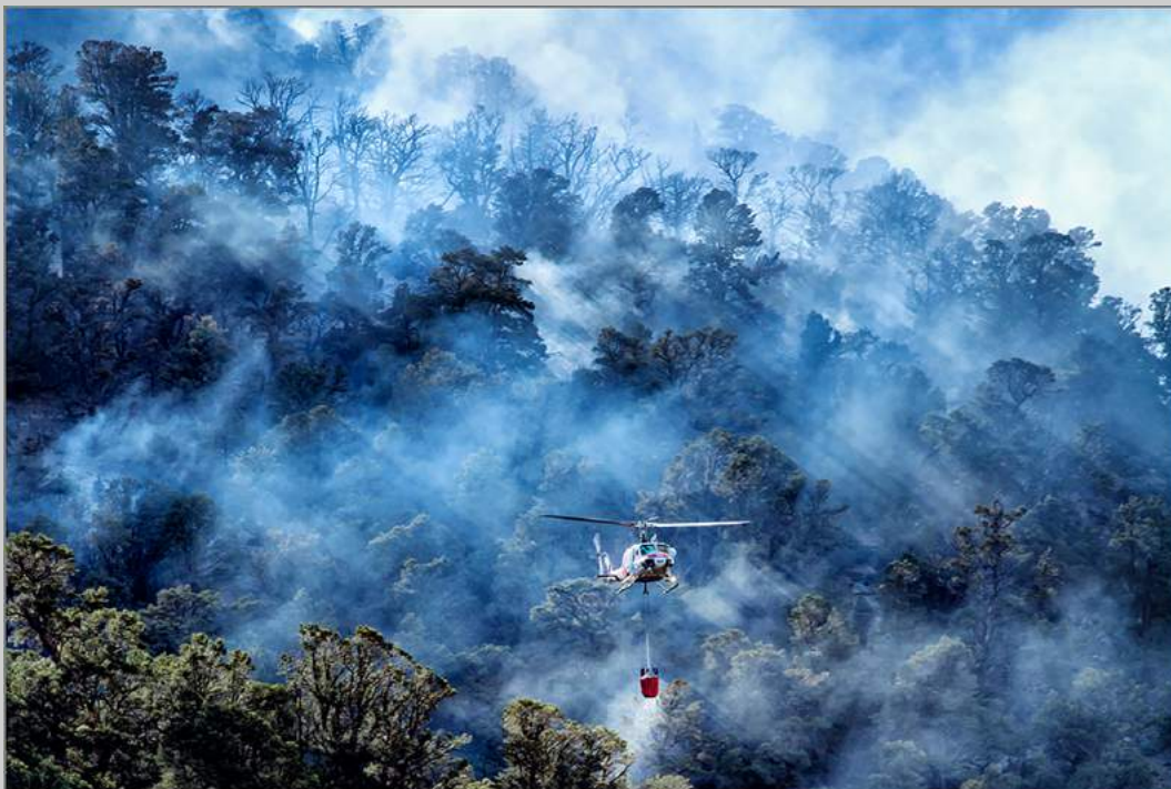
“MARINA FIRE - 49” 2018 Coachella International Exhibition of Photography Photojournalism General