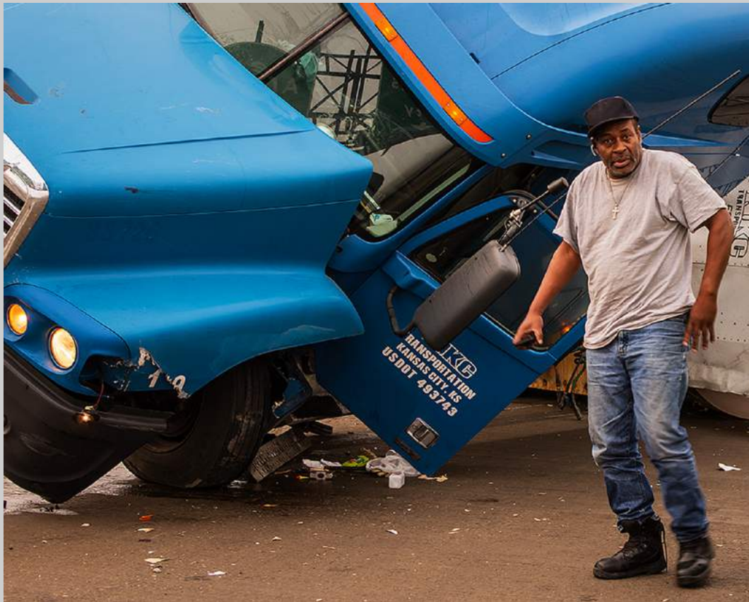
"DRIVER GETS OUT OF OVERTURNED TRUCK" Coachella International Exhibition of Photography Photojournalism Human Interest