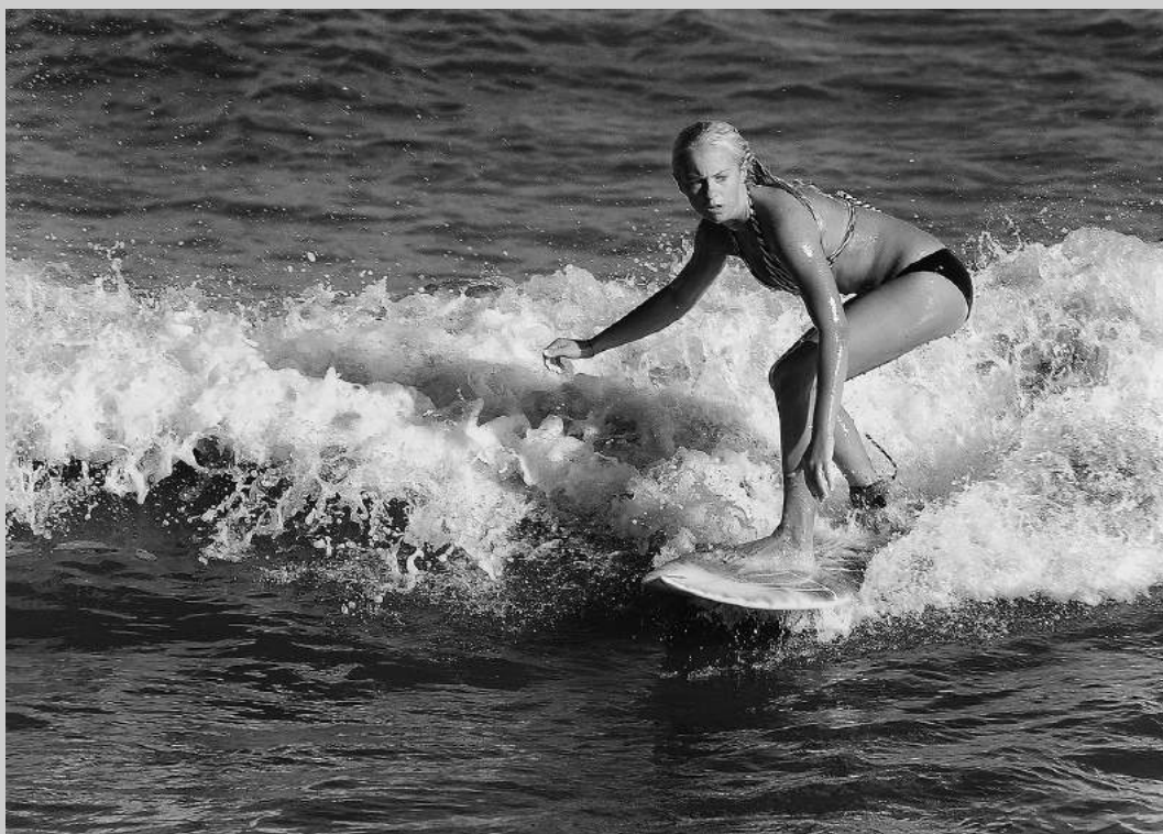
"YOUNG SURFER GIRL SC" 2018 Coachella International Exhibition of Photography Photojournalism General