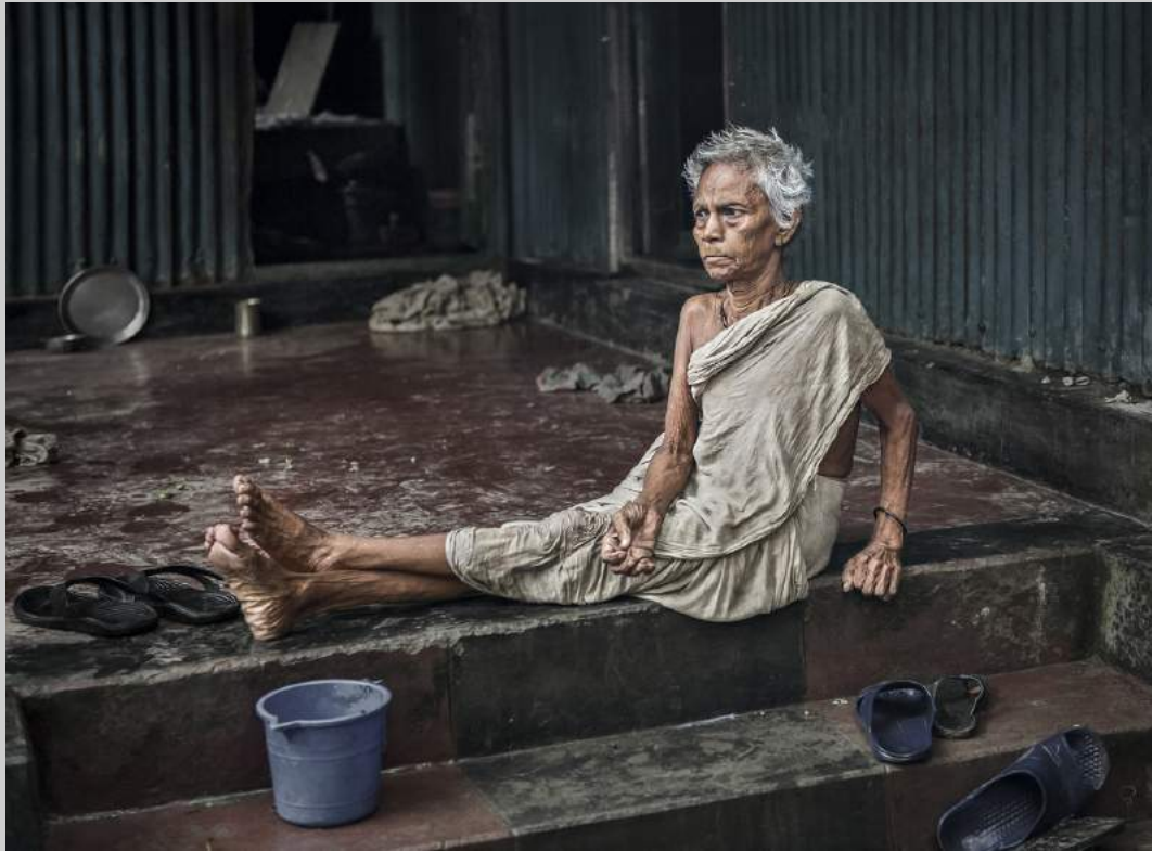
“BANGLADESH 36” Coachella International Exhibition of Photography Photojournalism General