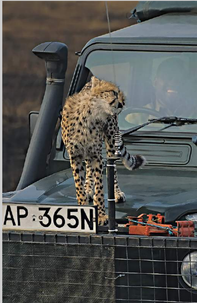
“CHECKING THE ARIAL” © DAVID MEISENHEIMER, FPSA, GMPSA 2018 Coachella International Exhibition of Photography Photojournalism Human Interest