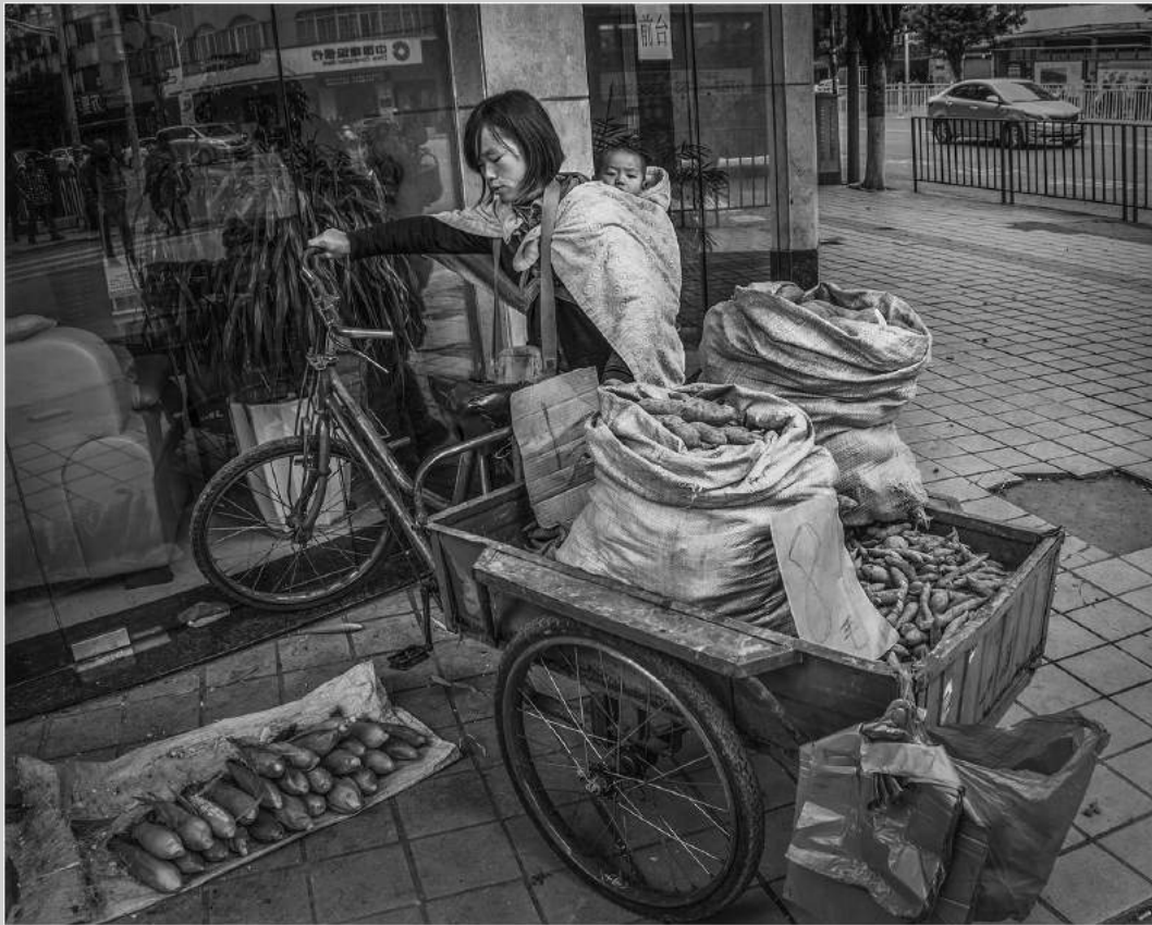
“WOMAN SELLING SWEET POTATOES 2” © YI WAN, MPSA 2018 Coachella International Exhibition of Photography Photojournalism General