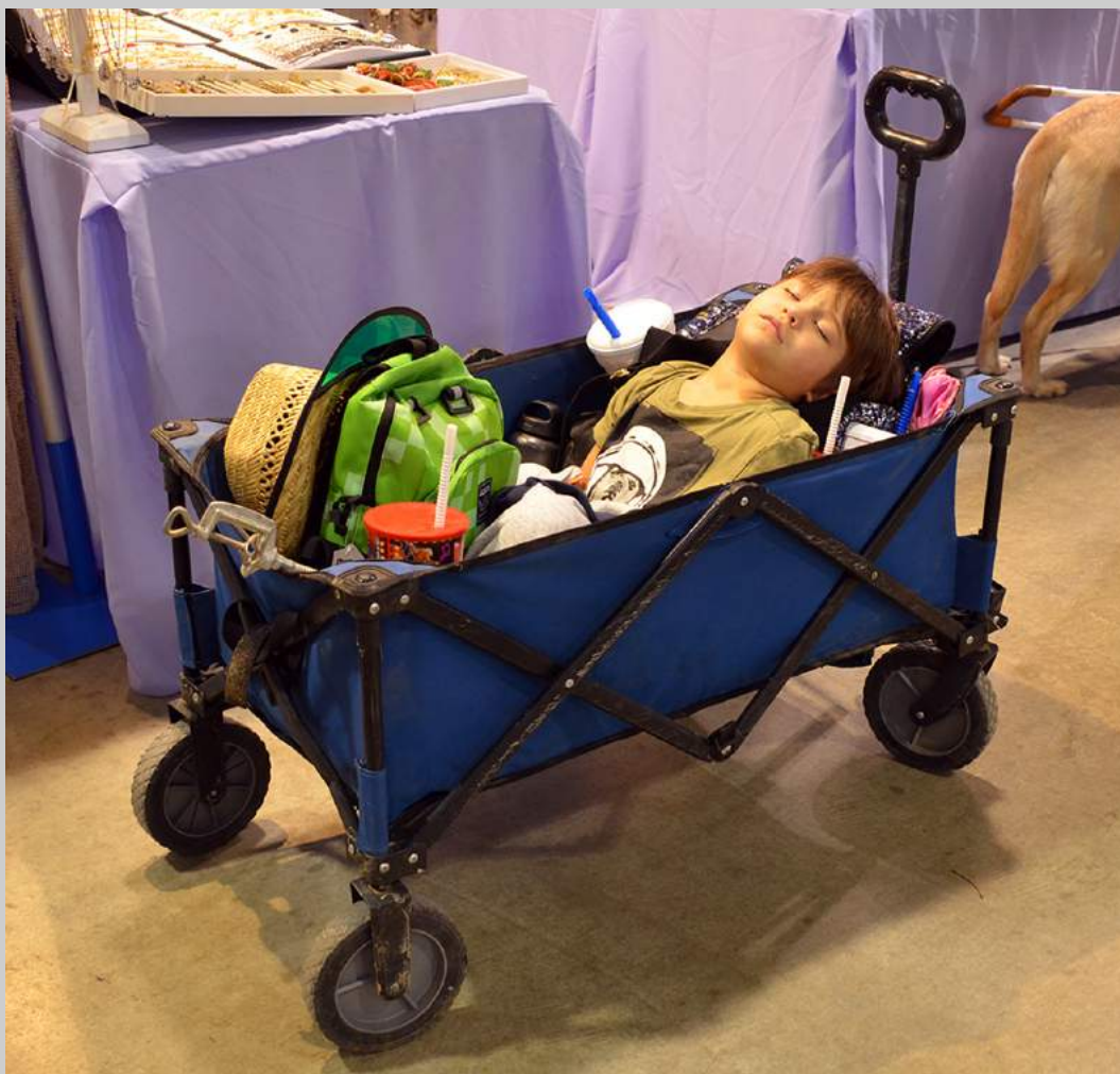
“BUSY DAY AT THE FAIR 2” © JOHN BEISHKE 2018 Coachella International Exhibition of Photography Photojournalism Human Interest