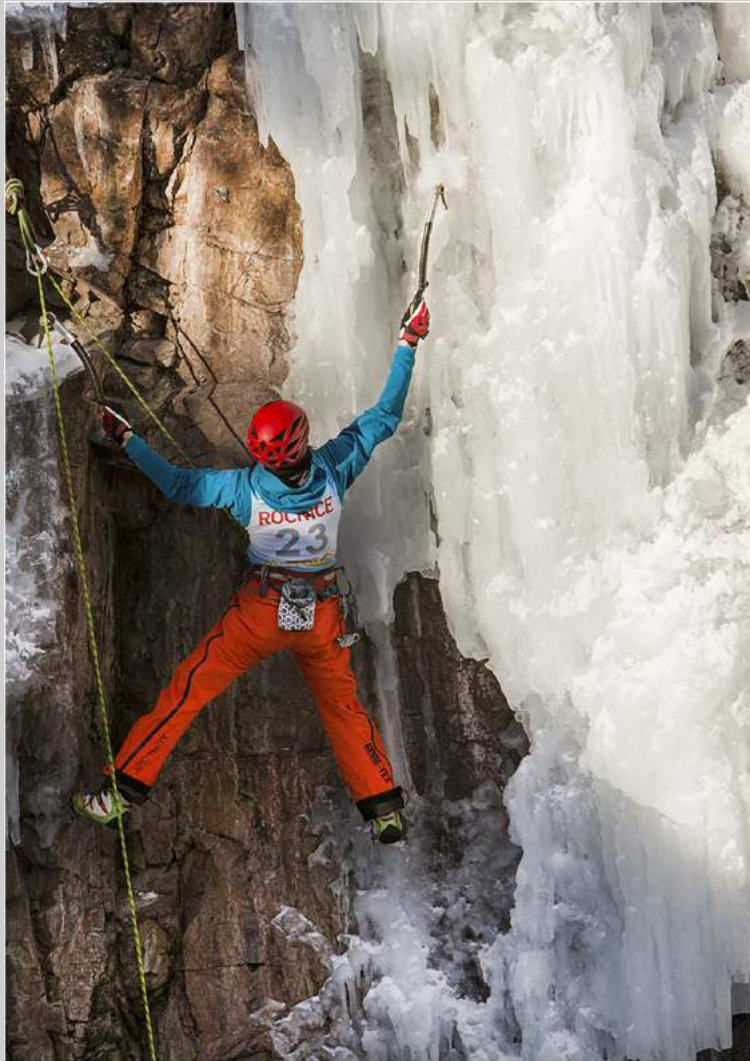
“STRUGGLE TO THE TOP” 2018 Coachella International Exhibition of Photography Photojournalism General