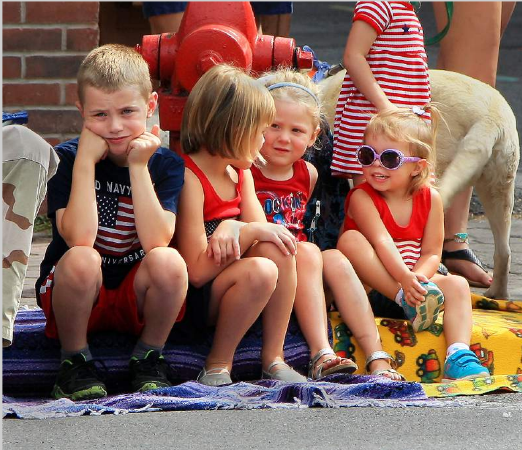
“SAD BOY WITH GOSSIP GIRLS 7676” Coachella International Exhibition of Photography Photojournalism Human Interest