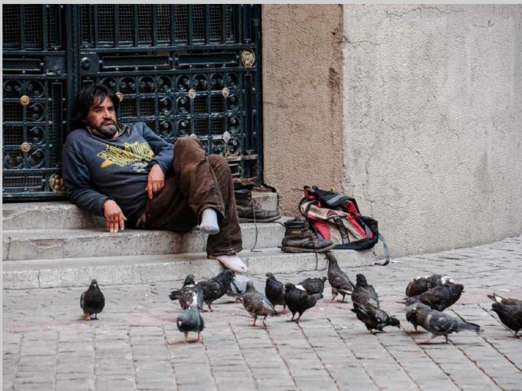
“PIGEONS FOR COMPANY” © TOM TAUBER, EPSA 2018 Coachella International Exhibition of Photography Photojournalism Human Interest