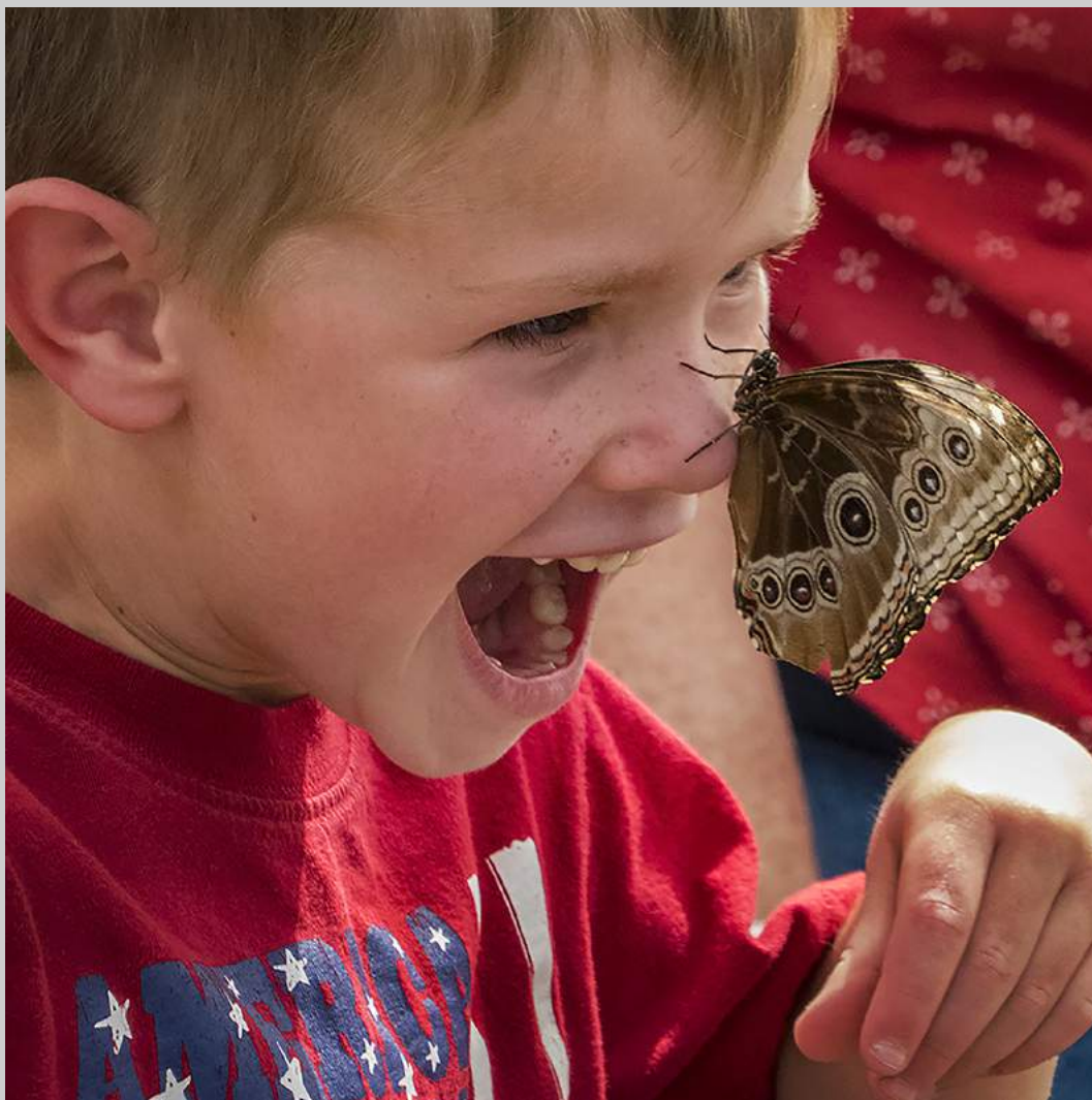
“THE NOSE KNOWS” © DEE MCMILLAN 2018 Coachella International Exhibition of Photography Photojournalism Human Interest PSA Best of Show Gold