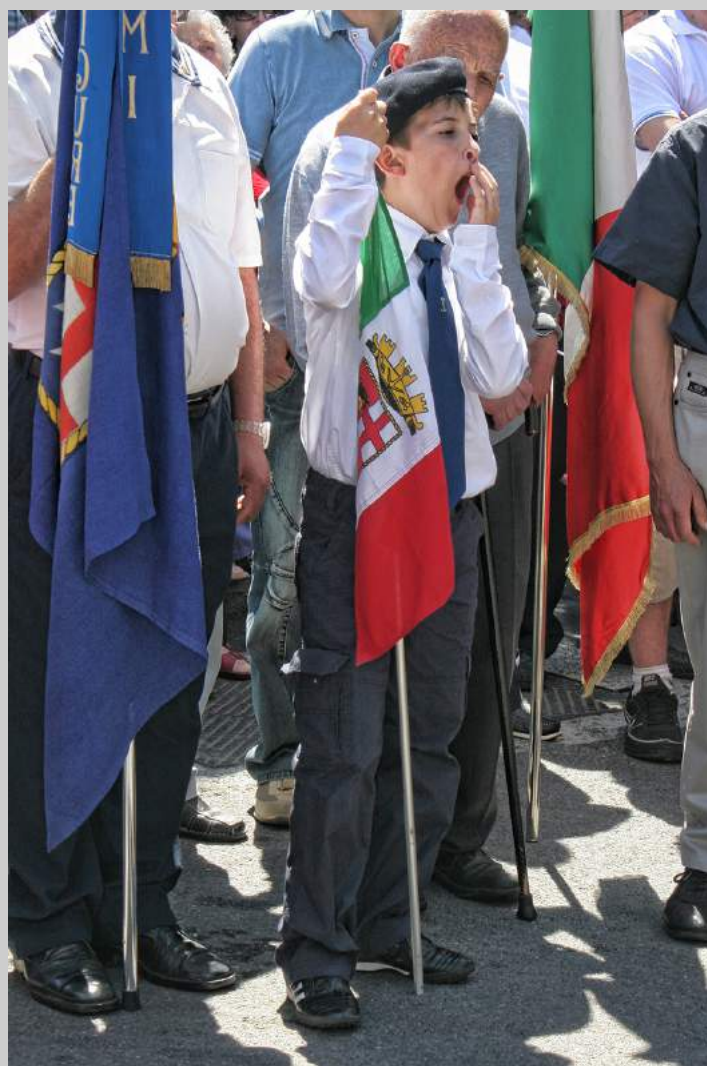
“PICCOLO MARINAIO” © EMANUELE ZUFFO, PPSA 2018 Coachella International Exhibition of Photography Photojournalism Human Interest