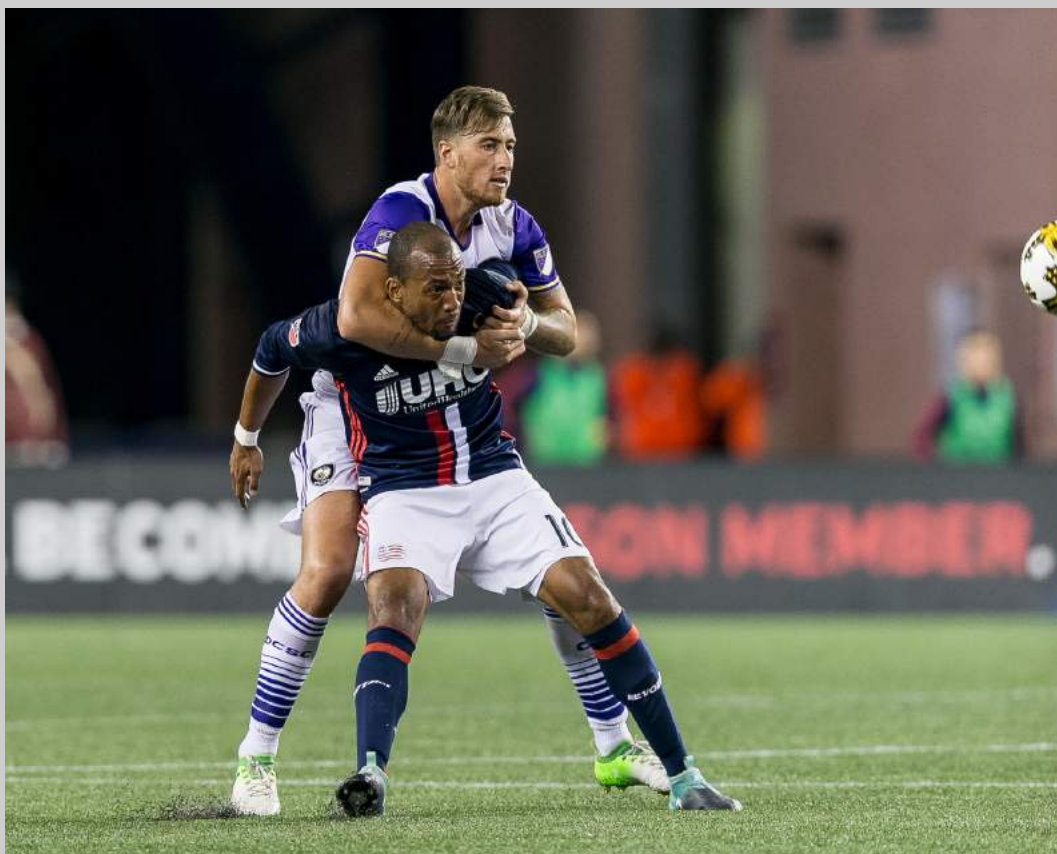
“BUNBURY_2017(6155)” Coachella International Exhibition of Photography Photojournalism General