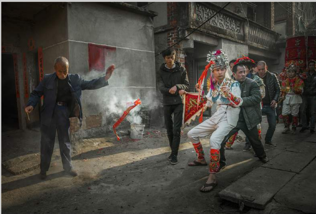
“FESTIVE LANTERN FESTIVAL 28” © YI WAN, MPSA 2018 Coachella International Exhibition of Photography Photojournalism General