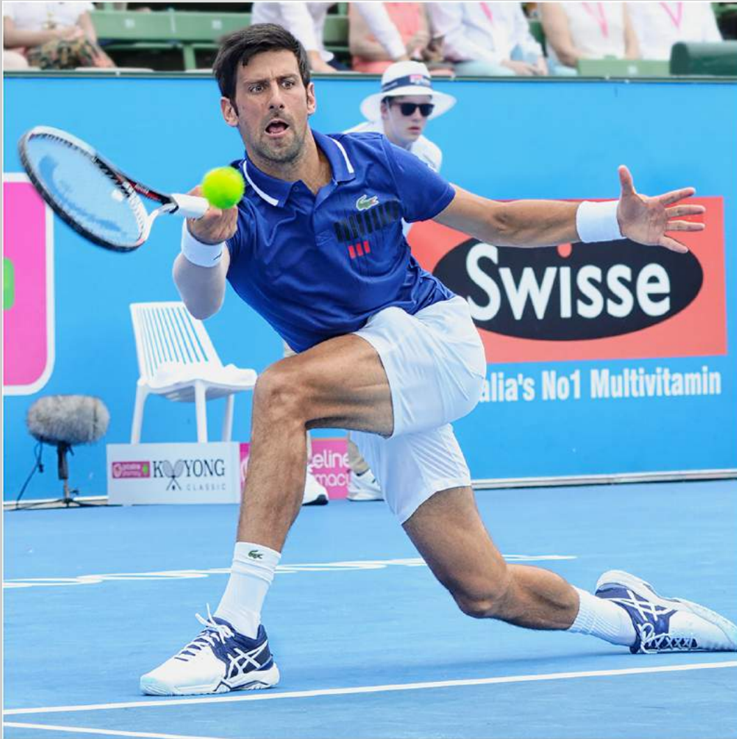
“NOVAK DJOKOVIC RETURNS” © FRANCIS KENNEDY, EPSA 2018 Coachella International Exhibition of Photography Photojournalism General