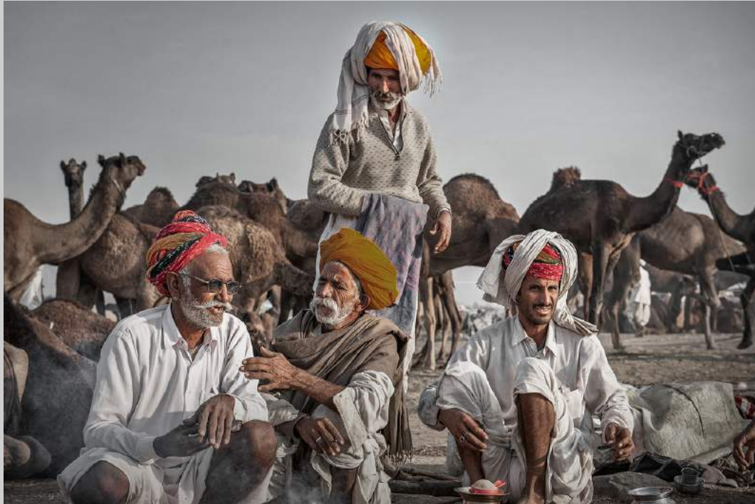
“CHATTING ARABS” © XIAOMEI XU, EPSA 2018 Coachella International Exhibition of Photography Photojournalism General