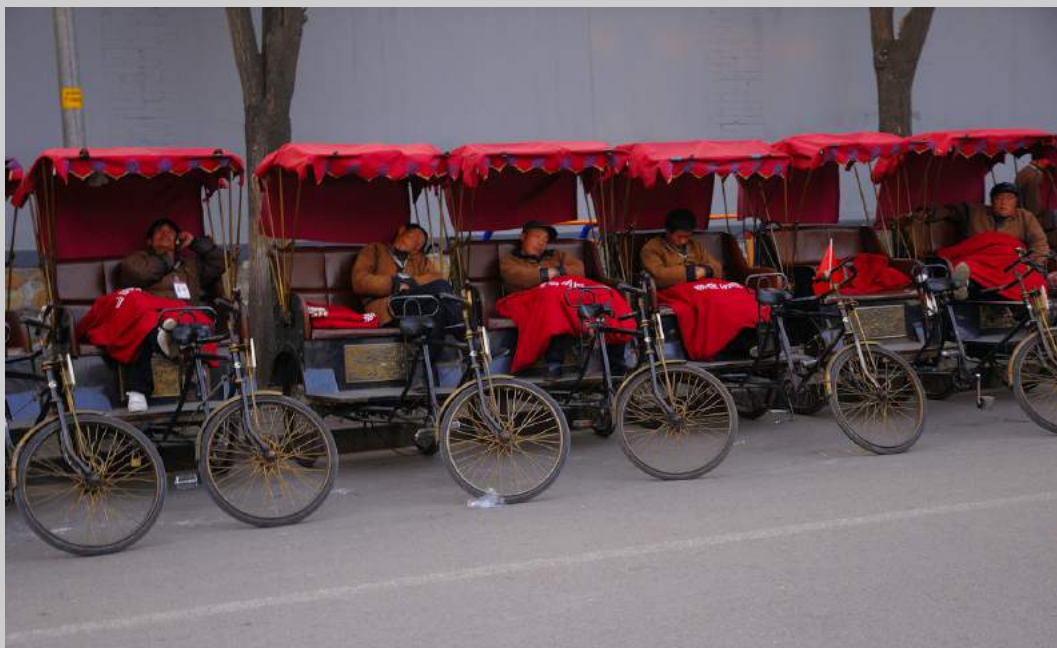
“ASPETTANDO CLIENTI” © WALTER GABERTHUEL, MPSA 2018 Coachella International Exhibition of Photography Photojournalism Human Interest