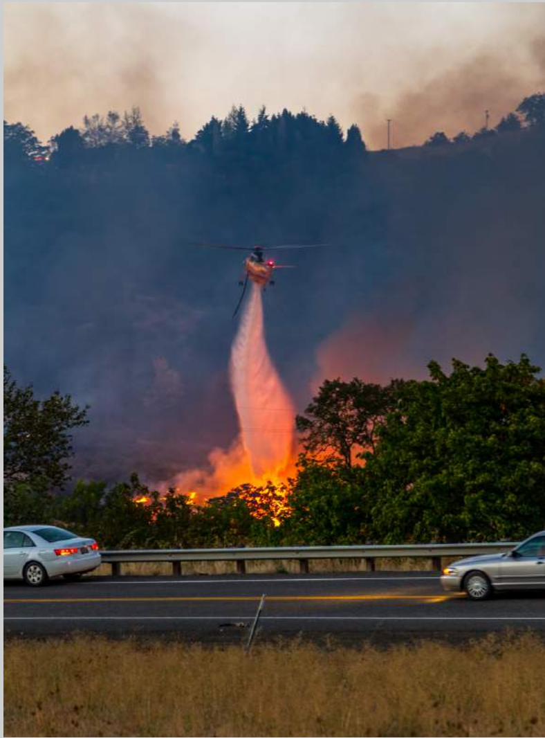
“FIRE ON FREEWAY” © MARCY STARNES 2018 Coachella International Exhibition of Photography Photojournalism General