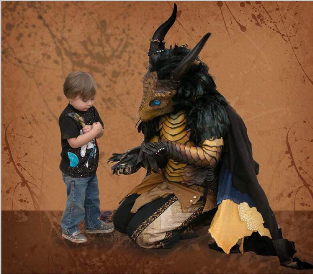
“BAT MAN-KID” Coachella International Exhibition of Photography Photojournalism Human Interest