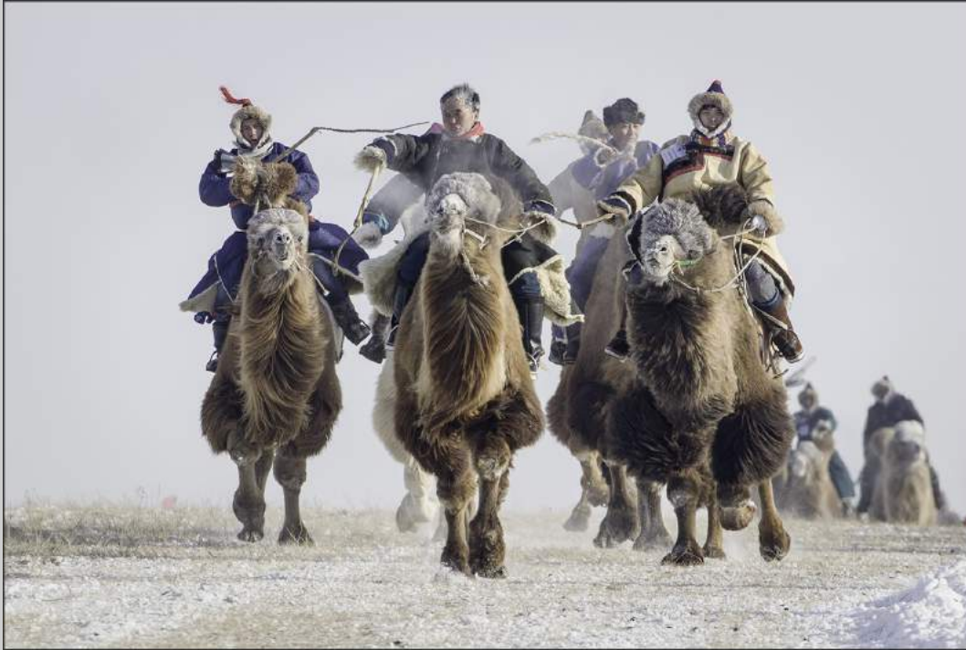
“CAMEL RACE 81” 2018 Coachella International Exhibition of Photography Photojournalism General