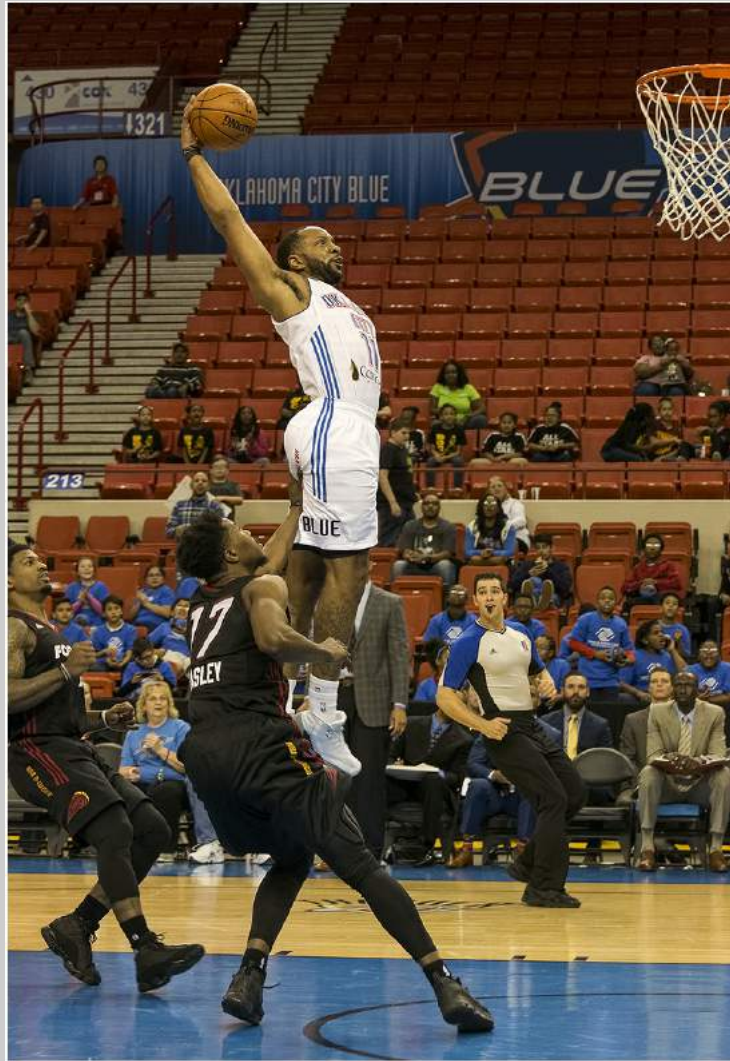
“DUNK COMING” 2018 Coachella International Exhibition of Photography Photojournalism General