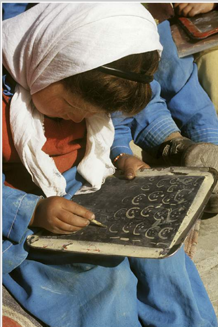
“HOME WORK” © AMIN SHAIKH, FPSA, GMPA 2018 Coachella International Exhibition of Photography Photojournalism General