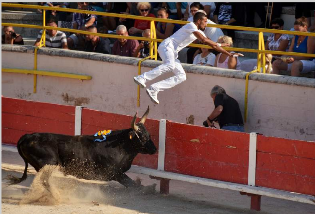
“NEAR MISS” © RON WILLEMS 2018 Coachella International Exhibition of Photography Photojournalism General CVDCC Silver