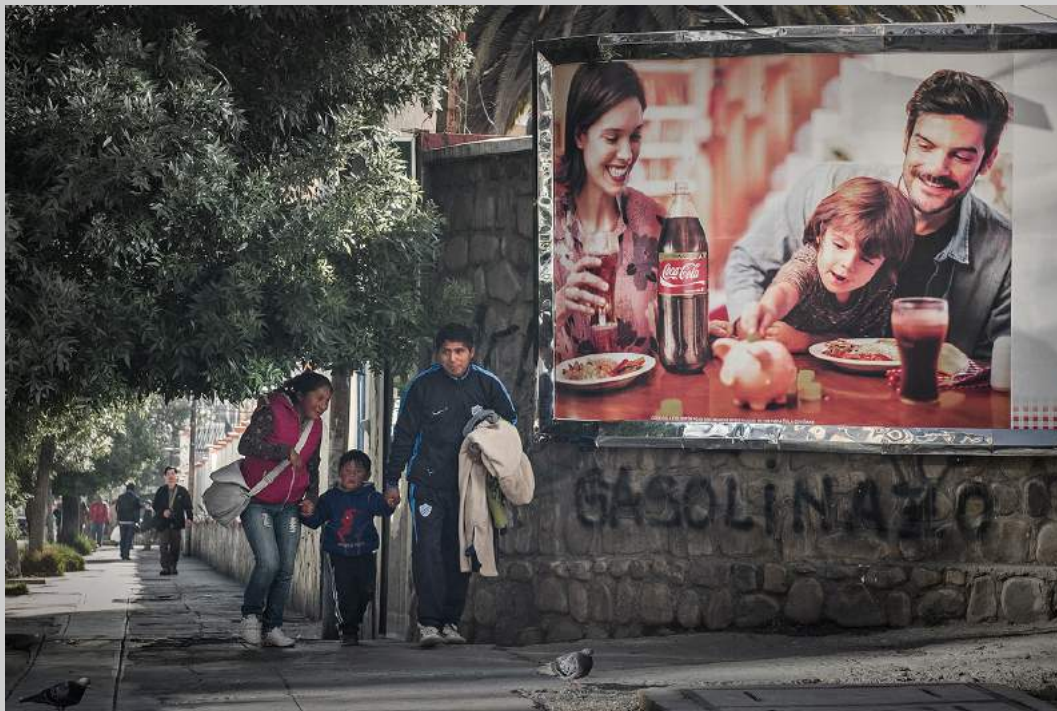
“FAMILY DAY” © XIAOMEI XU, EPSA 2018 Coachella International Exhibition of Photography Photojournalism Human Interest