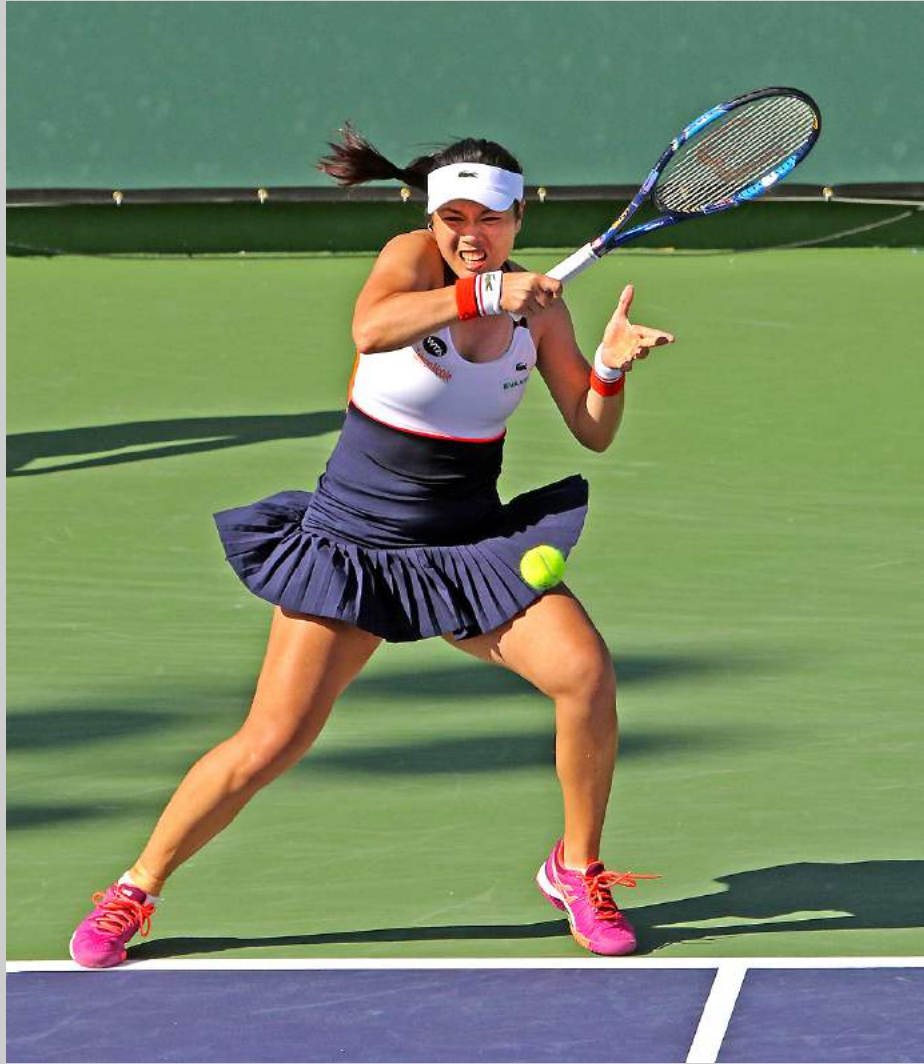
“FEROCIOUS CHAN FOREHAND 1343” Coachella International Exhibition of Photography Photojournalism General