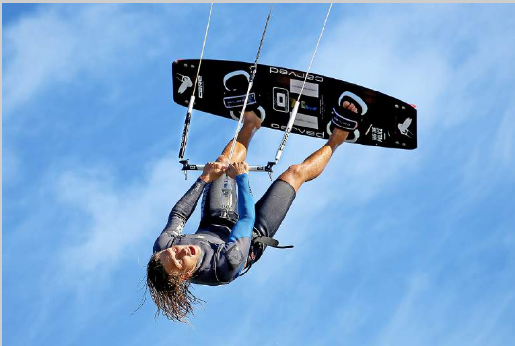
“MARIUS 3” © ALBERT PEER 2018 Coachella International Exhibition of Photography Photojournalism General