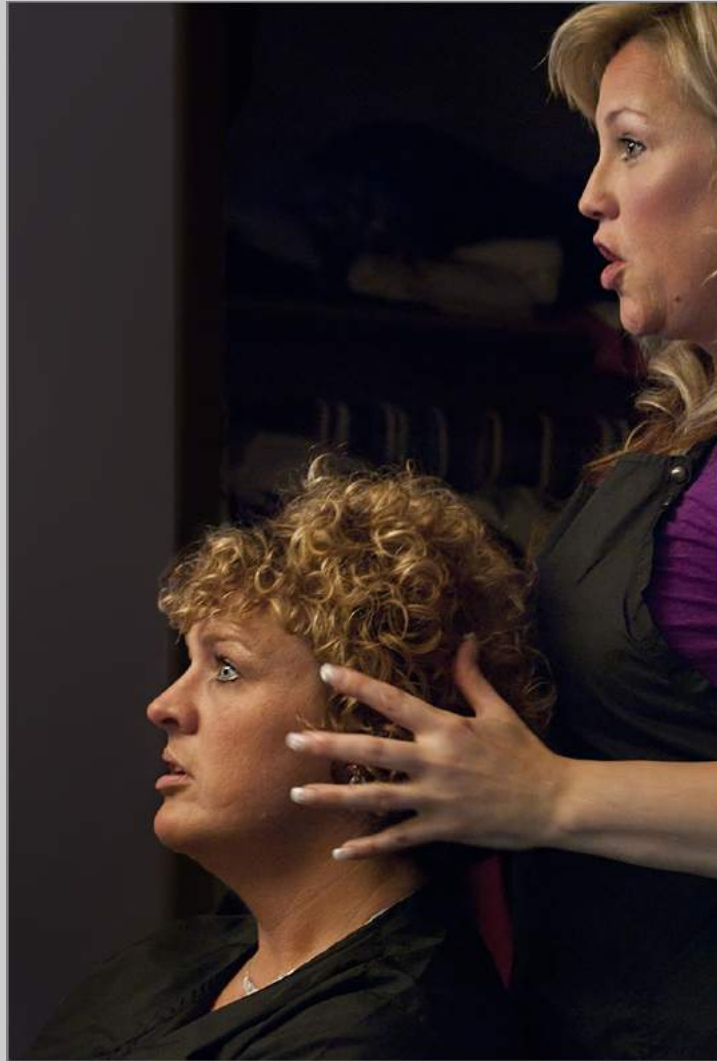
“HAIRDRESSER” Coachella International Exhibition of Photography Photojournalism Human Interest CVDCC Bronze