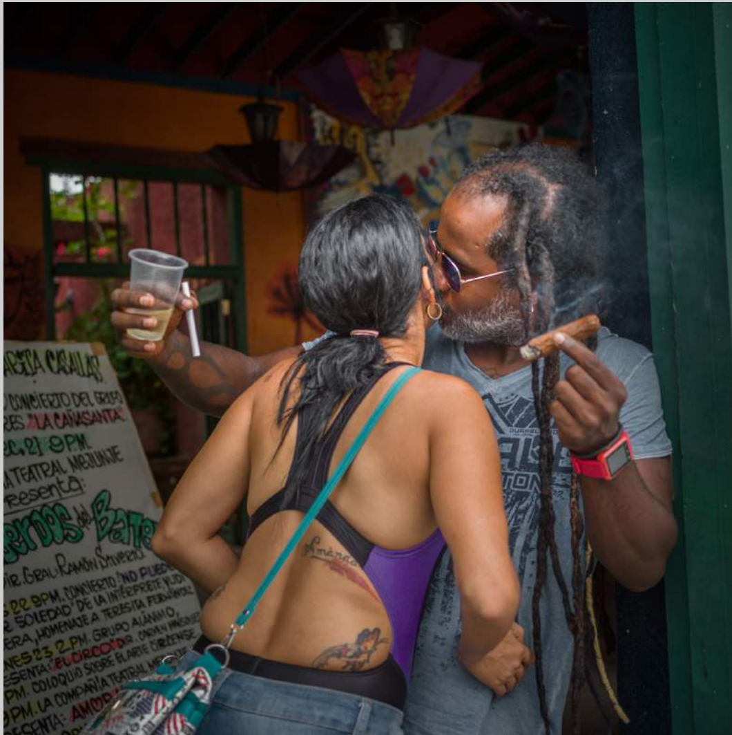
"CUBA20" Coachella International Exhibition of Photography Photojournalism Human Interest HM