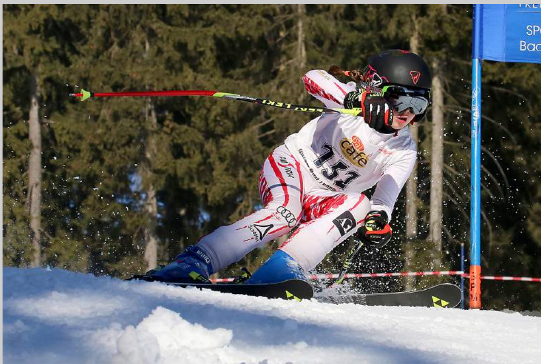
“STARTNUMMER 152” © ALBERT PEER 2018 Coachella International Exhibition of Photography Photojournalism General