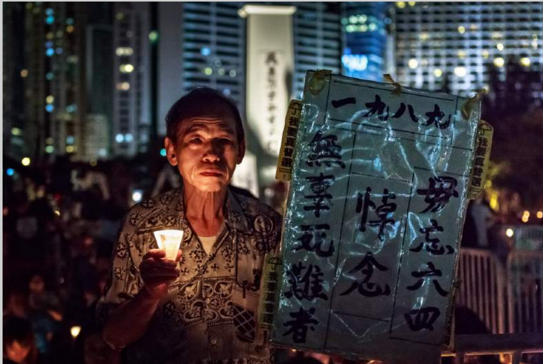
“CANDLELIGHT VIGIL VIIV” Coachella International Exhibition of Photography Photojournalism General