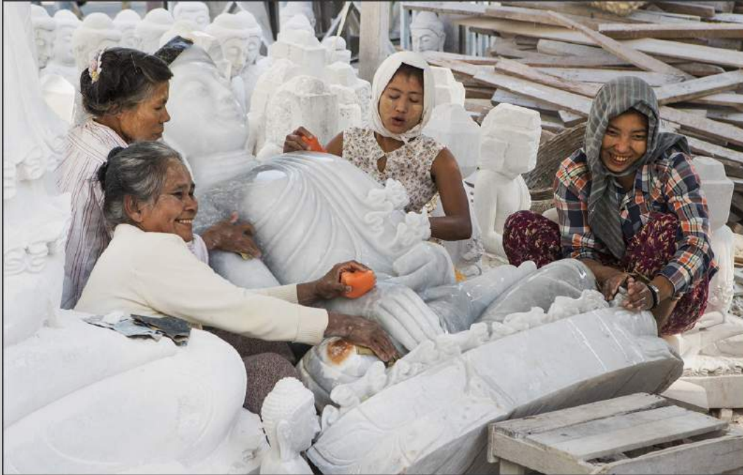
“POLISH MARBLE” © PHILLIP KWAN, GMPSA/B 2018 Coachella International Exhibition of Photography Photojournalism Human Interest