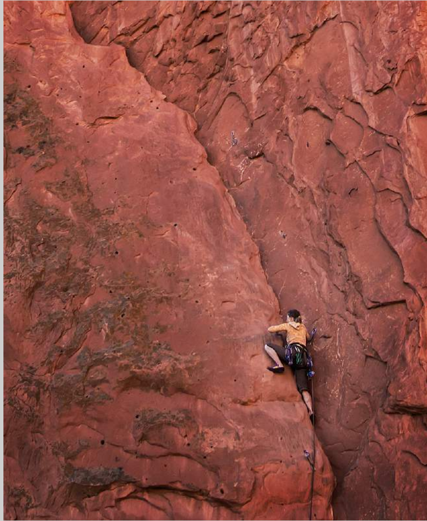
“RED ROCK CLIMBING” Coachella International Exhibition of Photography Photojournalism General