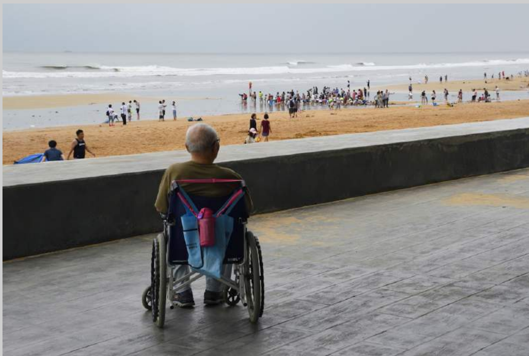
“LOOKING” © WALTER GABERTHUEL, MPSA 2018 Coachella International Exhibition of Photography Photojournalism Human Interest