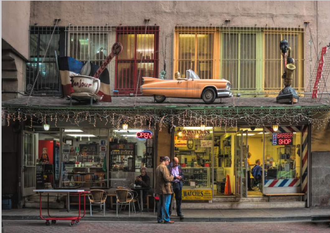
“ST VINCENT COURT 2018” Coachella International Exhibition of Photography Photojournalism General