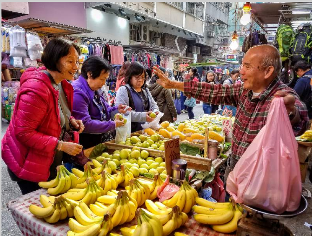
“MONG KOK STREET MARKET” © KAI HAY CLEMENT LAW 2018 Coachella International Exhibition of Photography Photojournalism General