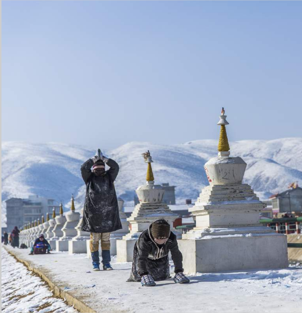
“DEVOUT22” © HAIYAN HUANG 2018 Coachella International Exhibition of Photography Photojournalism General