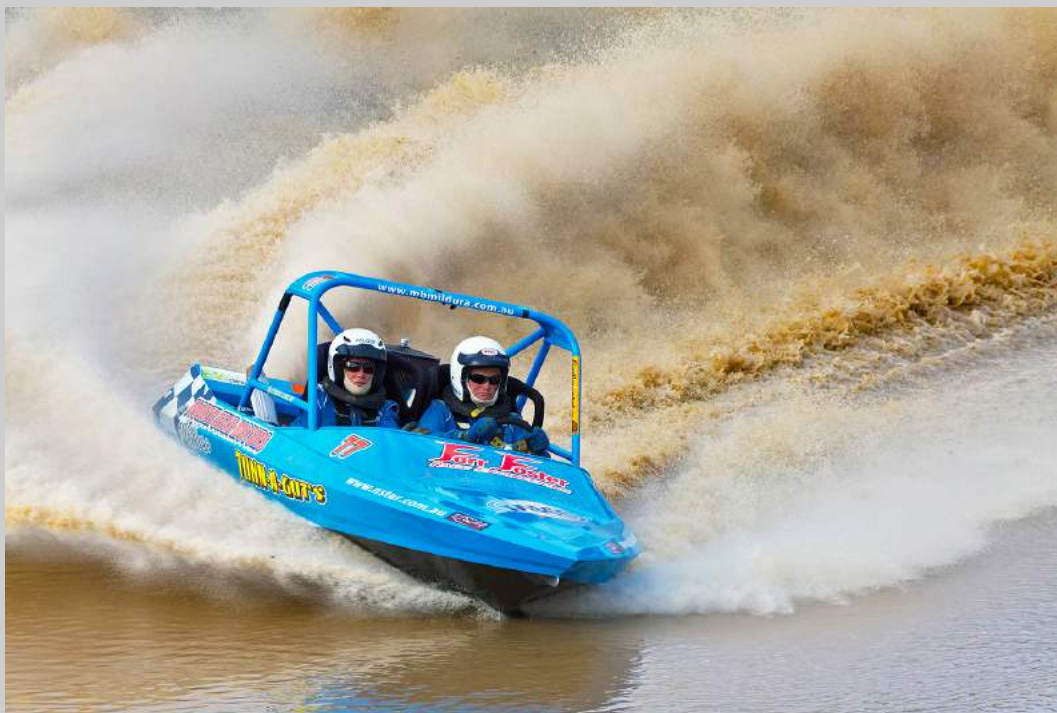
“FARR FASTER” © ANN SMALLEGANGE, PPSA 2018 Coachella International Exhibition of Photography Photojournalism General