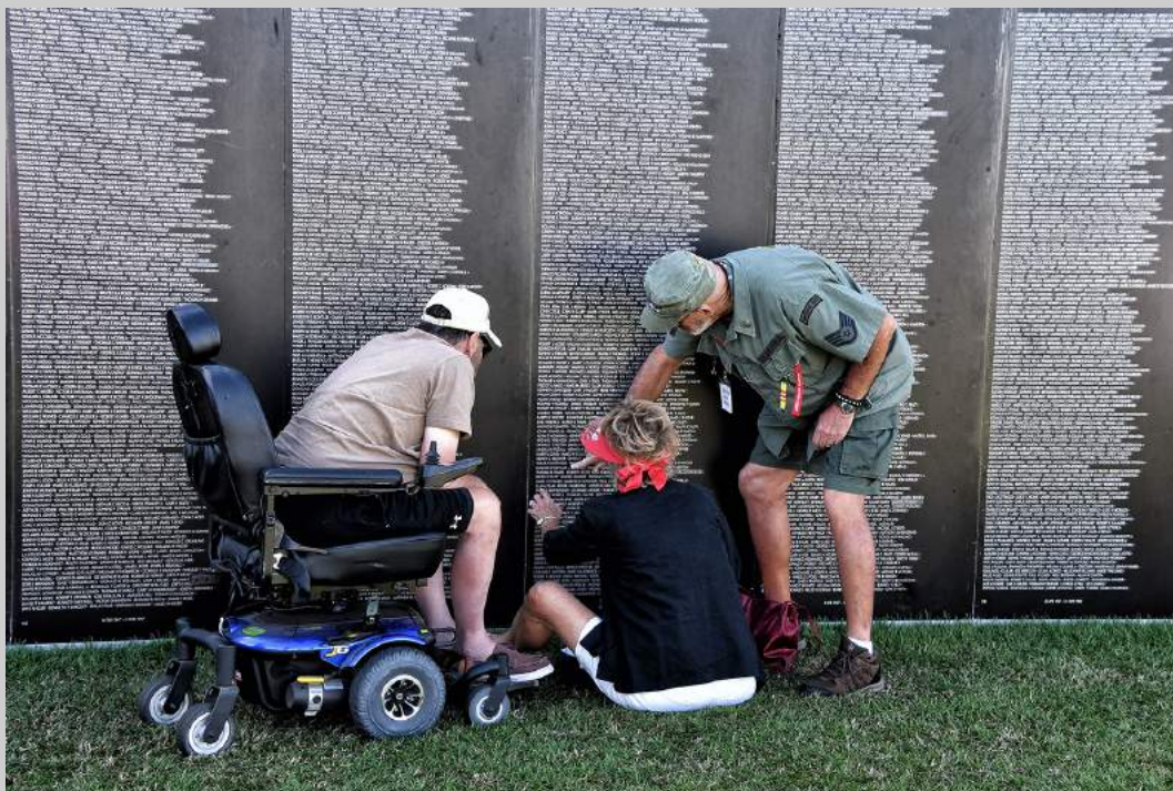
“LOOKING FINDING REMEMBERING” 2018 Coachella International Exhibition of Photography Photojournalism Human Interest