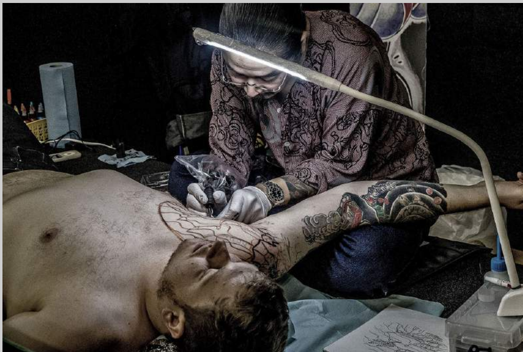
“THE TATTOIST” © BILL HODGES 2018 Coachella International Exhibition of Photography Photojournalism General