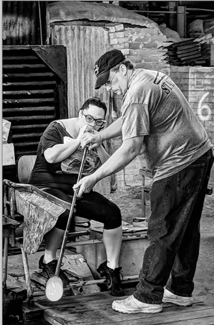
“BLEMKO GLASS - 06” © PAUL SPEAKER, PPSA 2018 Coachella International Exhibition of Photography Photojournalism General