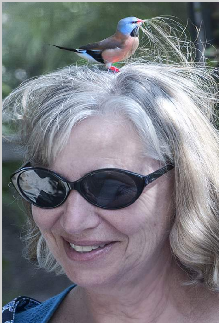
“GATHERING NESTING MATERIAL” © BARBARA KUEBLER, APSA, MPSA 2018 Coachella International Exhibition of Photography Photojournalism Human Interest