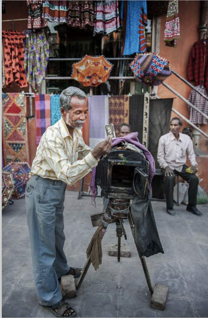
“OLD FASHION” EPSA 2018 Coachella International Exhibition of Photography Photojournalism General