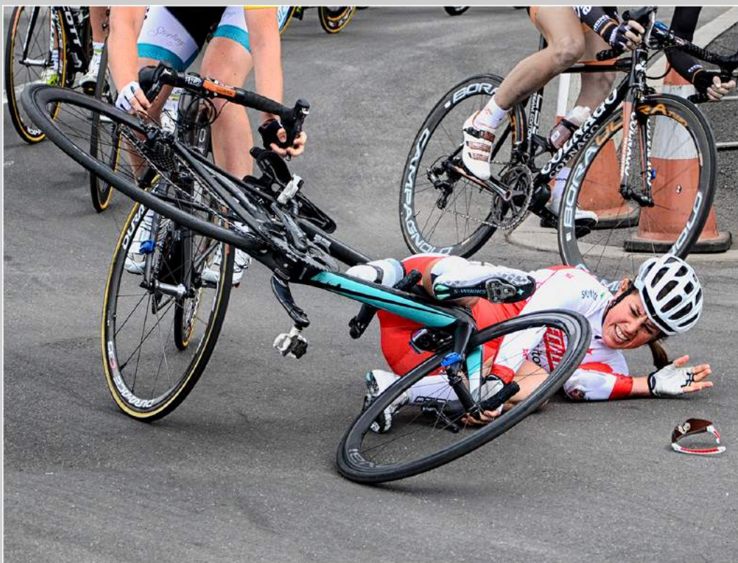
“NASTY FALL NO2” © FRANCIS KENNEDY, EPSA 2018 Coachella International Exhibition of Photography Photojournalism General Judge’s Choice