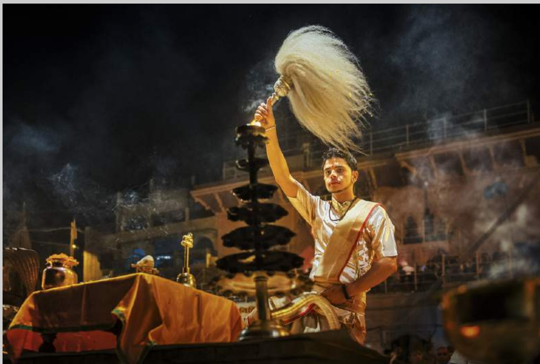
“GANGES WORSHIP 2” Coachella International Exhibition of Photography Photojournalism General