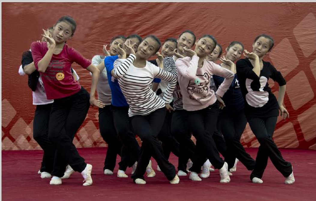
“TRAINING” © GUY B. SAMOYVAULT, APSA, GMPSA 2018 Coachella International Exhibition of Photography Photojournalism Human Interest