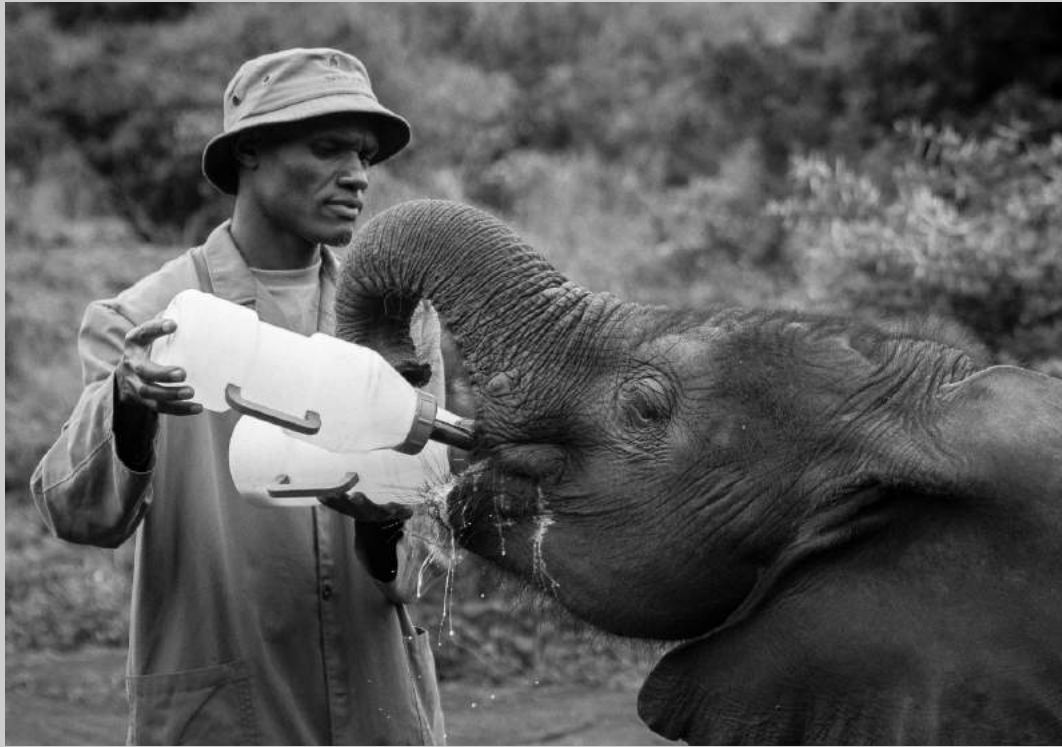
“KEEPER FEEDING ORPHAN ELEPHANT” 2018 Coachella International Exhibition of Photography Photojournalism Human Interest