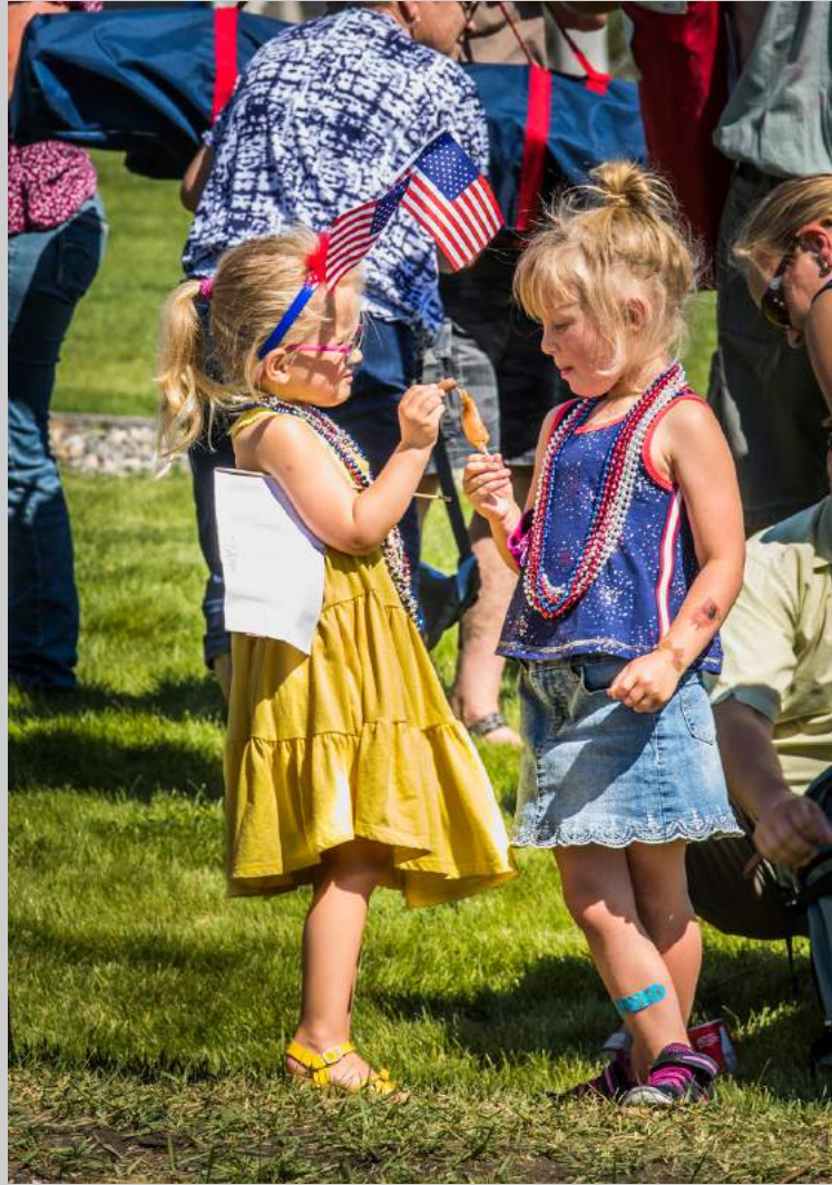
“SHARING CANDY” © MARCY STARNES 2018 Coachella International Exhibition of Photography Photojournalism Human Interest