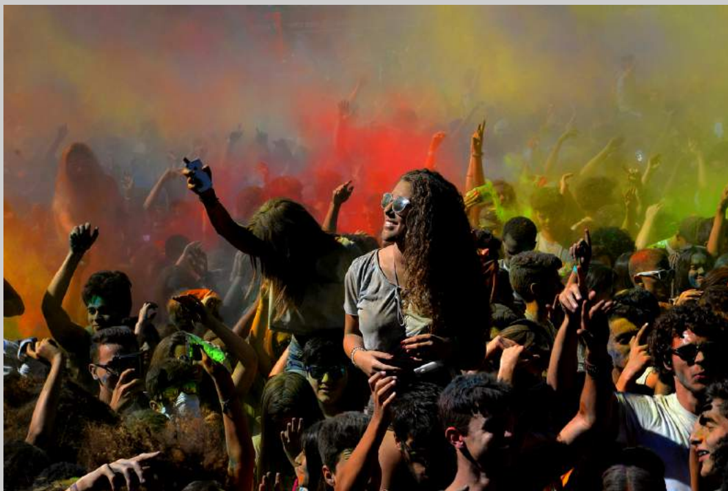
“LIKE A RAINBOW” © JOAO TABORDA, PPSA 2018 Coachella International Exhibition of Photography Photojournalism General