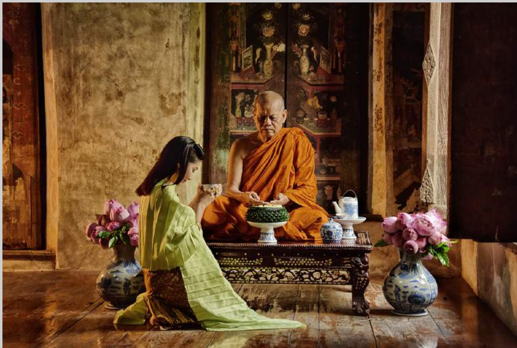
“OFFERING TO THE MONK” Coachella International Exhibition of Photography Photojournalism General