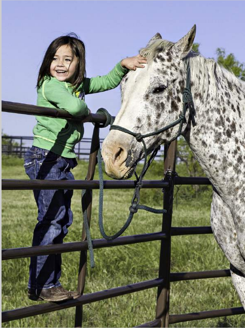
"I LOVE THIS HORSE" 2018 Coachella International Exhibition of Photography Photojournalism Human Interest