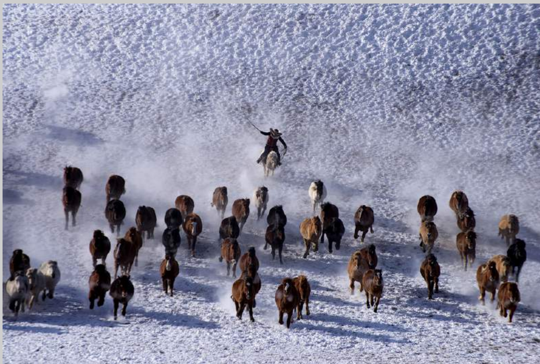
“THE GREAT DESCENT” © JOAO TABORDA, PPSA 2018 Coachella International Exhibition of Photography Photojournalism General