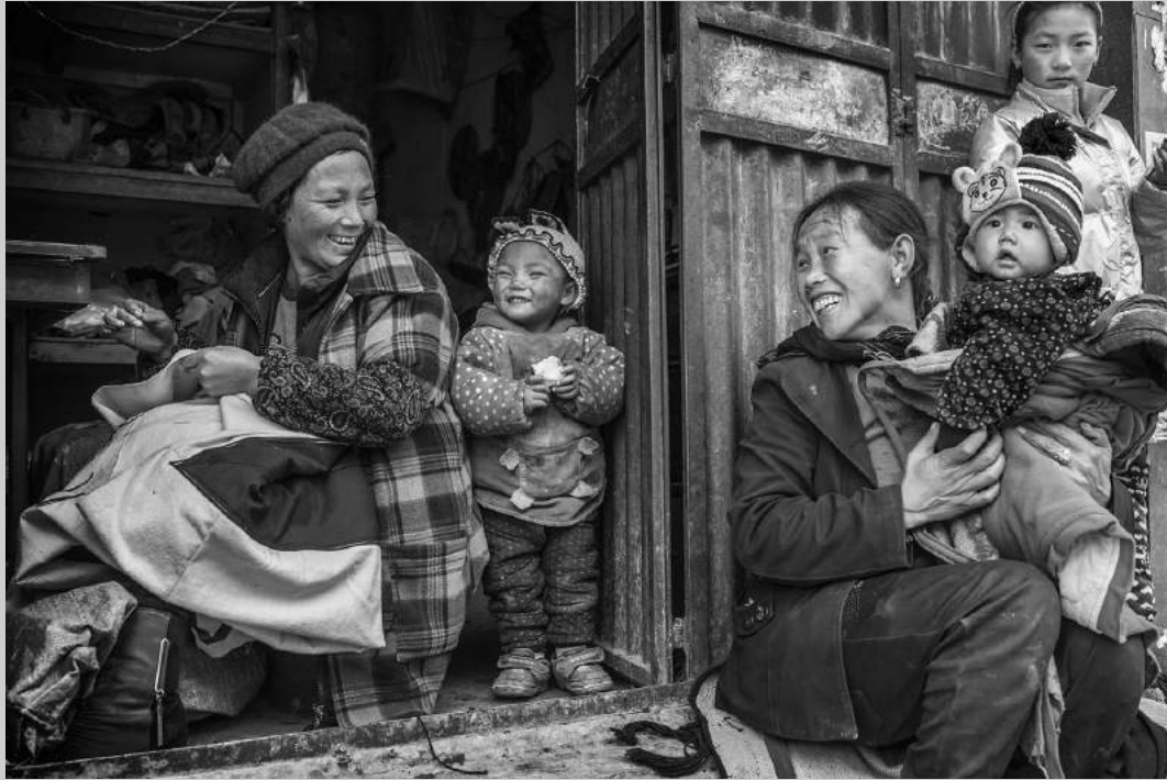
“DALIANGSHAN 33” © YAN LUO 2018 Coachella International Exhibition of Photography Photojournalism Human Interest