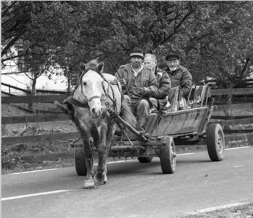
“WE ARE VISITING YOU.” Coachella International Exhibition of Photography Photojournalism General