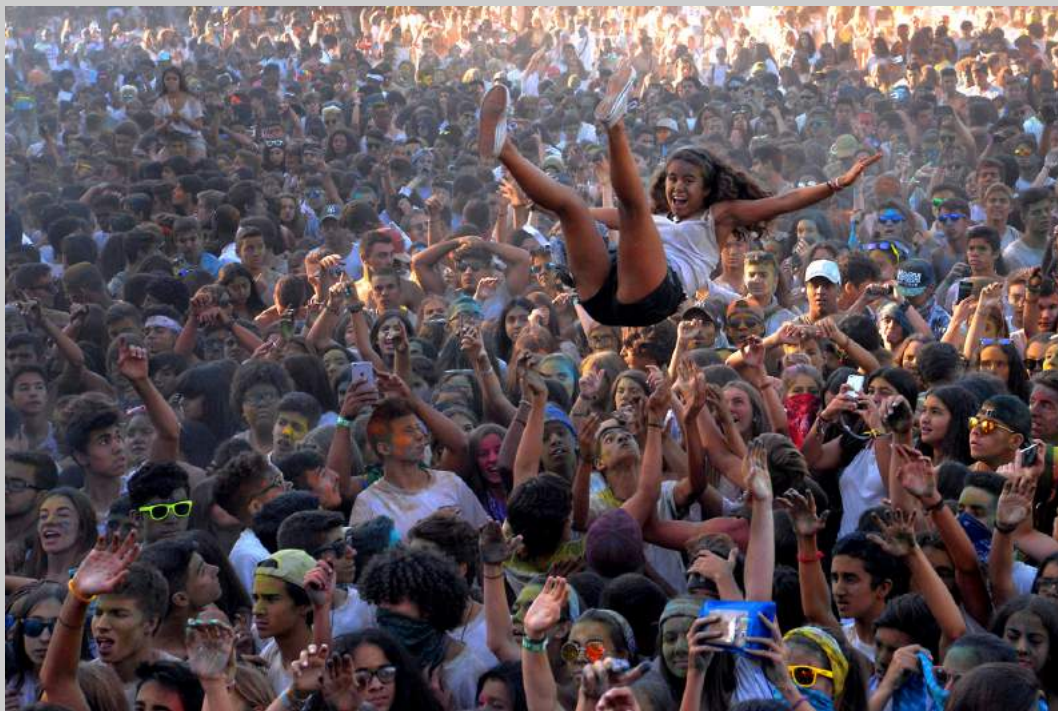
“FLY WITH JOY” © JOAO TABORDA, PPSA 2018 Coachella International Exhibition of Photography Photojournalism General