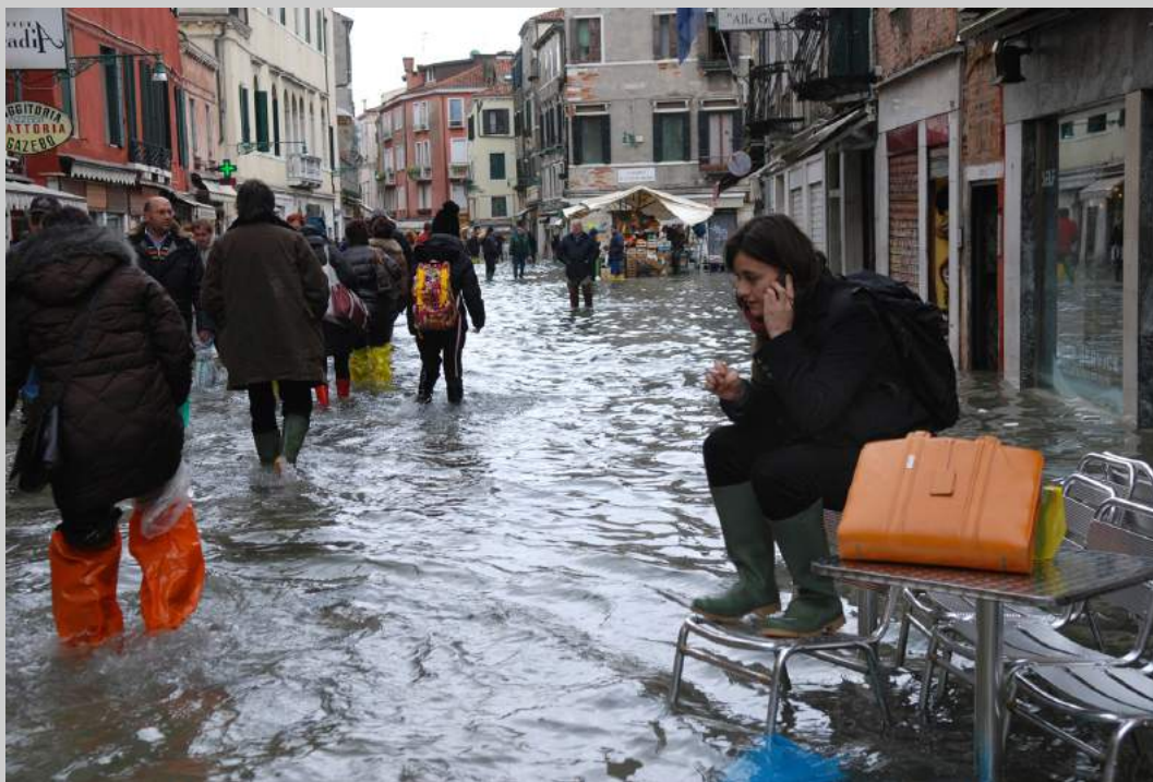
“PLEASE A BOAT” 2018 Coachella International Exhibition of Photography Photojournalism Human Interest CVDCC Silver