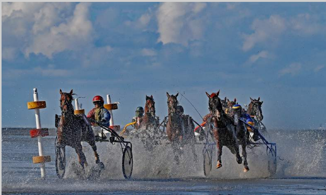
“A WET AFFAIR” © WOLFGANG KAEDING, GMPSA 2018 Coachella International Exhibition of Photography Photojournalism General