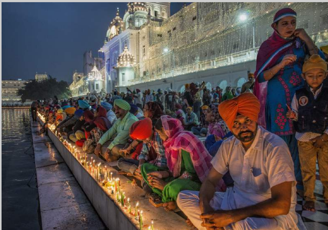
“DIWALI IN AMRITSAR” © TOM TAUBER, EPSA 2018 Coachella International Exhibition of Photography Photojournalism General