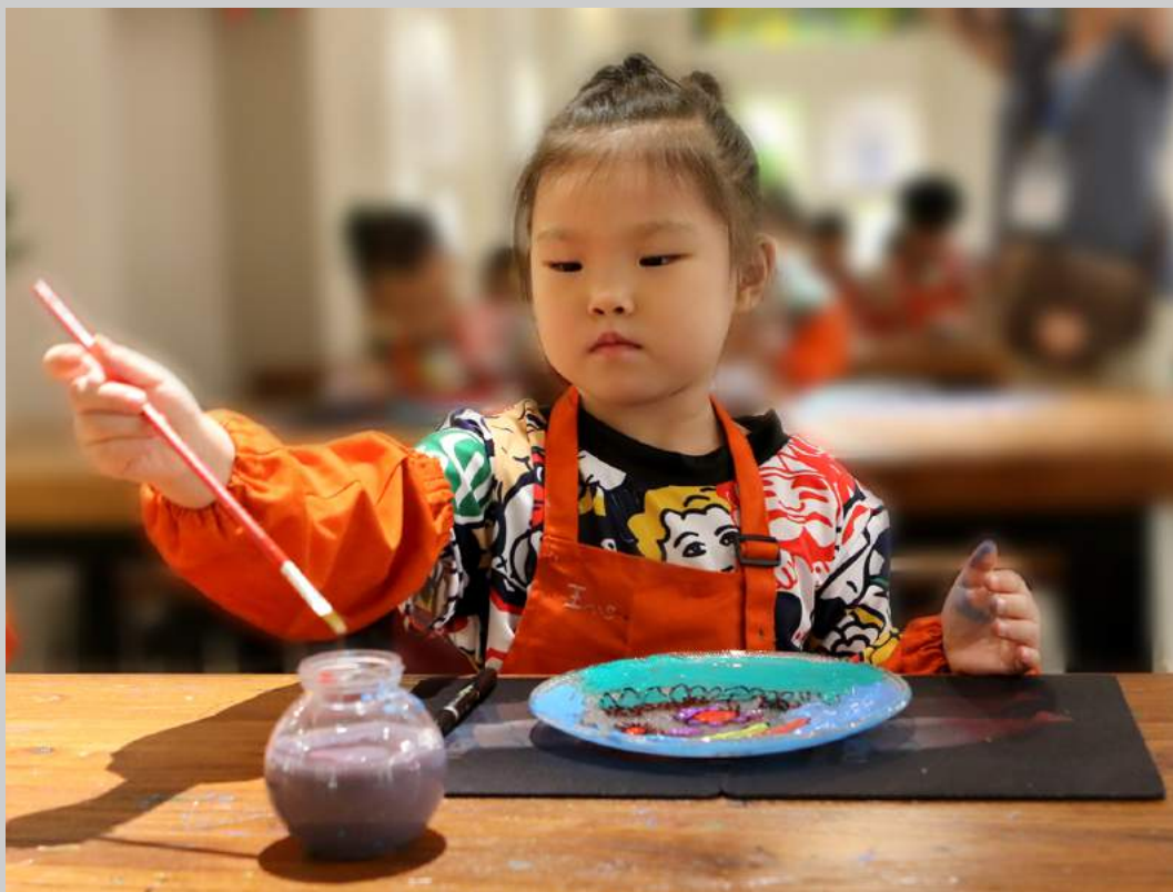
“YOUNG ARTIST” © KIEU-HANH VU 2018 Coachella International Exhibition of Photography Photojournalism Human Interest HM