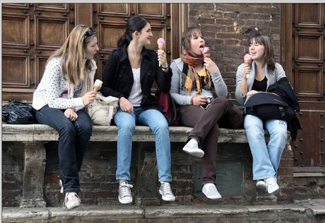
“GELATI” © GUY B. SAMOYAUULT, APSA, GMPSA 2018 Coachella International Exhibition of Photography Photojournalism Human Interest HM