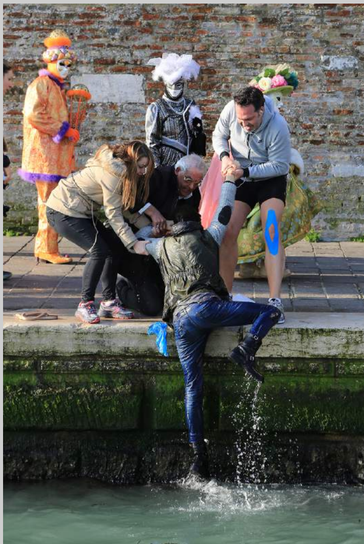
“GETTING HELPED TO DRY GROUND” 2018 Coachella International Exhibition of Photography Photojournalism Human Interest CVDCC Silver