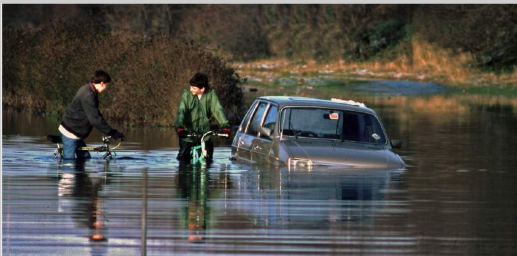
“FLOODED ROAD” Coachella International Exhibition of Photography Photojournalism Human Interest