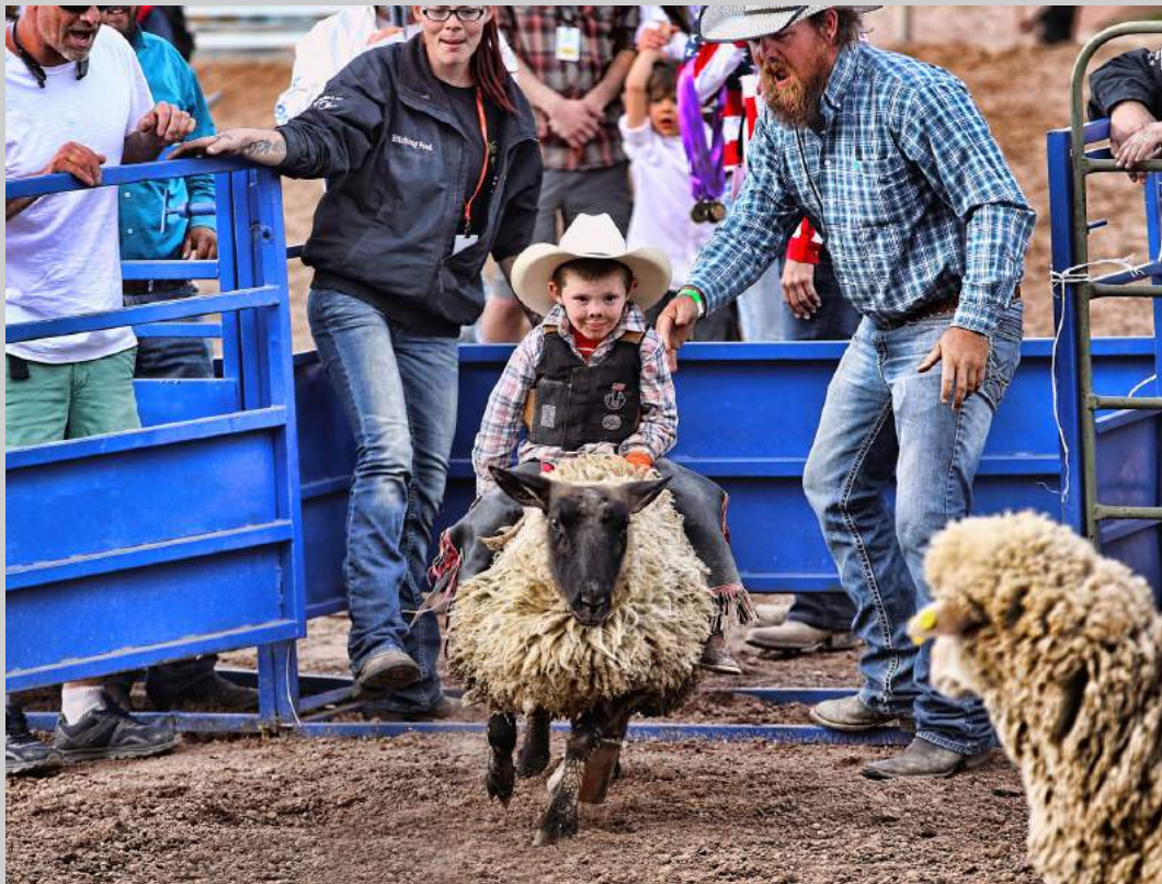
“MUTTON BUSTING” Coachella International Exhibition of Photography Photojournalism General