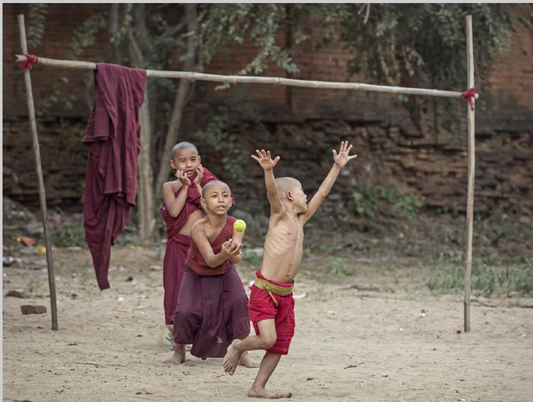
“CATCH BALL” © WEI FU, PPSA 2018 Coachella International Exhibition of Photography Photojournalism General