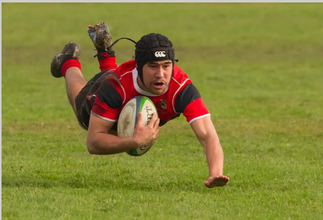
“SCORING THE WINNING TRY” Coachella International Exhibition of Photography Photojournalism General