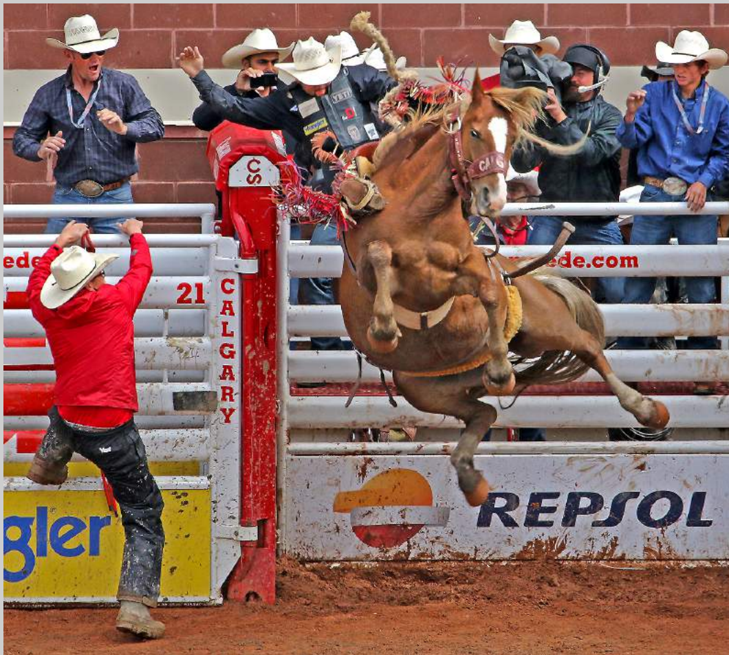
“BUCKING HORSE LEAPS OUT GATE 1879” Coachella International Exhibition of Photography Photojournalism General