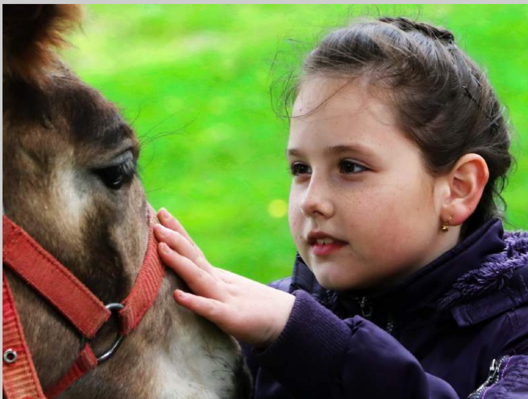
“WITH FOAL” Coachella International Exhibition of Photography Photojournalism Human Interest CVDCC Bronze