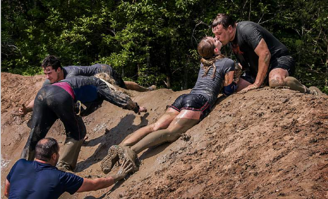
“MUD RUN HILL”  Coachella International Exhibition of Photography Photojournalism General CVDCC Silver