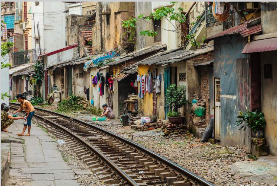
“LIFE ON THE TRACKS” © VANCE SMITH 2018 Coachella International Exhibition of Photography Photojournalism General