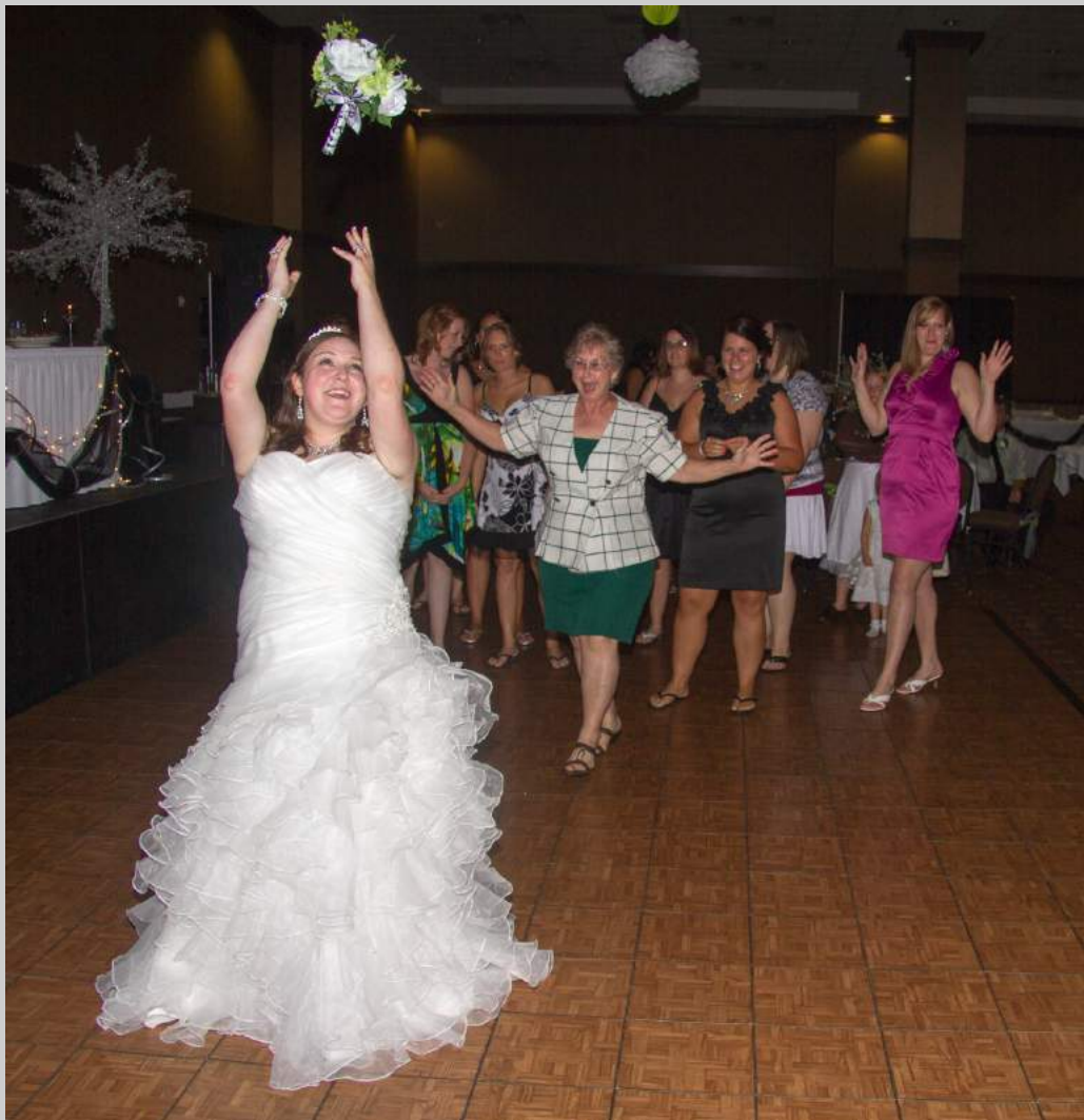
"TOSSING THE BOUQUET" 2018 Coachella International Exhibition of Photography Photojournalism Human Interest