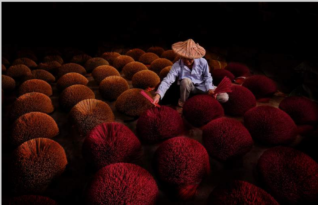
“INCENSE MAKER SORTING” Coachella International Exhibition of Photography Photojournalism Human Interest