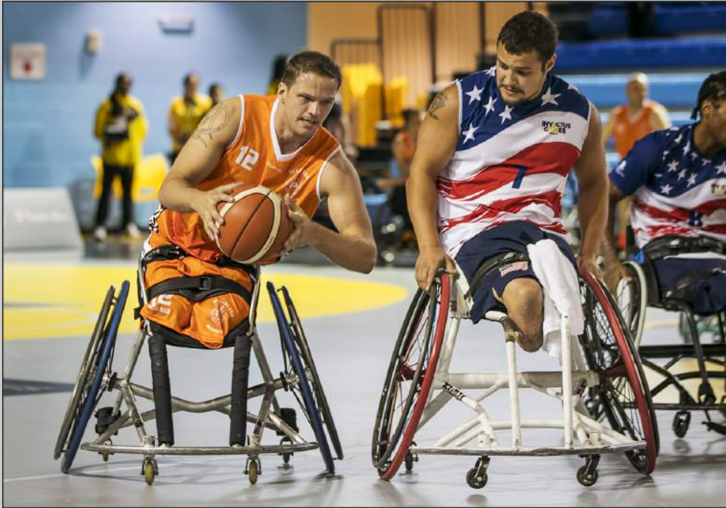
“WHEELCHAIR BB 40” © PHILLIP KWAN, GMPSA/B 2018 Coachella International Exhibition of Photography Photojournalism General