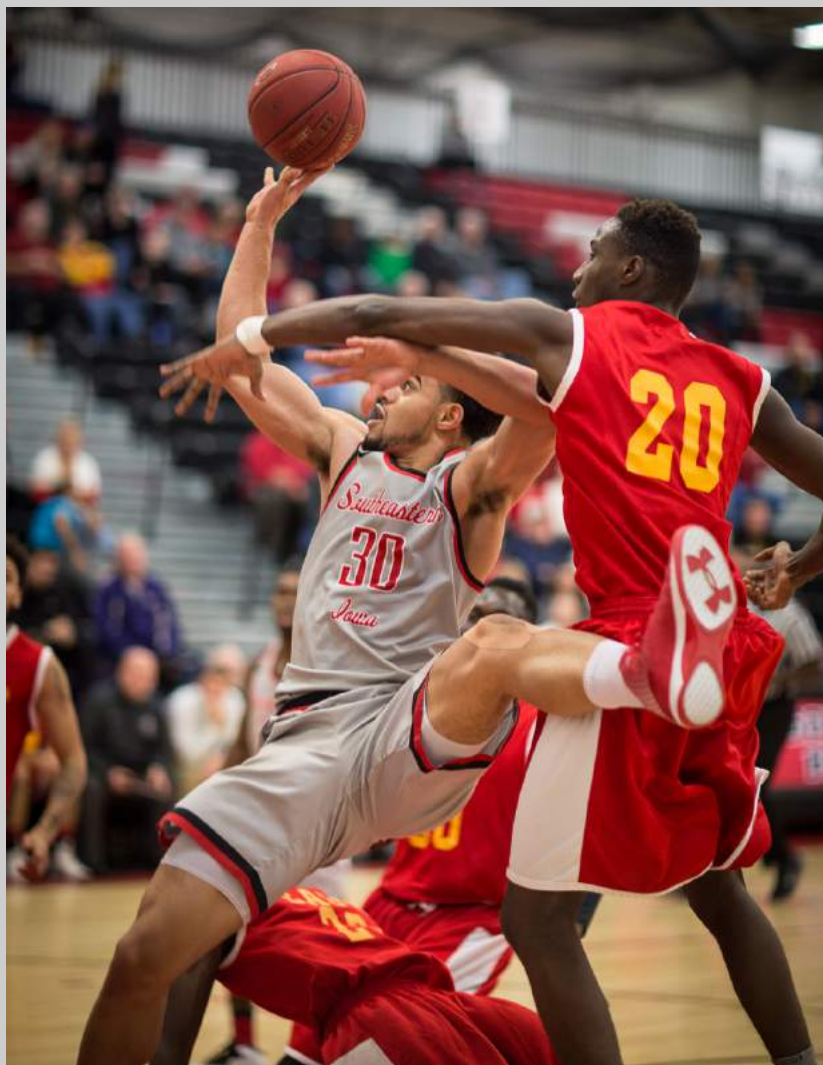
“FALLING” 2018 Coachella International Exhibition of Photography Photojournalism General