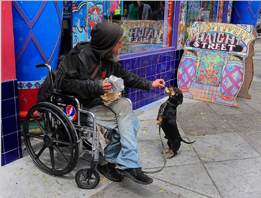
"FEEDING HIS DOG" 2018 Coachella International Exhibition of Photography Photojournalism Human Interest