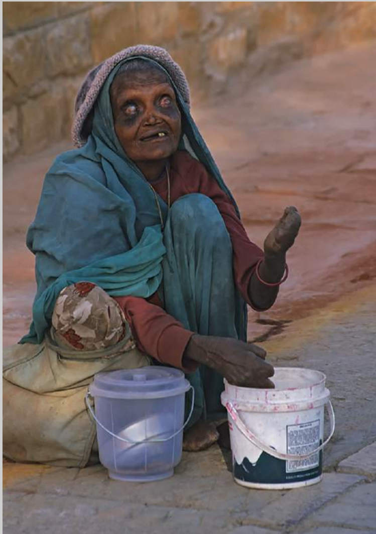
“BLIND AND POOR” 2018 Coachella International Exhibition of Photography Photojournalism Human Interest