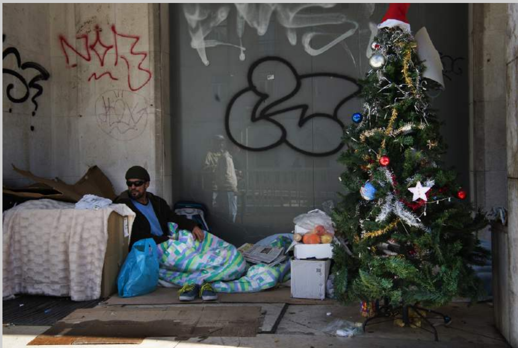
“STREET CHRISTMAS” 2018 Coachella International Exhibition of Photography Photojournalism Human Interest