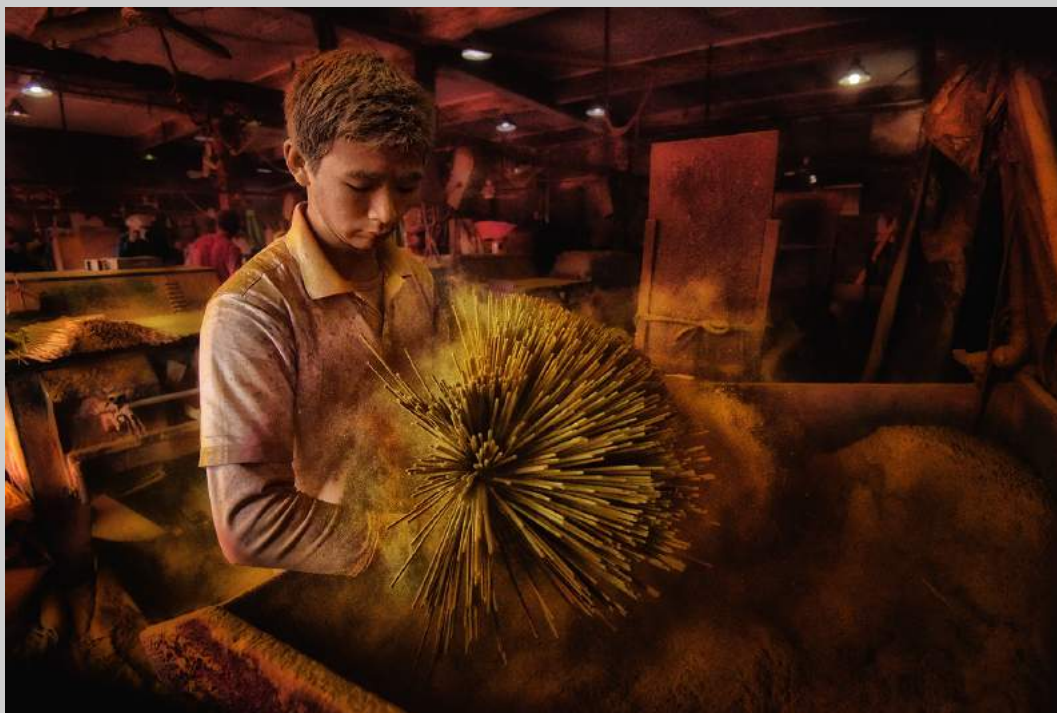
“INCENSE MAKER” © LEE ENG TAN 2018 Coachella International Exhibition of Photography Photojournalism Human Interest