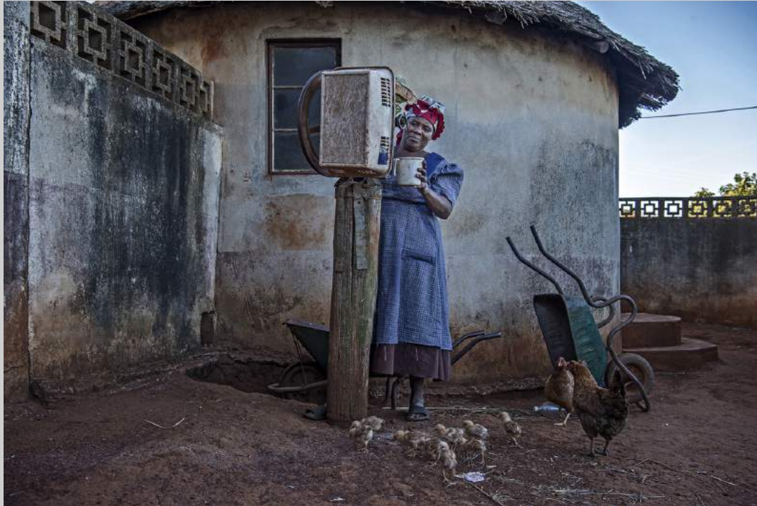
“PEASANT FAMILY1” Coachella International Exhibition of Photography Photojournalism General