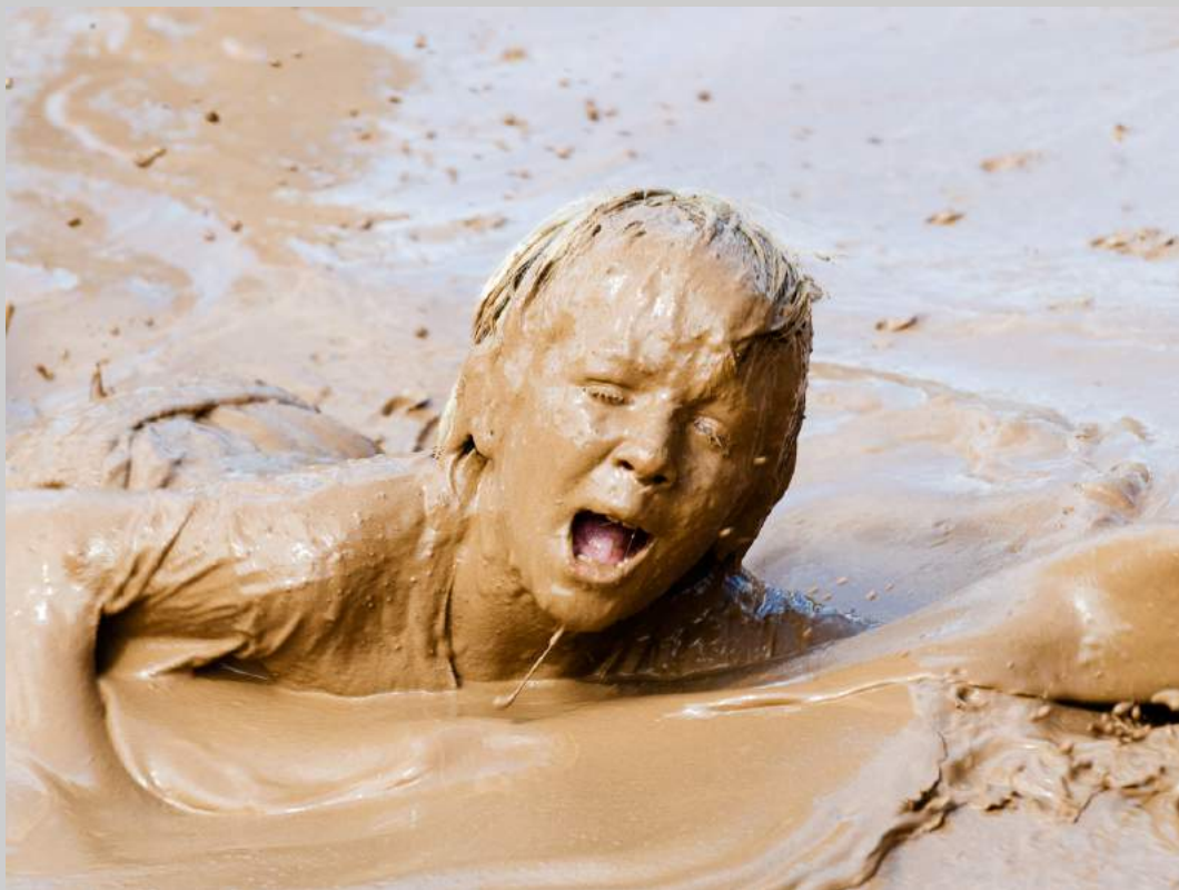
“MUDFEST FUN” © LYNN THOMPSON, FPSA, EPSA 2018 Coachella International Exhibition of Photography Photojournalism Human Interest HM