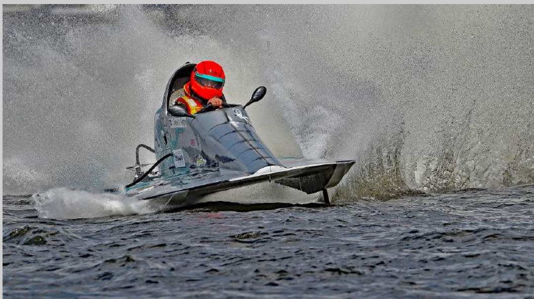
“RACEBOAT 42 IN CURVE” © WOLFGANG KAEDING, GMPSA 2018 Coachella International Exhibition of Photography Photojournalism General