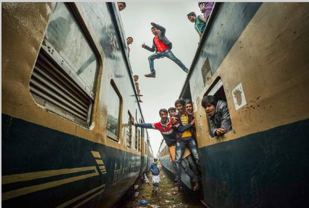
“BANGLADESH5” © JIAJUN CHAI 2018 Coachella International Exhibition of Photography Photojournalism Human Interest