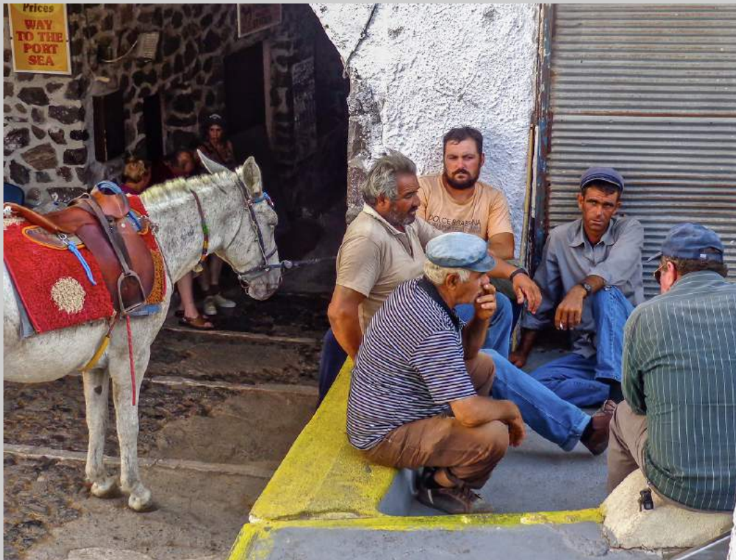
“THE EAVESDROPPER” © HOLLY KIRKLAND CLOUSER 2018 Coachella International Exhibition of Photography Photojournalism General