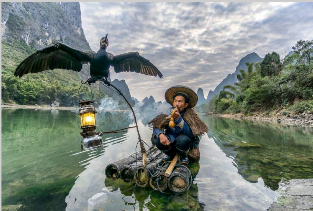
“TIME FOR RELAX” Coachella International Exhibition of Photography Photojournalism General