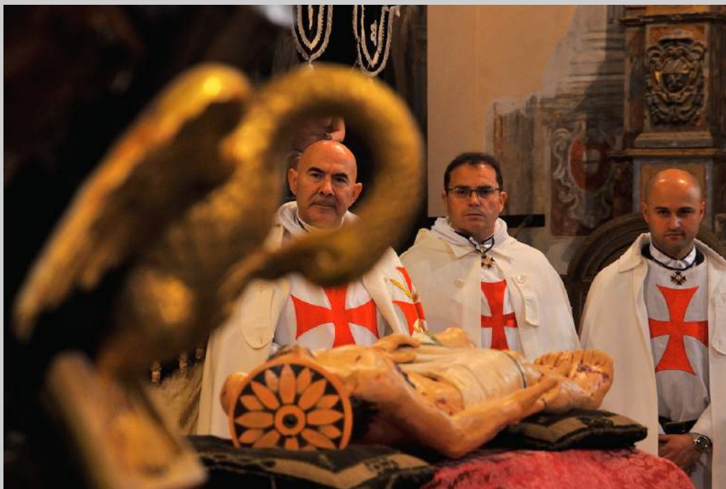
“GOOD FRIDAY” © WALTER GABERTHUEL, MPSA 2018 Coachella International Exhibition of Photography Photojournalism Human Interest