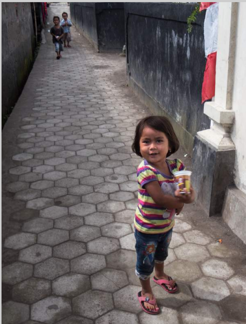
“CHARMING IN BALI” © TOM TAUBER, EPSA 2018 Coachella International Exhibition of Photography Photojournalism General