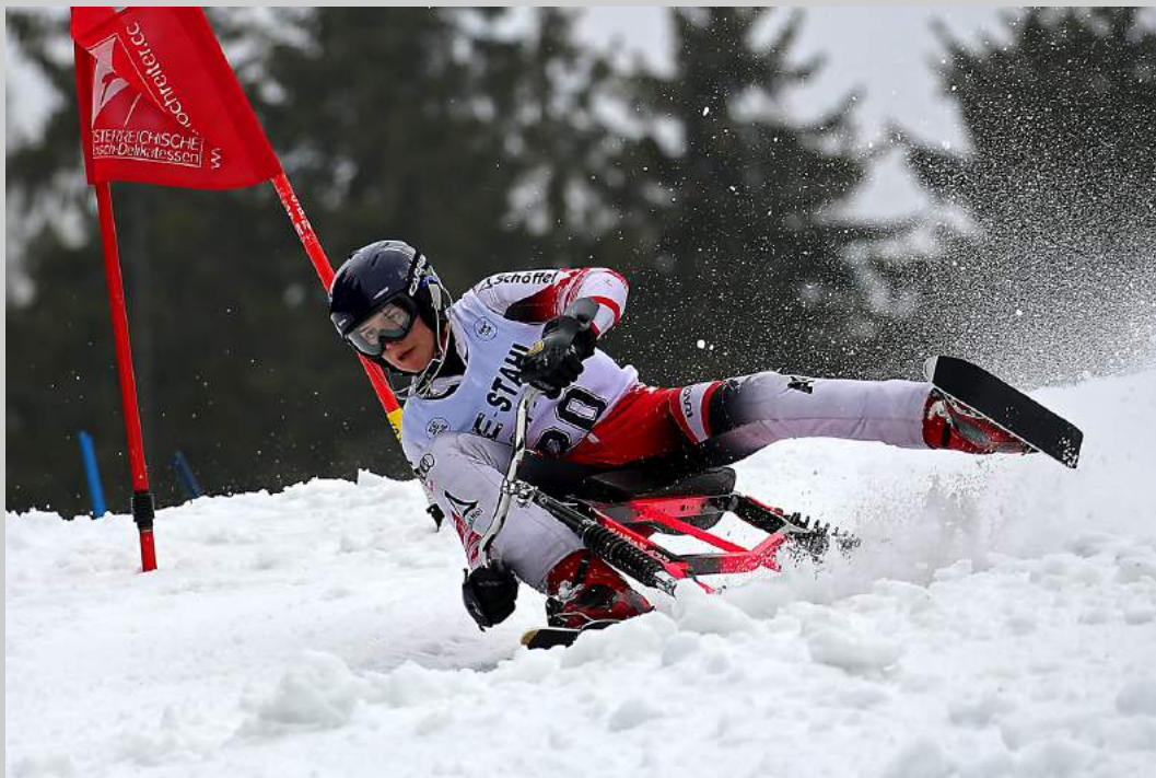
“JOACHIM” Coachella International Exhibition of Photography Photojournalism General HM