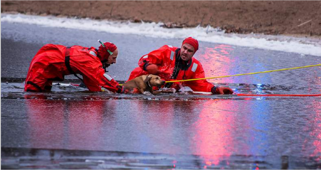
“FROZEN LAKE DOG RESCUE” © FREDERICK EMCH 2018 Coachella International Exhibition of Photography Photojournalism Human Interest Judge’s Choice