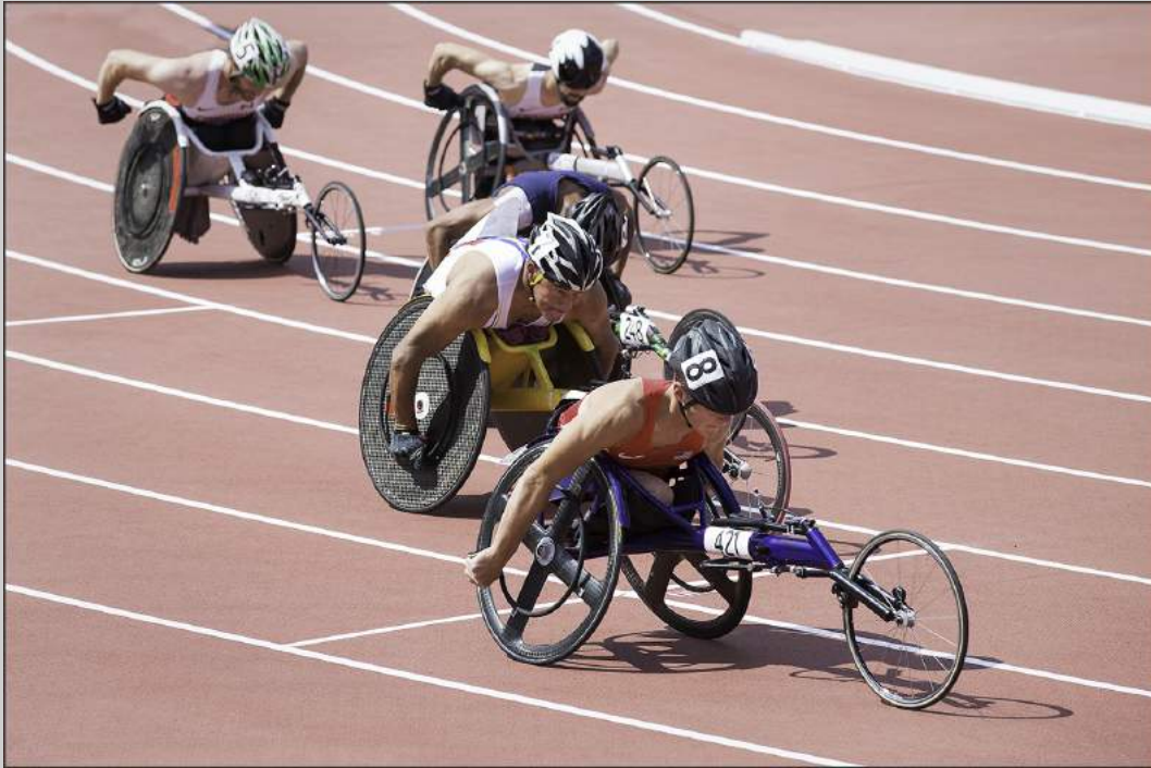
“WHEELCHAIR RACE 8” © PHILLIP KWAN, GMPSA/B 2018 Coachella International Exhibition of Photography Photojournalism General