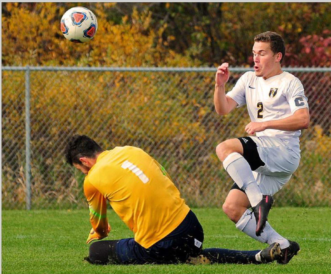
“SOCCER NINJA” 2018 Coachella International Exhibition of Photography Photojournalism General