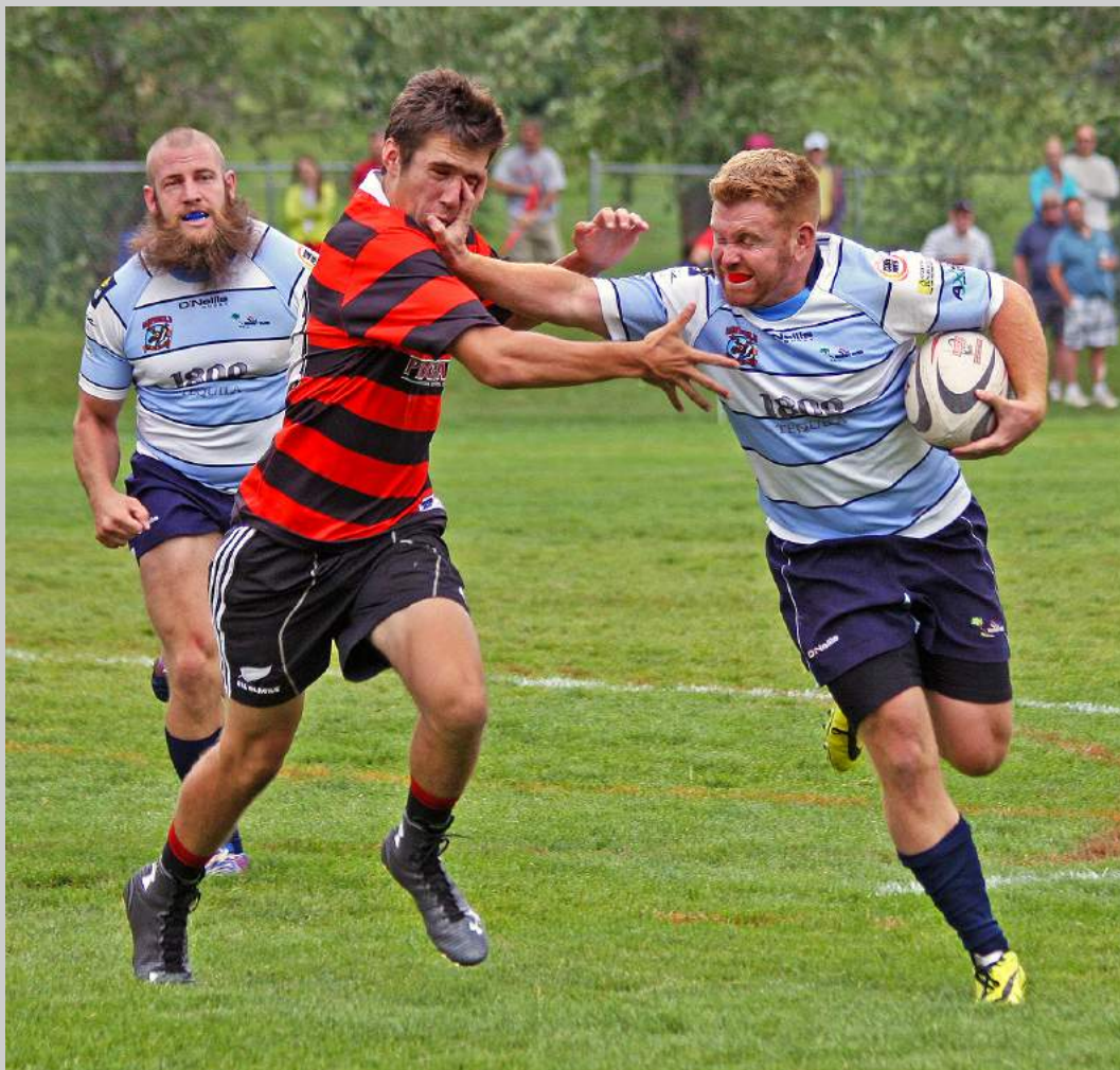
“VAIL RUGBY ACTION 1162” Coachella International Exhibition of Photography Photojournalism General CVDCC Bronze