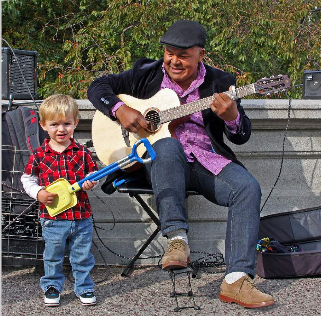
“DUALING GUITARISTS IN BOSTON 6265” Coachella International Exhibition of Photography Photojournalism Human Interest