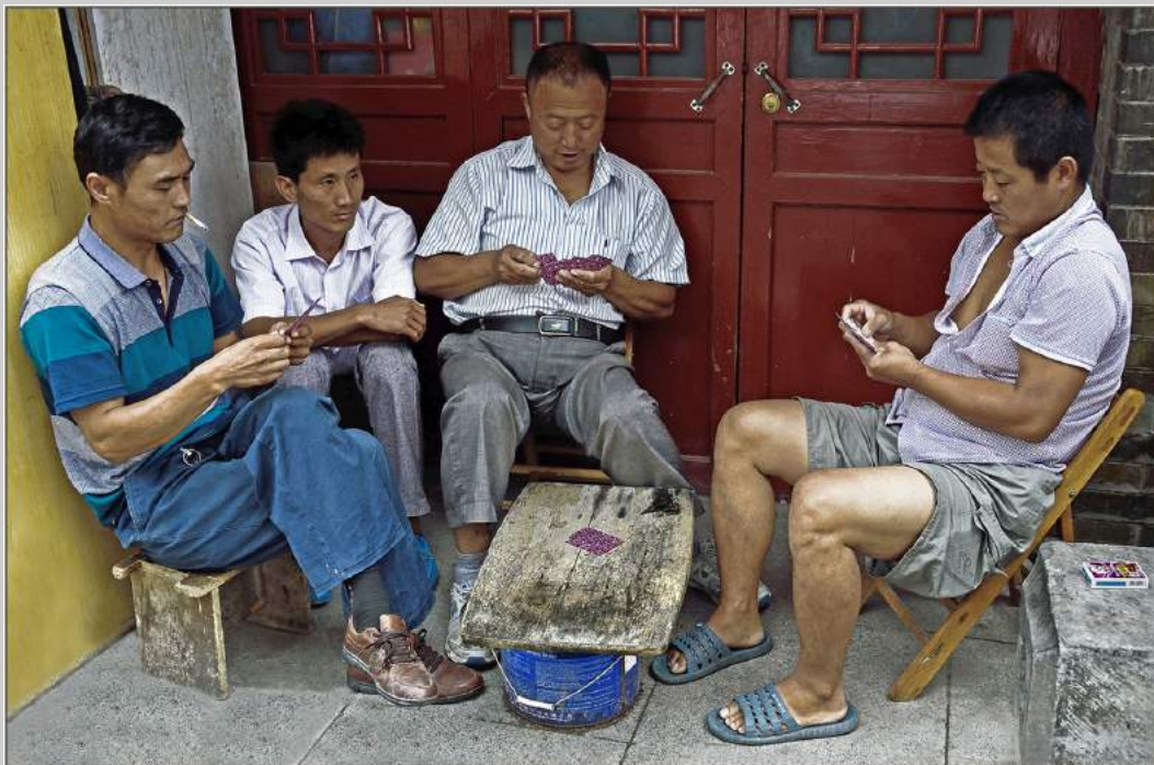
“JOUEURS DE CARTES” 2018 Coachella International Exhibition of Photography Photojournalism Human Interest