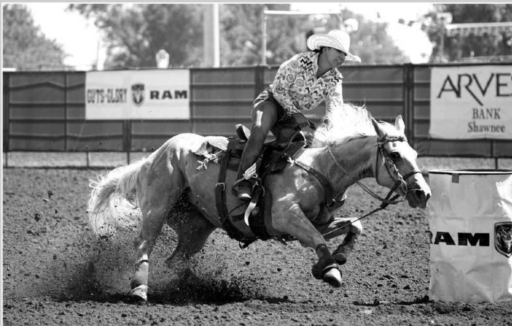
“SKIDDING AROUND THE CORNER” © WARD CONAWAY, PPSA 2018 Coachella International Exhibition of Photography Photojournalism General