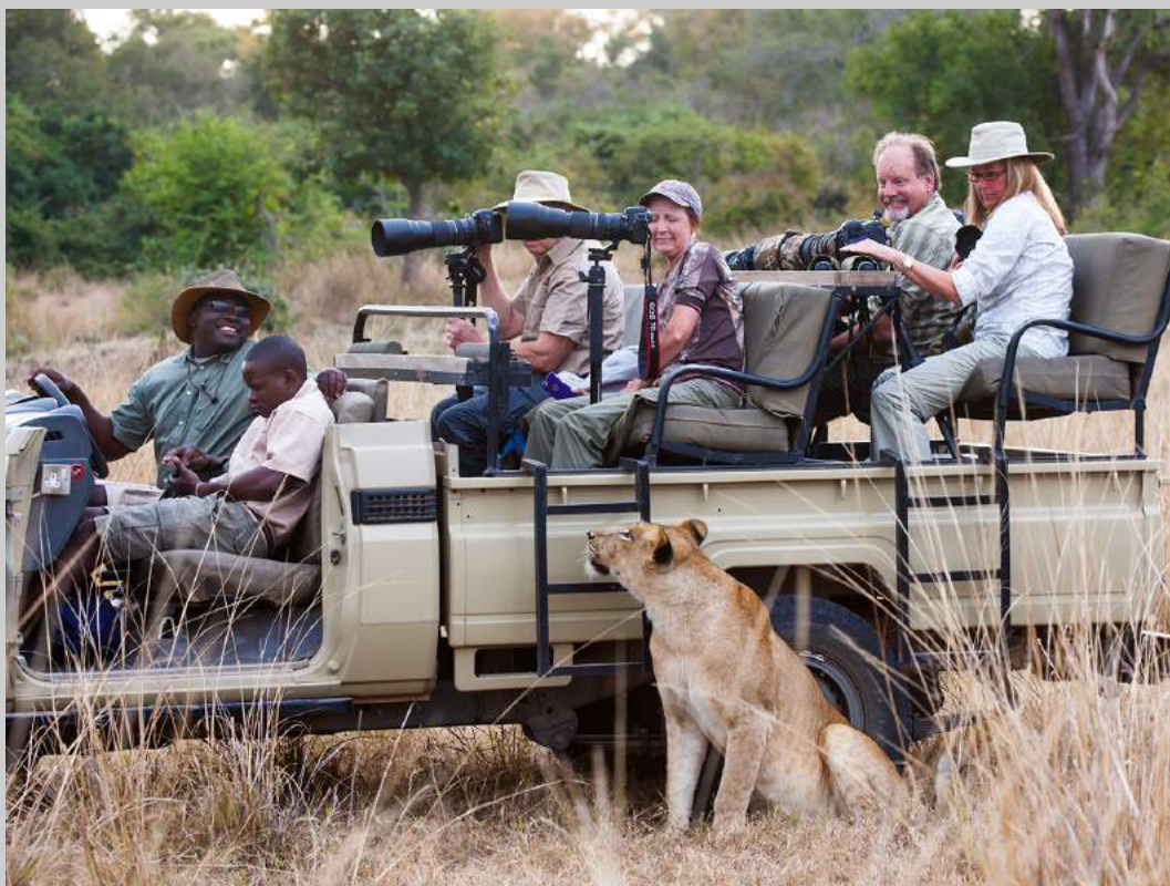
“TOO CLOSE FOR PHOTOGRAPHS” © TOM SAVAGE, APSA, MPSA 2018 Coachella International Exhibition of Photography Photojournalism Human Interest Judge’s Choice