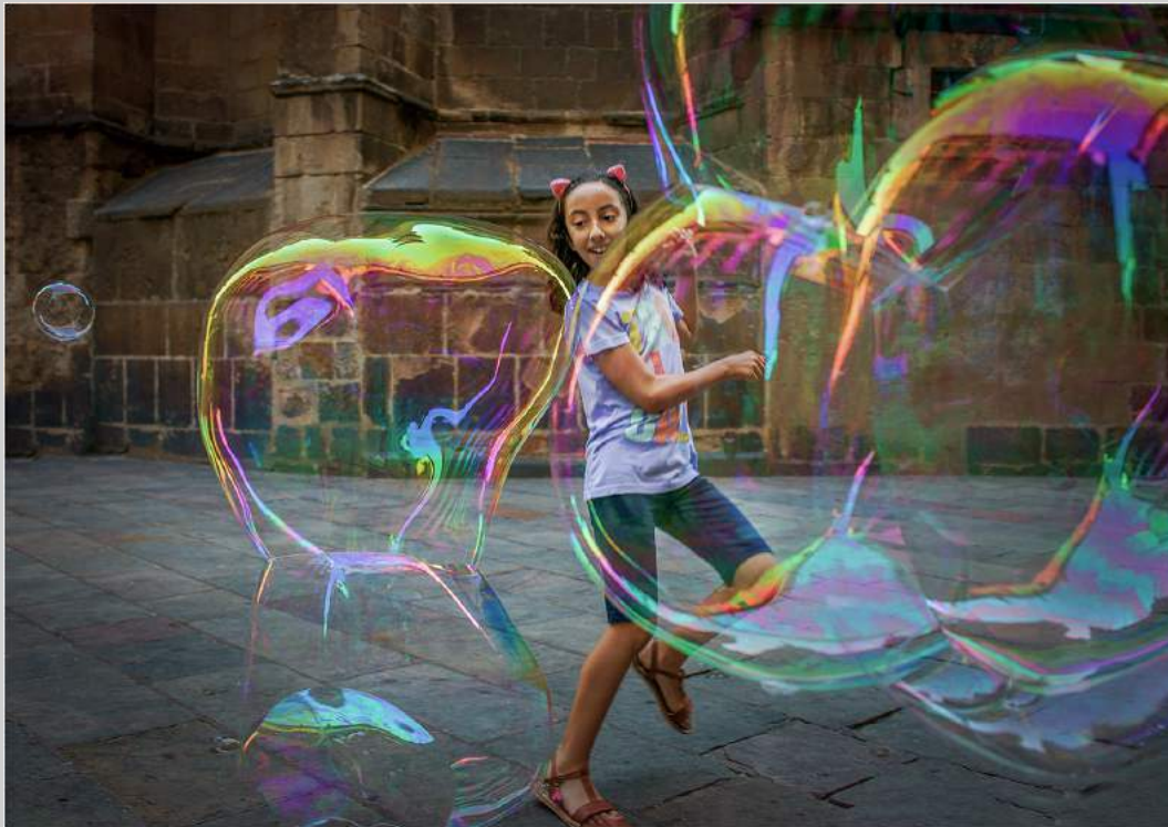
“PLAY 4” © YI WAN, MPSA 2018 Coachella International Exhibition of Photography Photojournalism Human Interest