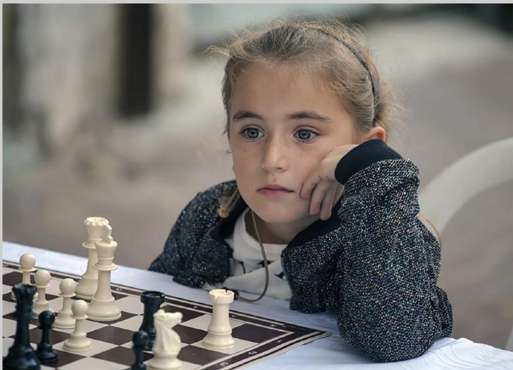
“THE CHESS QUEEN.” © GENADI BRODSKY 2018 Coachella International Exhibition of Photography Photojournalism General CVDCC Bronze