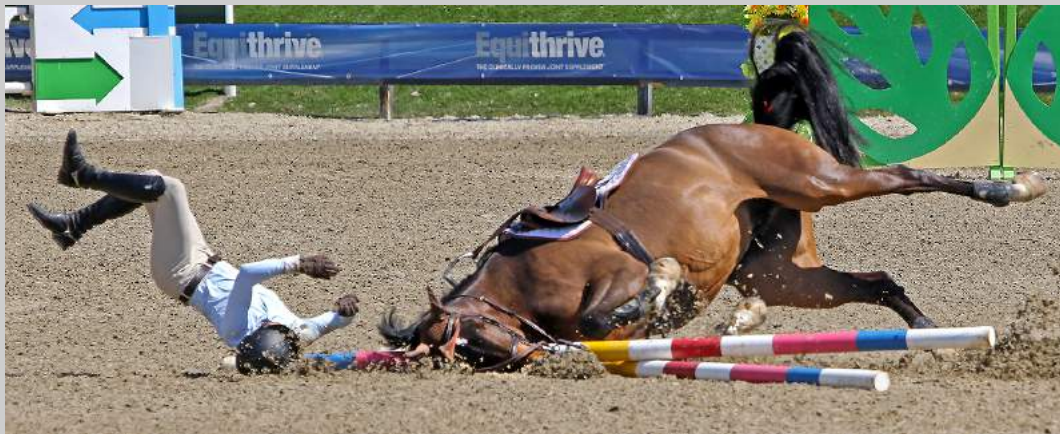
“RIDER & HORSE DOWN HEAD FIRST 3158” Coachella International Exhibition of Photography Photojournalism General HM