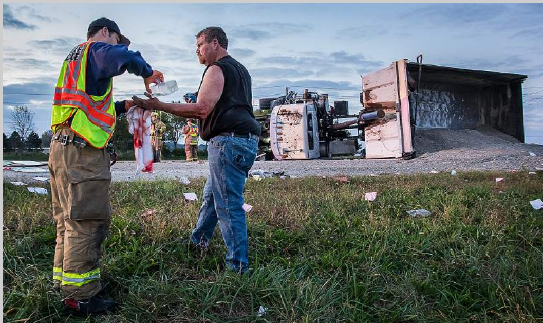
“TRUCK DRIVER GETS TREATMENT” Coachella International Exhibition of Photography Photojournalism Human Interest