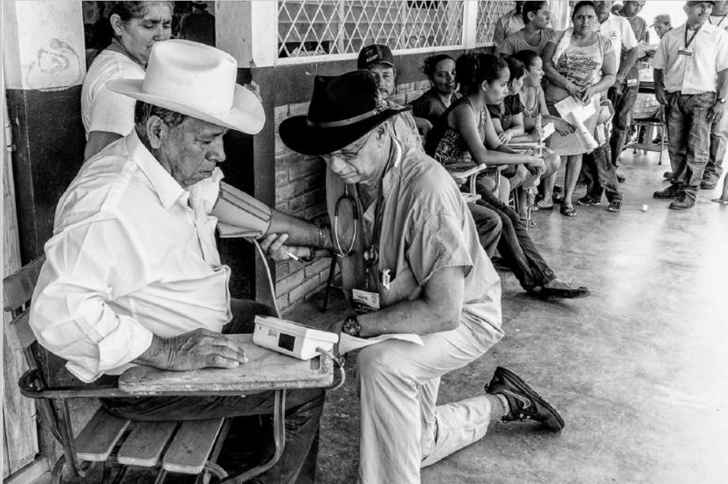
“JOY AND SORROW” © GABRIELE DELLANAVE 2018 Coachella International Exhibition of Photography Photojournalism General HM