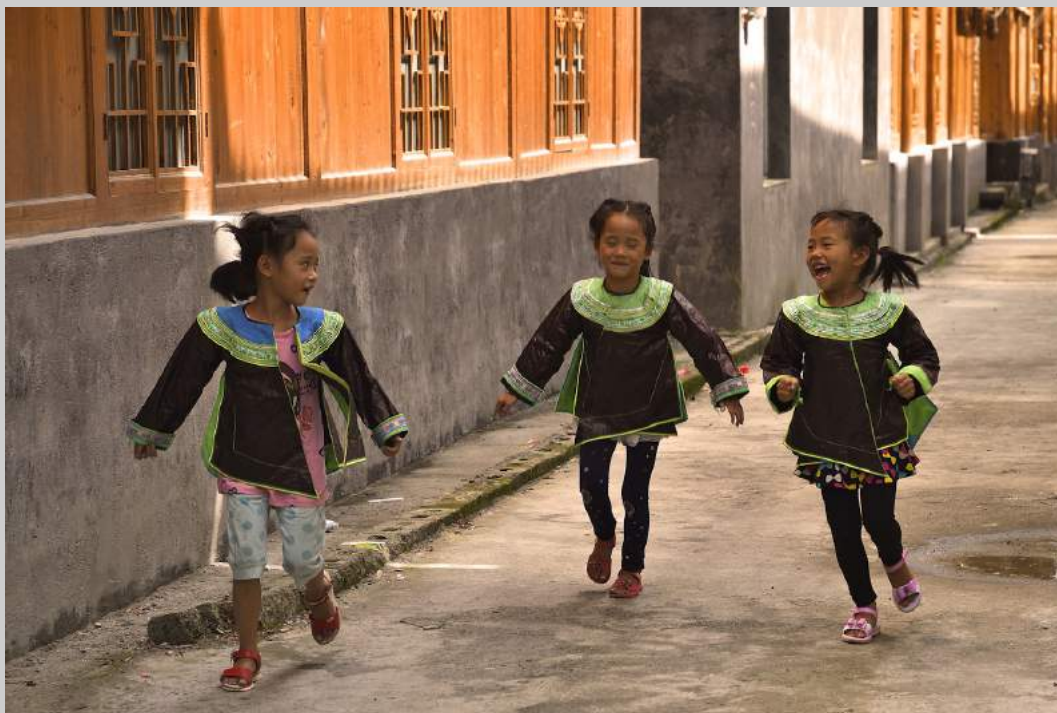
“RUNNING GIRLS” © WALTER GABERTHUEL, MPSA 2018 Coachella International Exhibition of Photography Photojournalism Human Interest HM