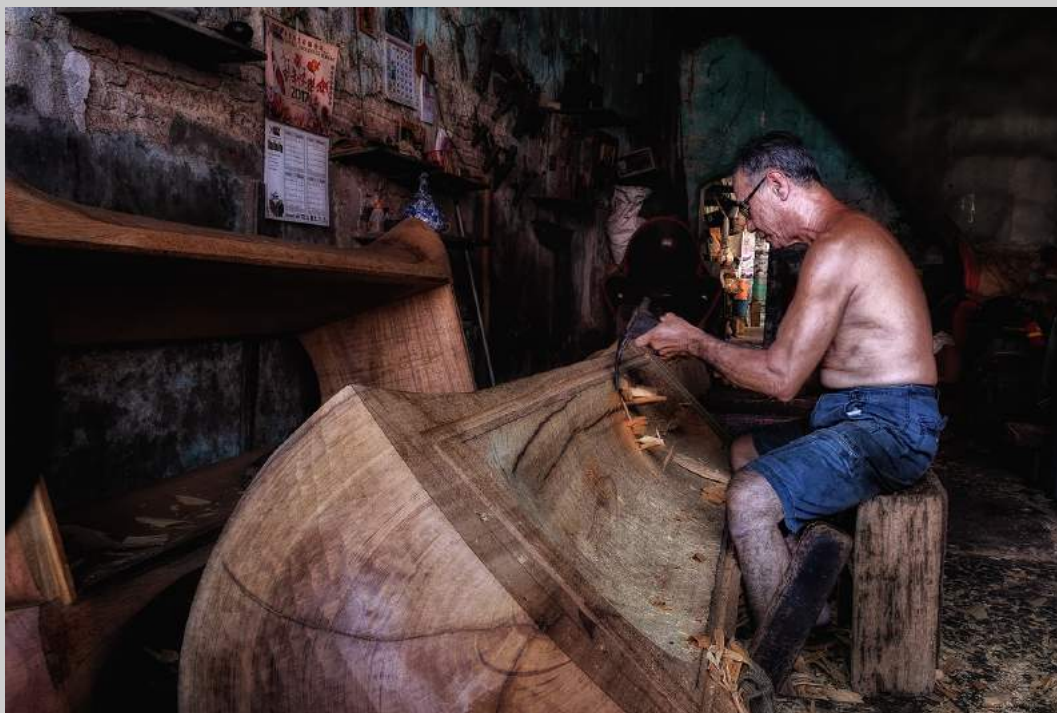
“COFFIN MAKER” © LEE ENG TAN 2018 Coachella International Exhibition of Photography Photojournalism General HM