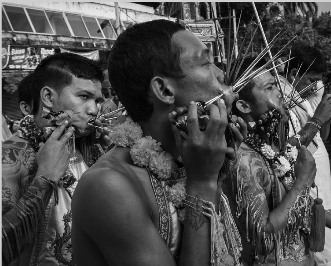
"CRUEL RITUAL" © WEI FU, PPSA 2018 Coachella International Exhibition of Photography Photojournalism General