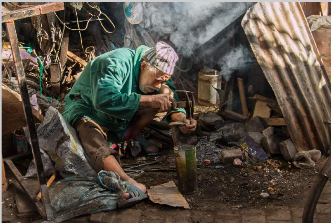
“OUT FOR REPAIR” © G. MARGARET HENNES 2018 Coachella International Exhibition of Photography Photojournalism Human Interest CVDCC Bronze