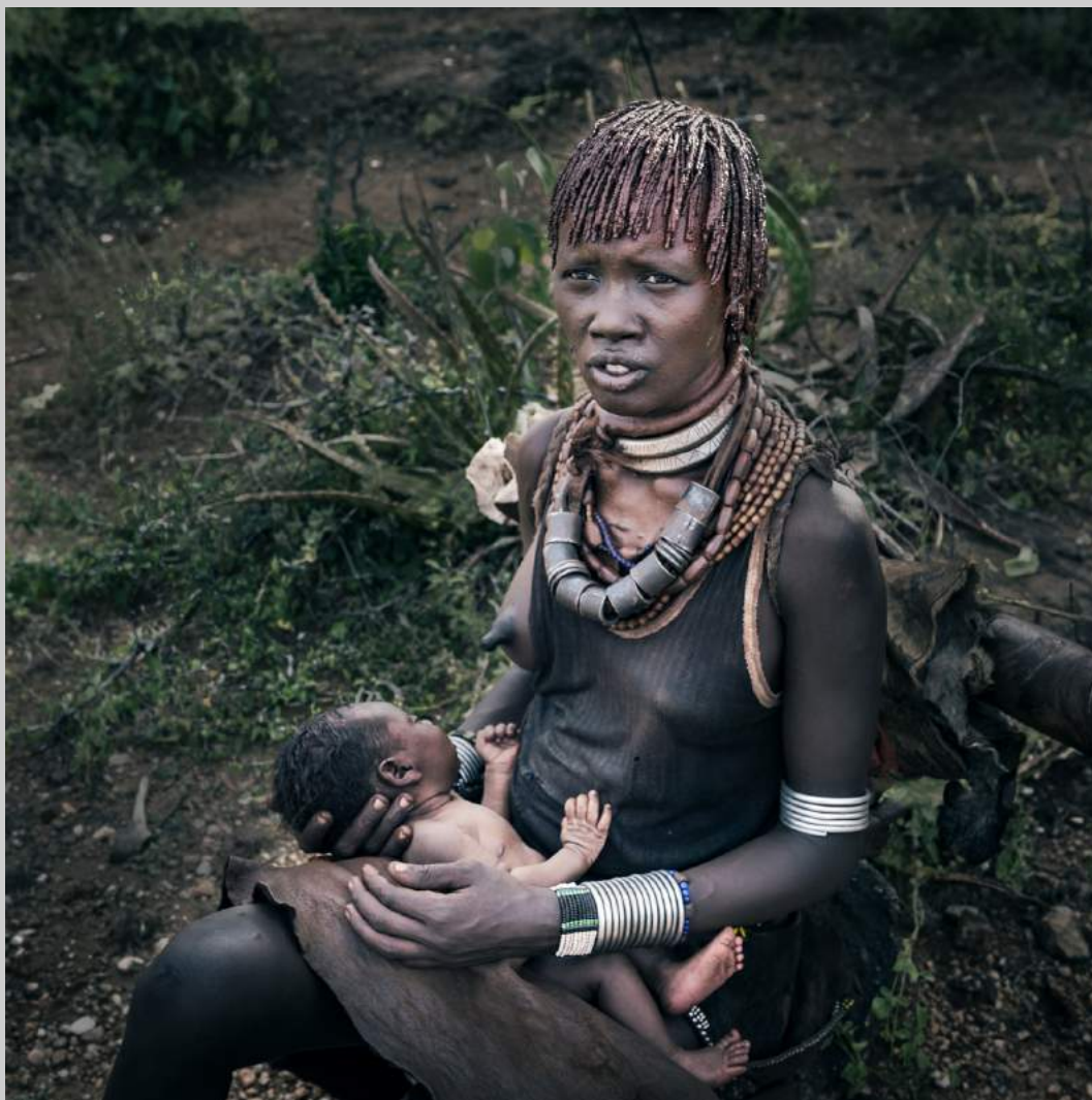
“TRIBAL PEOPLE17” © LANFENG CHEN 2018 Coachella International Exhibition of Photography Photojournalism General