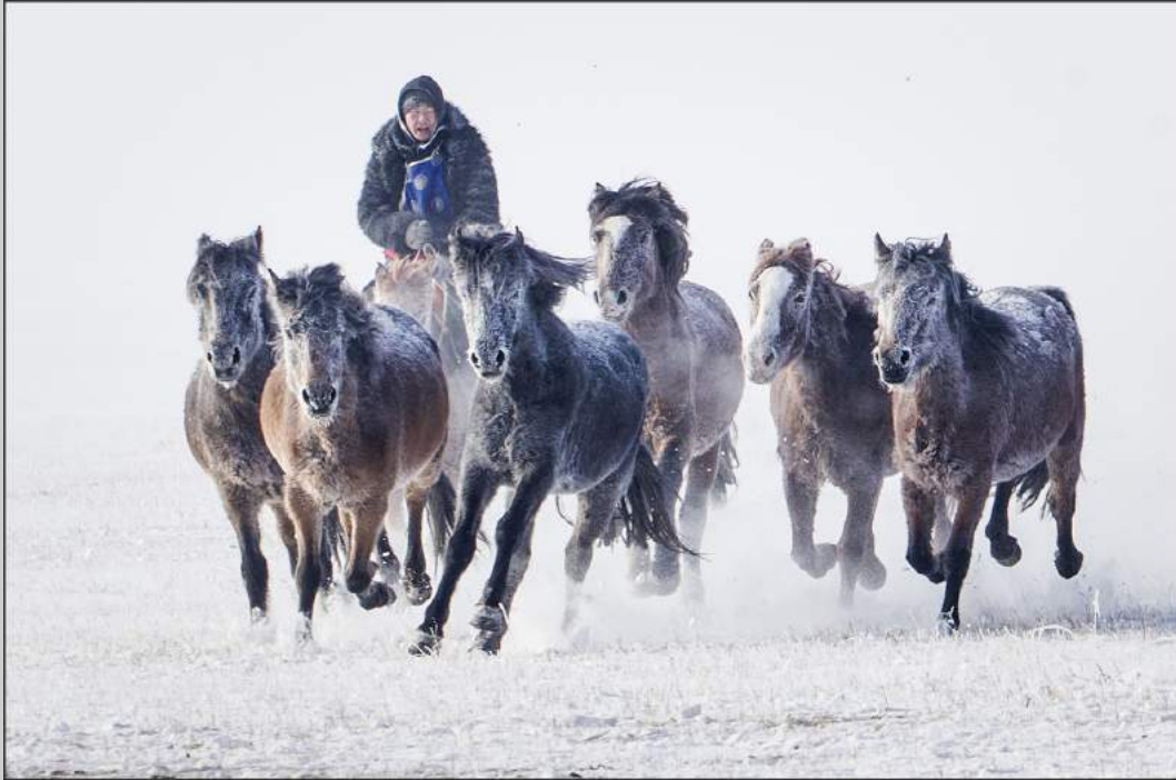
“HORSE ROUND UP 54” 2018 Coachella International Exhibition of Photography Photojournalism General