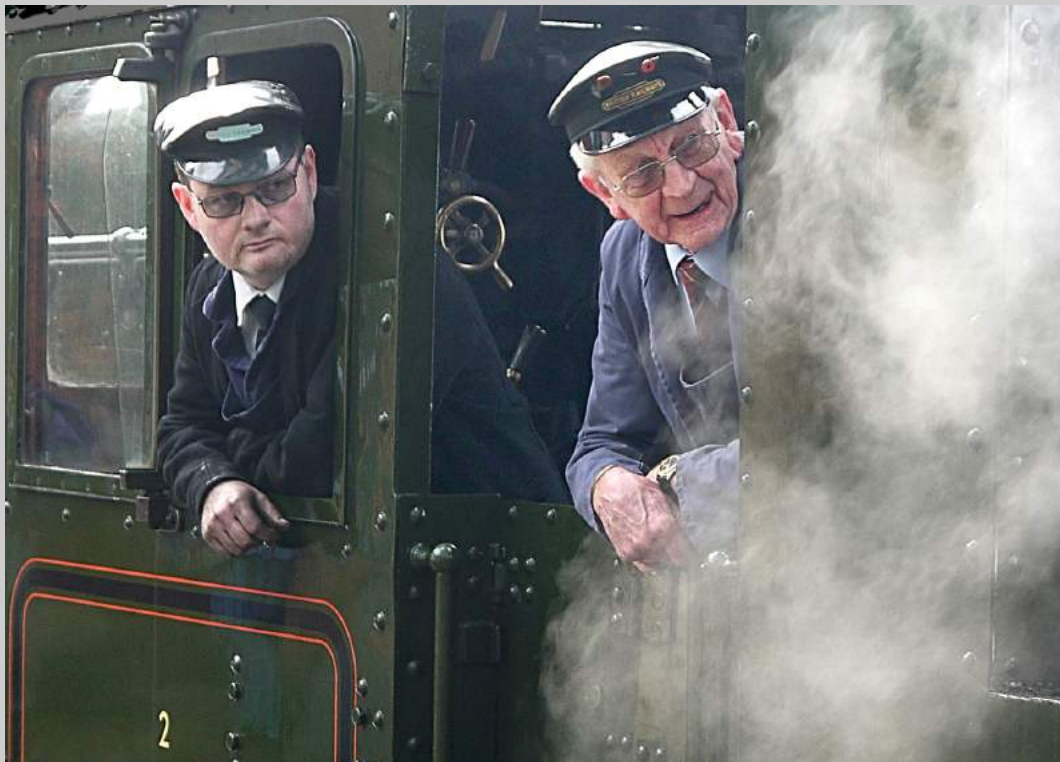
“READY TO GO” Coachella International Exhibition of Photography Photojournalism Human Interest