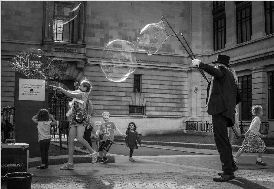
“COLOR BUBBLES 7” © YI WAN, MPSA 2018 Coachella International Exhibition of Photography Photojournalism Human Interest