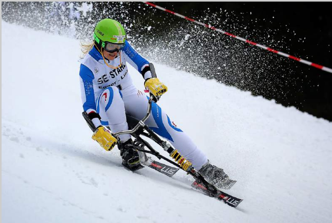
“CLAUDIA” © ALBERT PEER 2018 Coachella International Exhibition of Photography Photojournalism General CVDCC Bronze