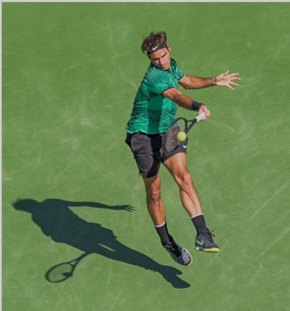
“ROGER 7628” Coachella International Exhibition of Photography Photojournalism General