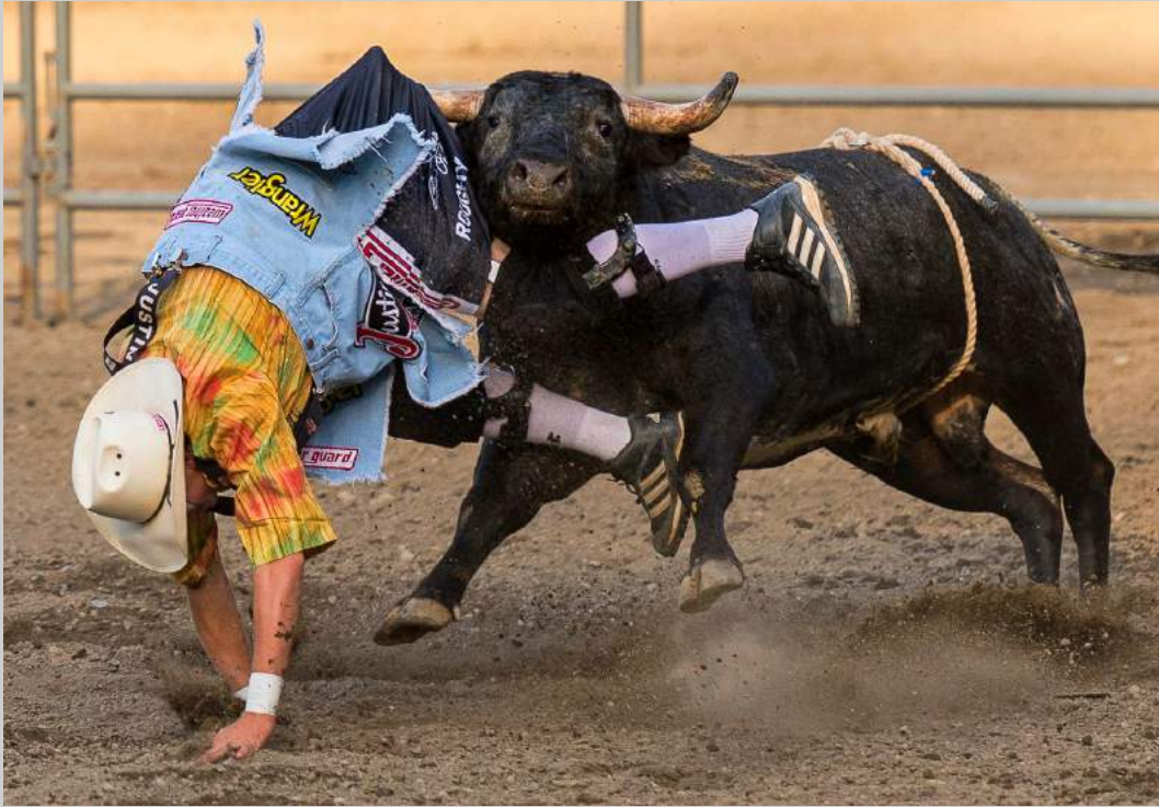
“BY THE SHORTS” © KURT DEVOE 2018 Coachella International Exhibition of Photography Photojournalism General CVDCC Gold