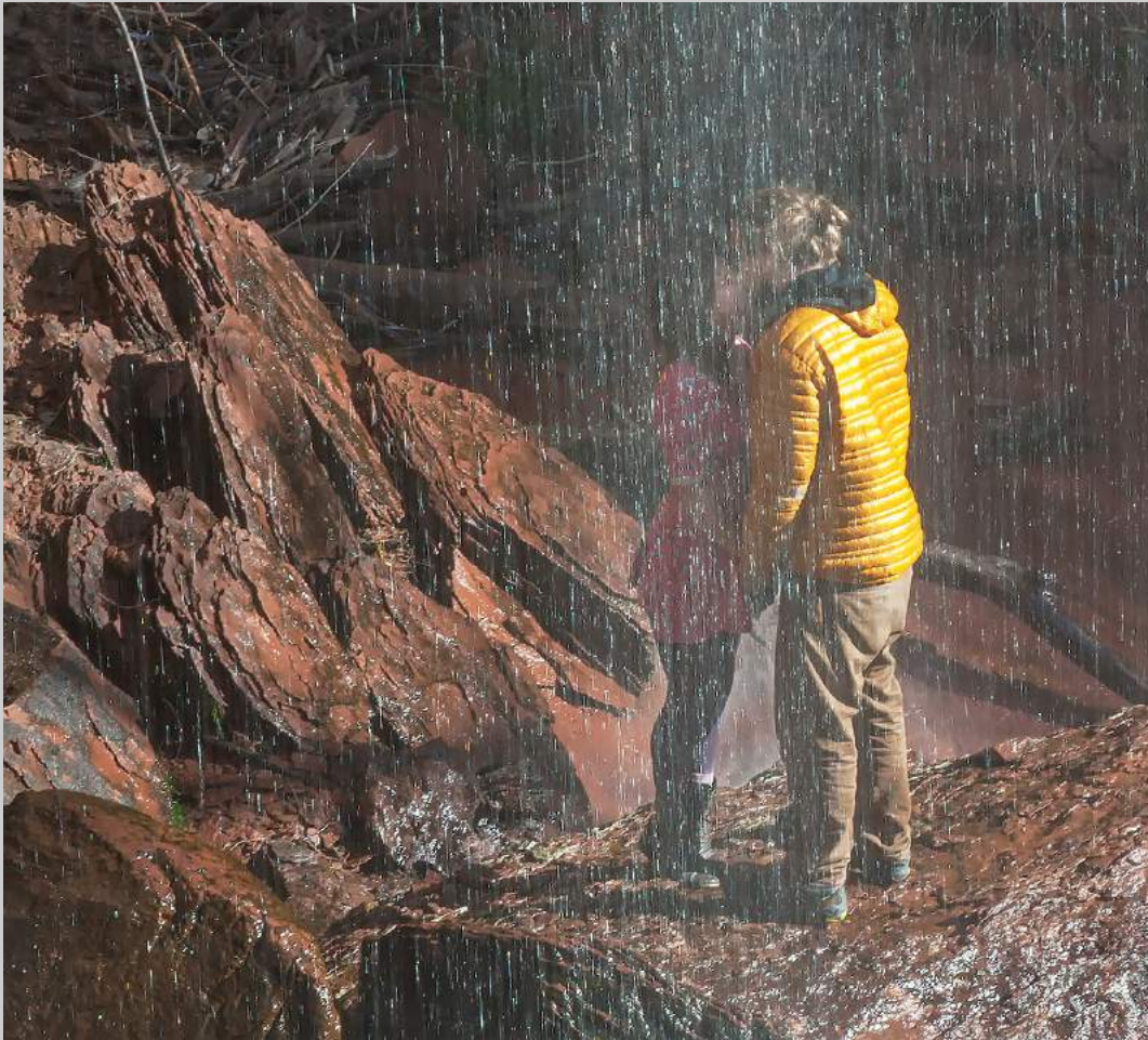
“KISSING BEHIND THE WATERFALL” 2018 Coachella International Exhibition of Photography Photojournalism Human Interest