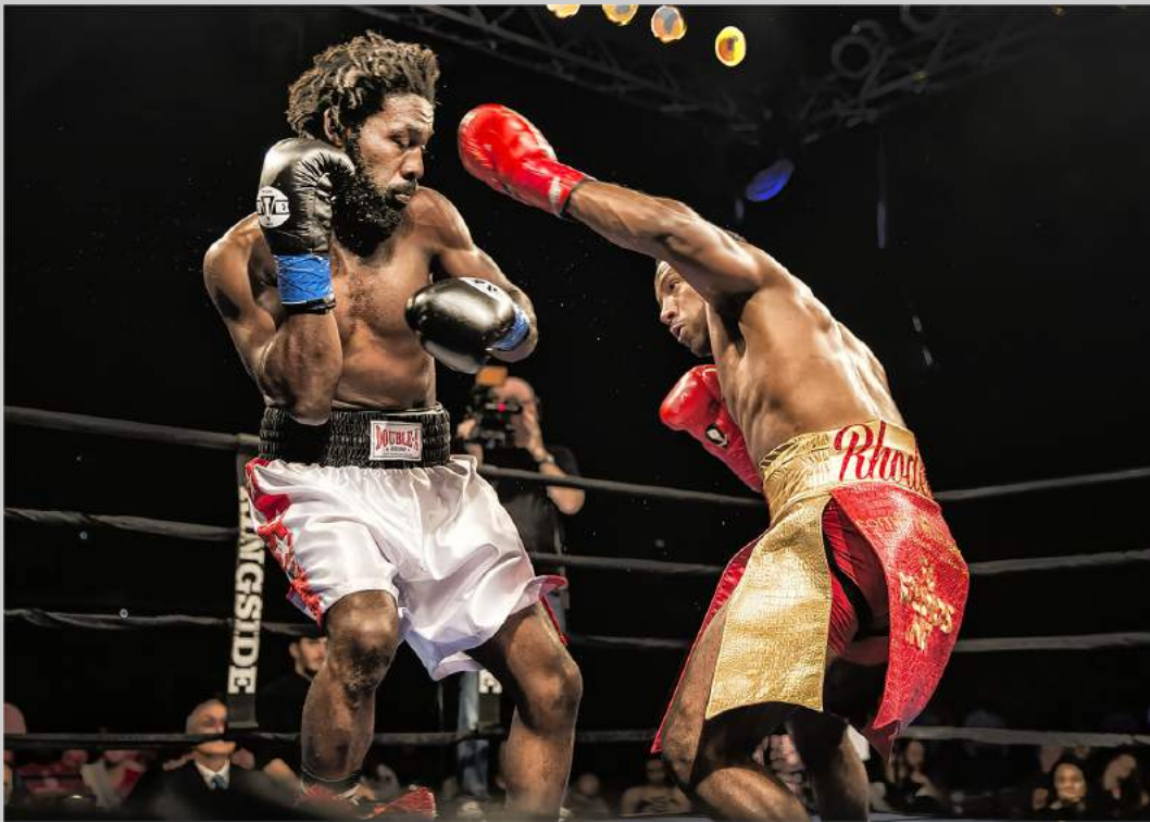
“ON THE ATTACK” 2018 Coachella International Exhibition of Photography Photojournalism General