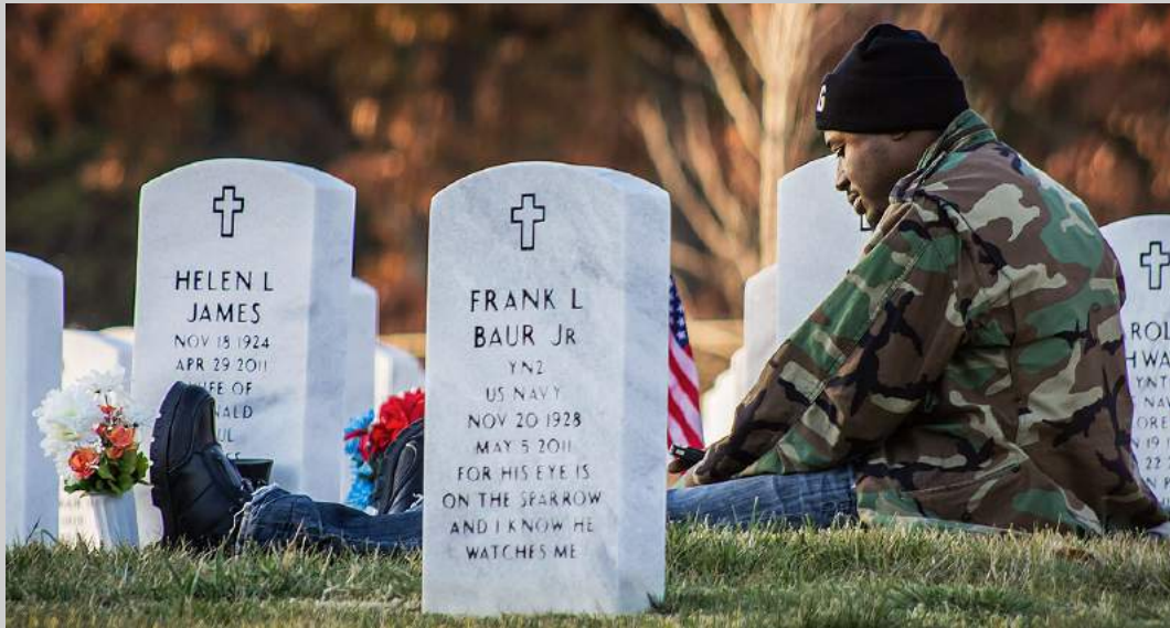
"HE WILL ALWAYS REMEMBER" Coachella International Exhibition of Photography Photojournalism Human Interest