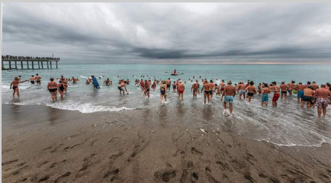
“CIMENTO INVERNALE” © EMANUELE ZUFFO, PPSA 2018 Coachella International Exhibition of Photography Photojournalism General