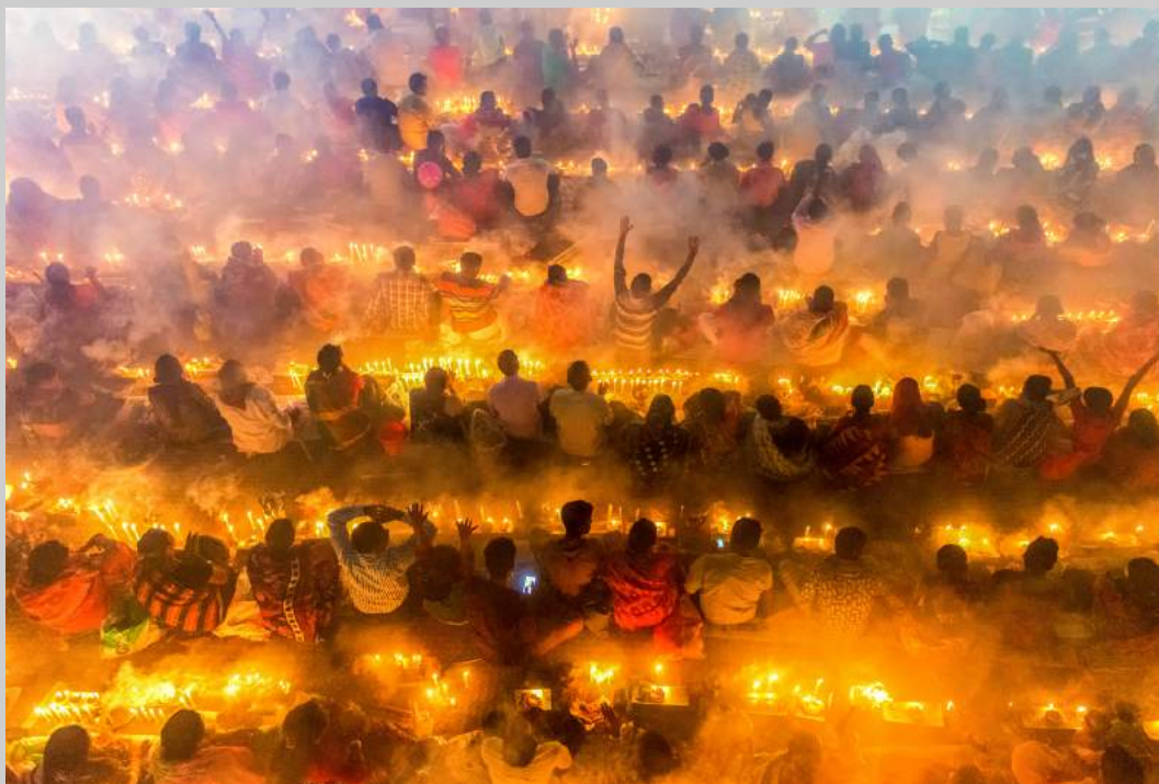
“PRAYER ON FIRE” Coachella International Exhibition of Photography Photojournalism General