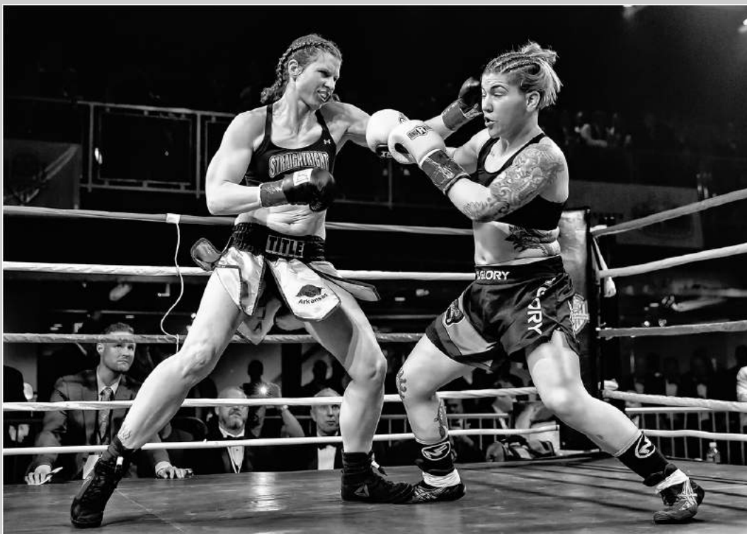
“WARRIOR QUEENS” © RANDY CARR, APSA, MPSA 2018 Coachella International Exhibition of Photography Photojournalism General Judge’s Choice