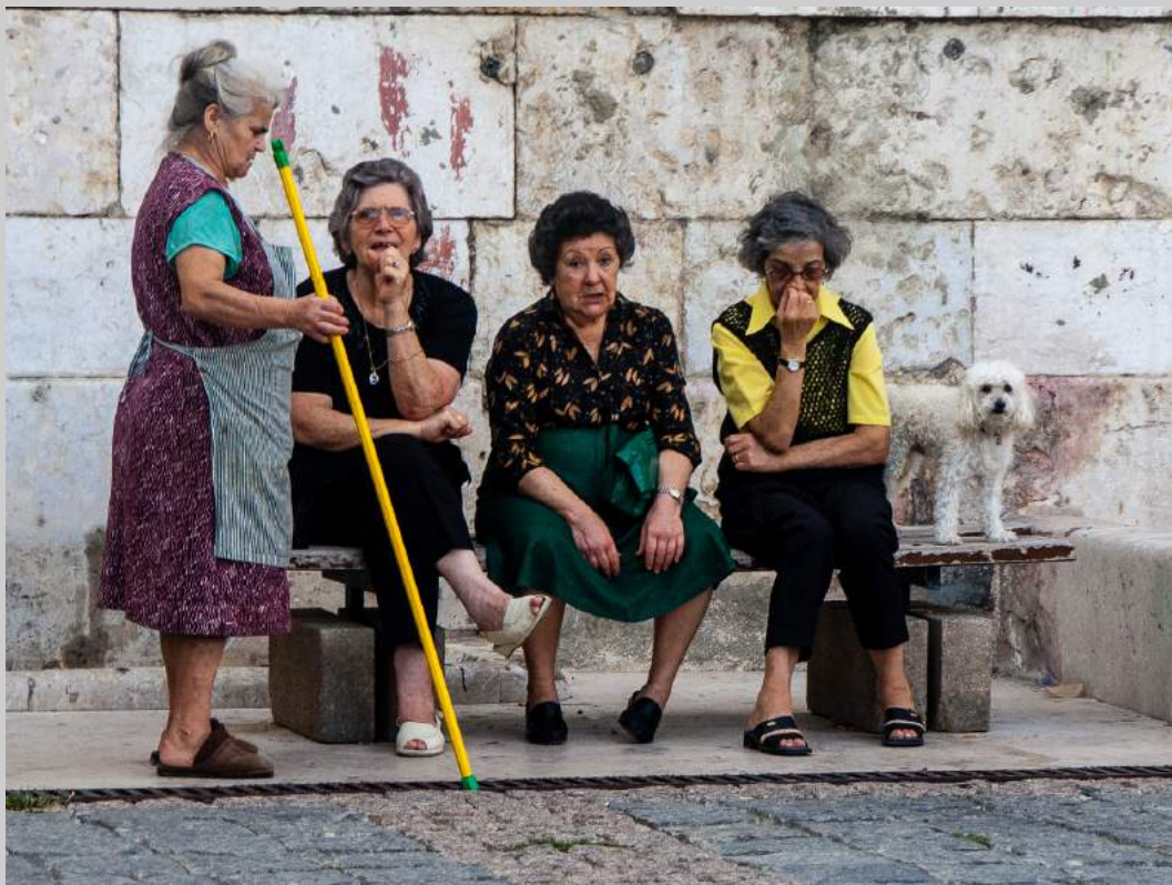
“MORNING BREAK” 2018 Coachella International Exhibition of Photography Photojournalism Human Interest Judge’s Choice