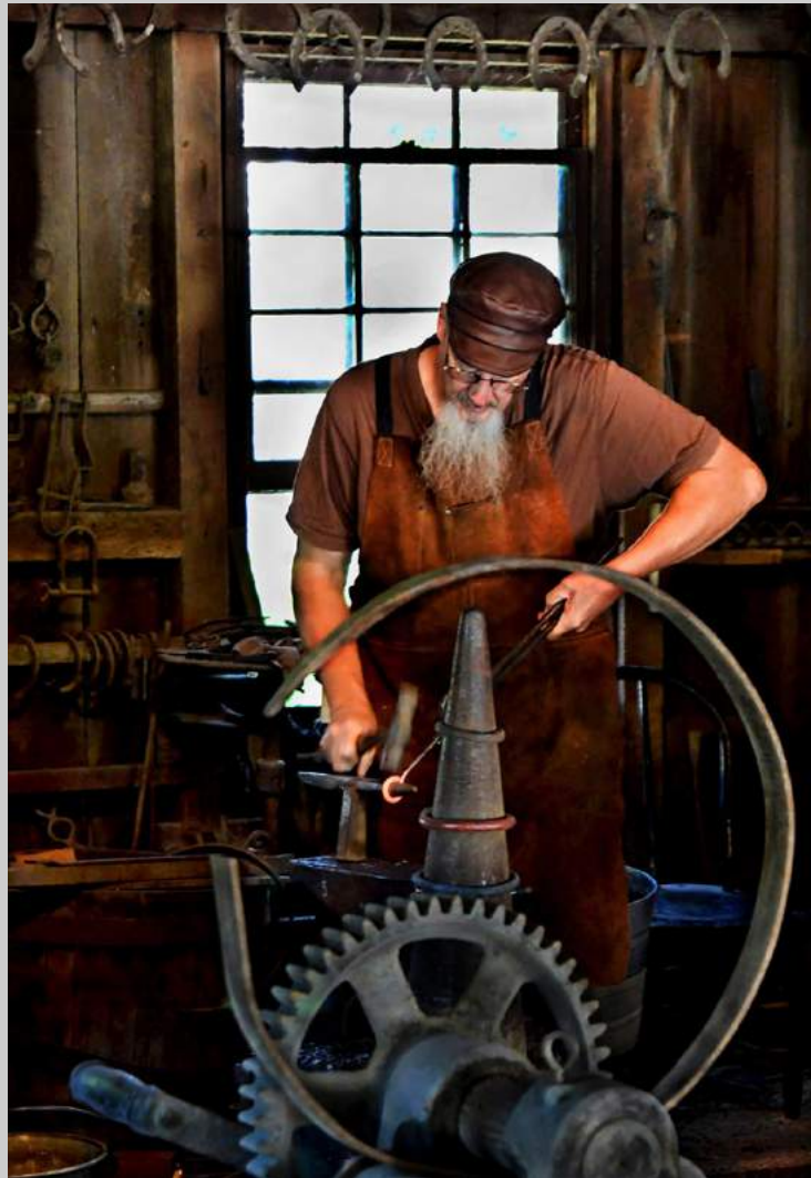
“BLACKSMITH POUNDING HOT IRON” Coachella International Exhibition of Photography Photojournalism General