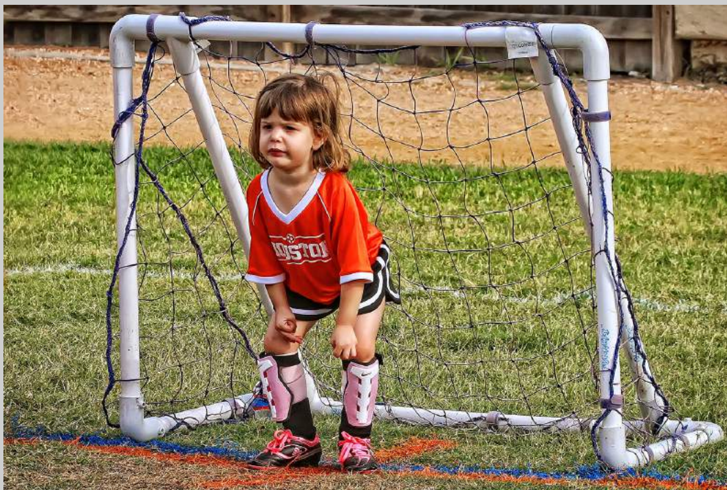
“PROTECT THIS HOUSE” Coachella International Exhibition of Photography Photojournalism Human Interest