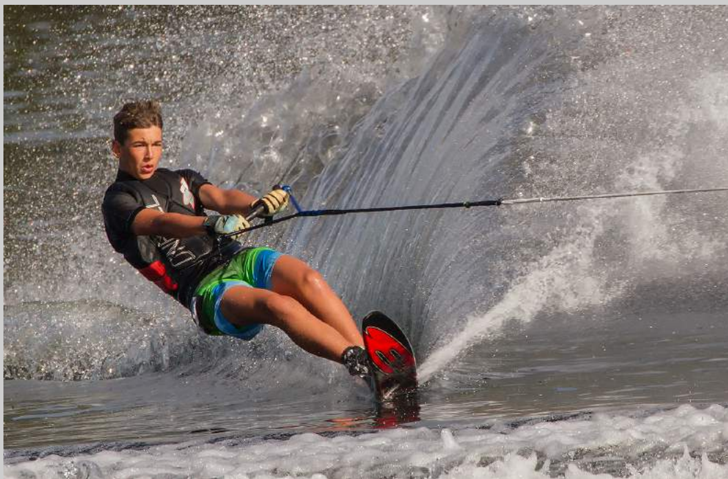
“SKIING ON LAKE KANIERE” © HELEN COOK 2018 Coachella International Exhibition of Photography Photojournalism General