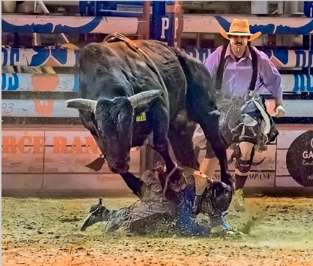
“GETTING STEPPED ON” © TOM SAVAGE, APSA, MPSA 2018 Coachella International Exhibition of Photography Photojournalism General