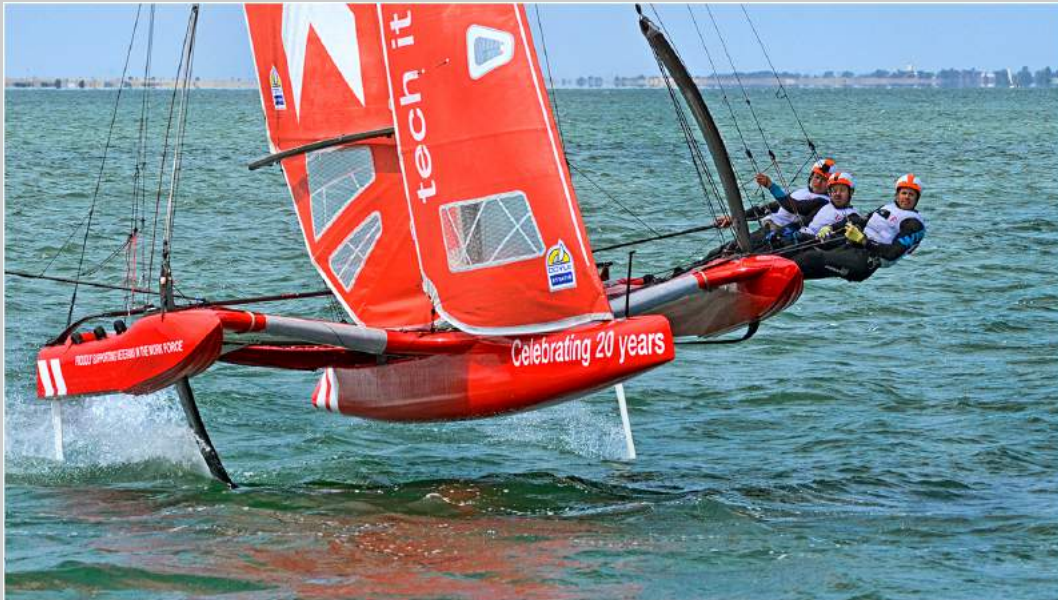
“SUPERFOIL” © FRANCIS KENNEDY, EPSA 2018 Coachella International Exhibition of Photography Photojournalism General