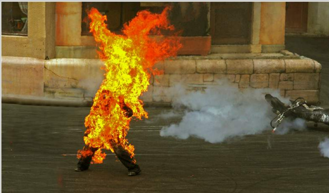
“MAN ON FIRE” © JOHN LARRY 2018 Coachella International Exhibition of Photography Photojournalism Human Interest