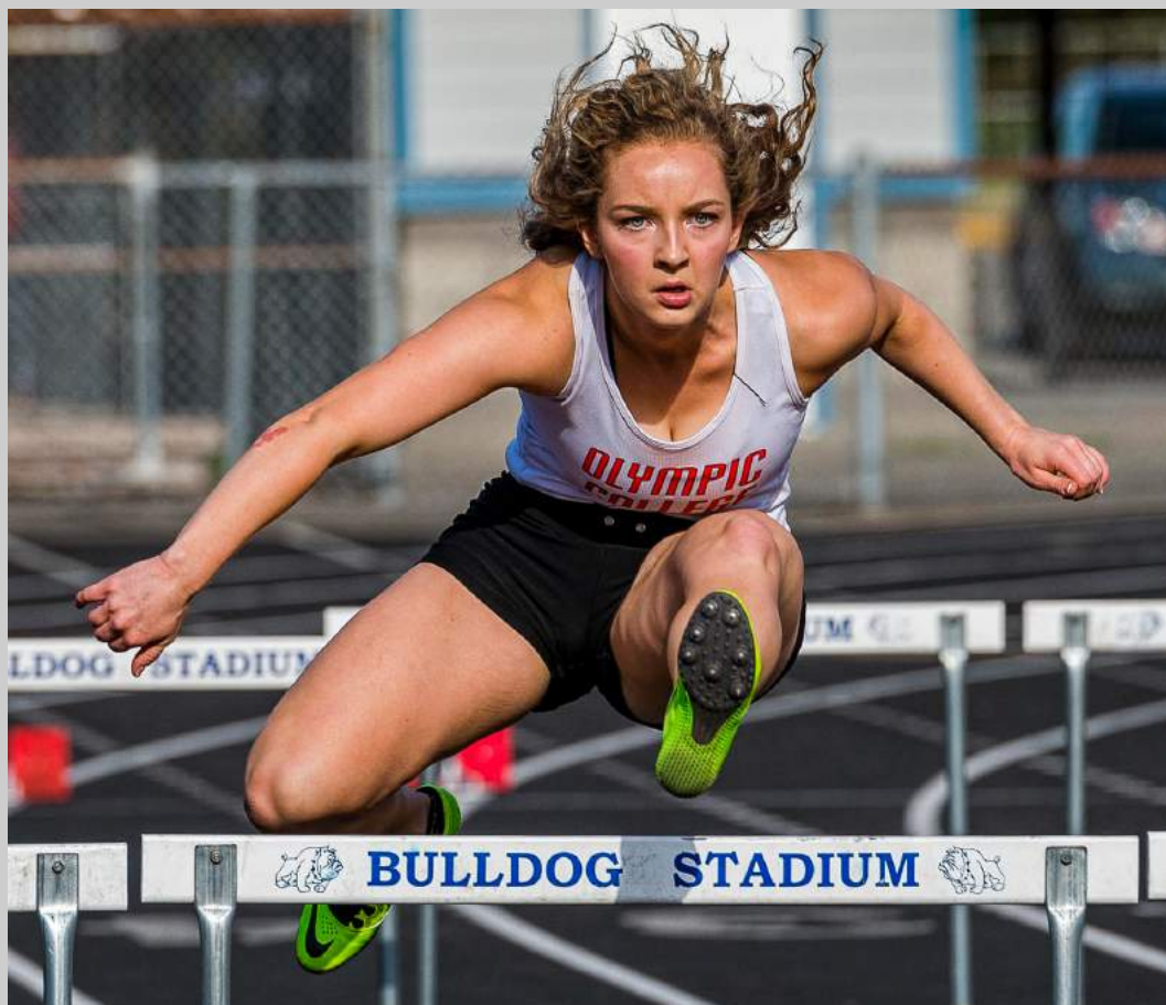
“FOCUSED” © KURT DEVOE 2018 Coachella International Exhibition of Photography Photojournalism General PSA Best of Show Gold