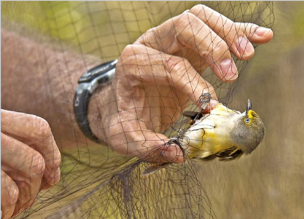
“RELEASING WARBLER FROM NEST” © BARBARA KUEBLER, APSA, MPSA 2018 Coachella International Exhibition of Photography Photojournalism General HM