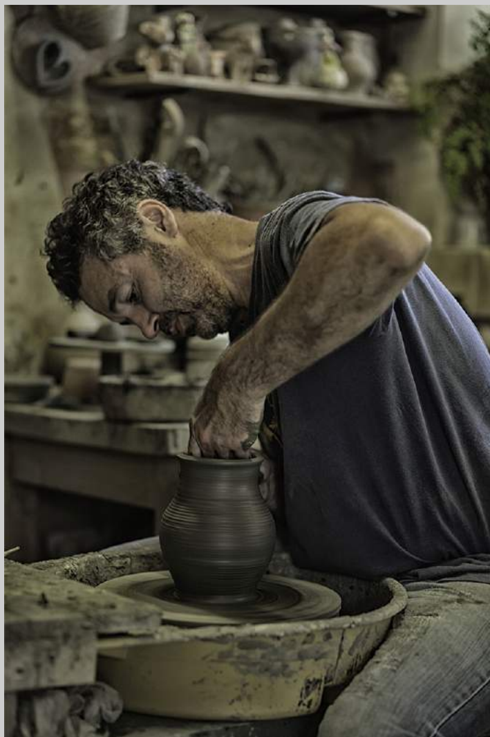
“CLAYPOT INDUSTRY OF TURKEY” © JAMES WAT 2018 Coachella International Exhibition of Photography Photojournalism Human Interest