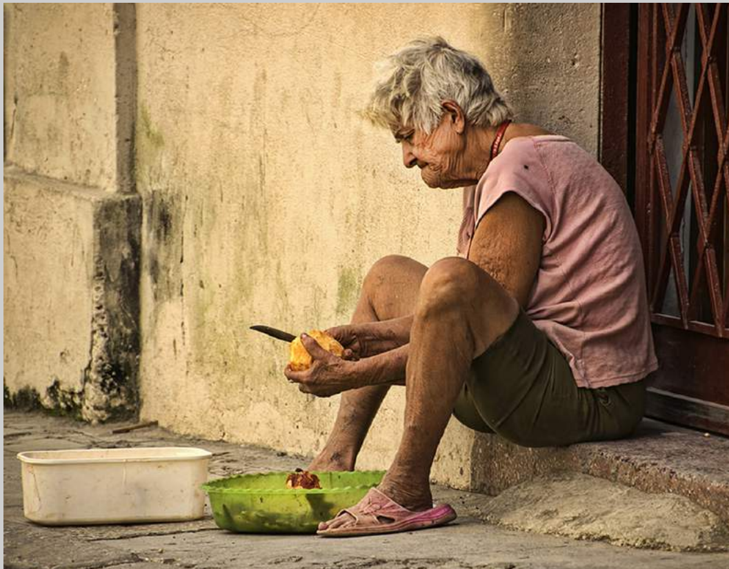
"WOMAN PEELING FRUIT" © BARBARA KUEBLER, APSA, MPSA 2018 Coachella International Exhibition of Photography Photojournalism General