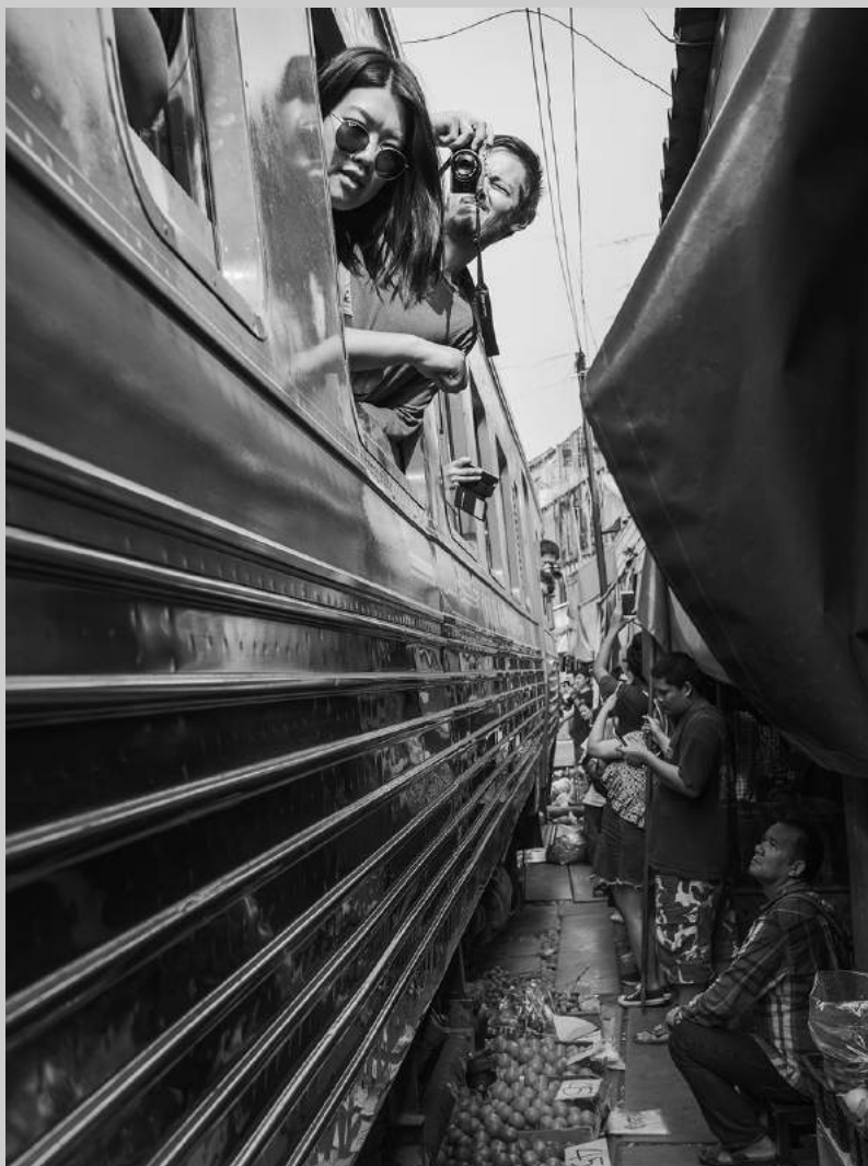
“THAI RAILWAY MARKET” © WEI FU, PPSA 2018 Coachella International Exhibition of Photography Photojournalism General