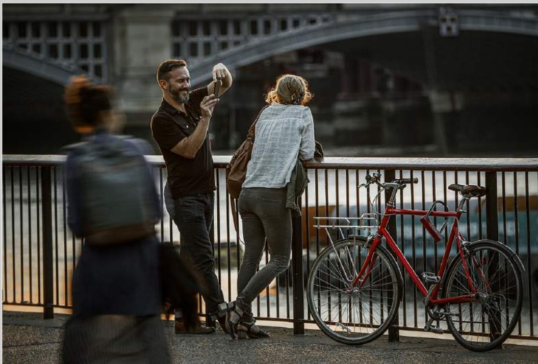
“LOVER 5” © YI WAN, MPSA 2018 Coachella International Exhibition of Photography Photojournalism Human Interest HM