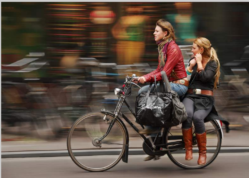
“CITY CYCLISTS” Coachella International Exhibition of Photography Photojournalism General HM