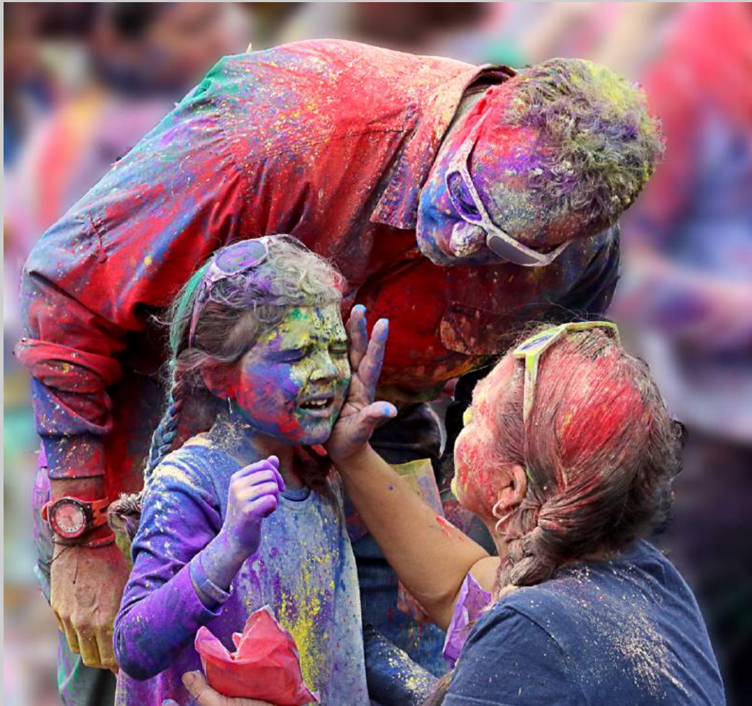
“MOMMY WIPES AWAY MY TEARS” © KIEU-HANH VU 2018 Coachella International Exhibition of Photography Photojournalism General HM