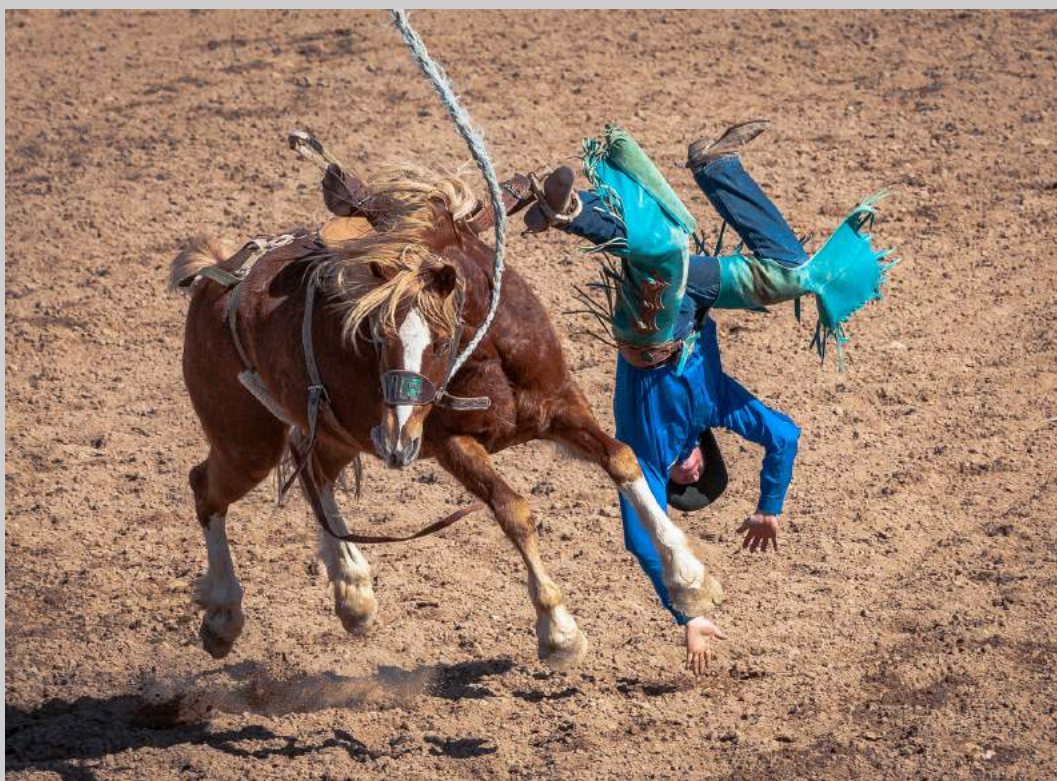
“INVERTED DISMOUNT 7186” Coachella International Exhibition of Photography Photojournalism General