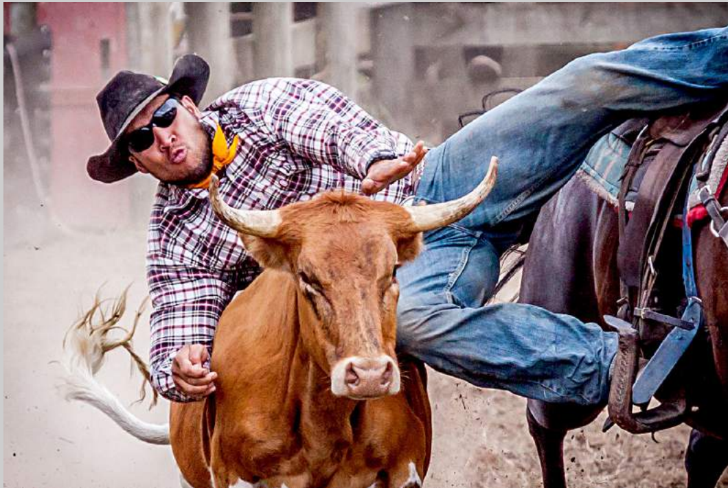
“YOUR MINE” Coachella International Exhibition of Photography Photojournalism General