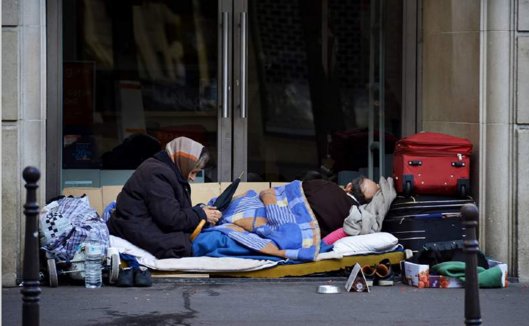
“ANOTHER DAY IN PARIS” Coachella International Exhibition of Photography Photojournalism General