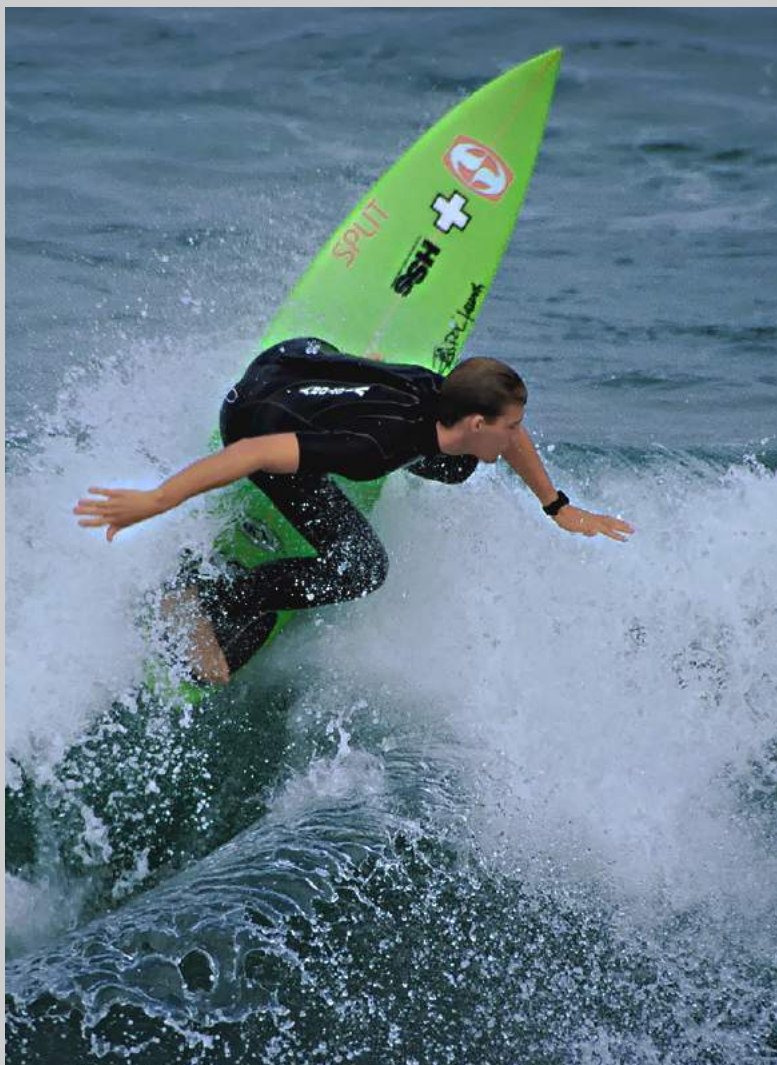
“BALANCING ACT” © DAVID MEISENHEIMER, FPSA, GMPSA 2018 Coachella International Exhibition of Photography Photojournalism General