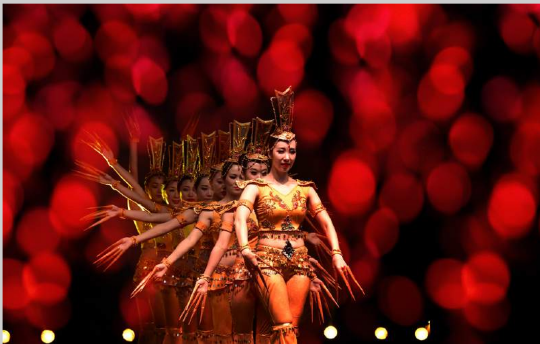
“REDLIGHT ANGELS” © LEE ENG TAN 2018 Coachella International Exhibition of Photography Photojournalism General