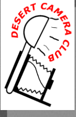
Photo Travel Medals